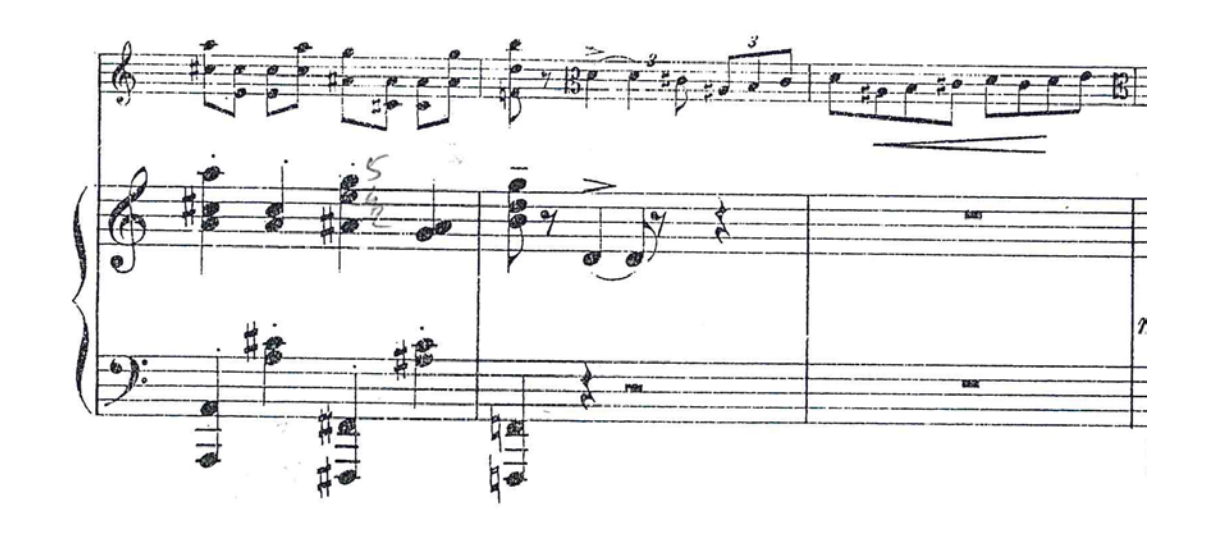
Example 4.3d Vasilenko, Sonata for Viola and Piano, op. 46 , fragment, Fourth section, bars 455-457 (Moscow: Gosudarstvennoe muzykal'noe izdatel'stvo, 1925), 30-31.