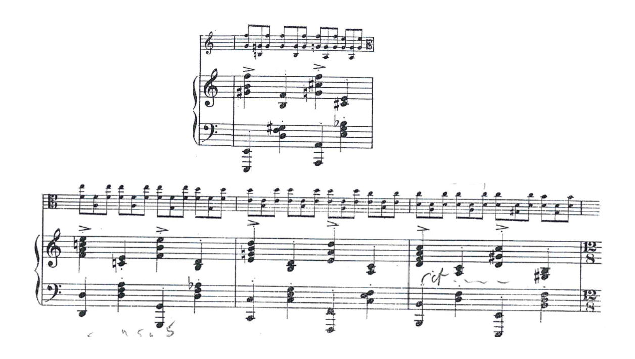
Example 4.3c Vasilenko, Sonata for Viola and Piano, op. 46 , fragment, Third section, bars 345-349 (Moscow: Gosudarstvennoe muzykal'noe izdatel'stvo, 1925), 22-23. Reproduced by permission of the Library of the Union of Composers of the Russian Federation, Moscow.