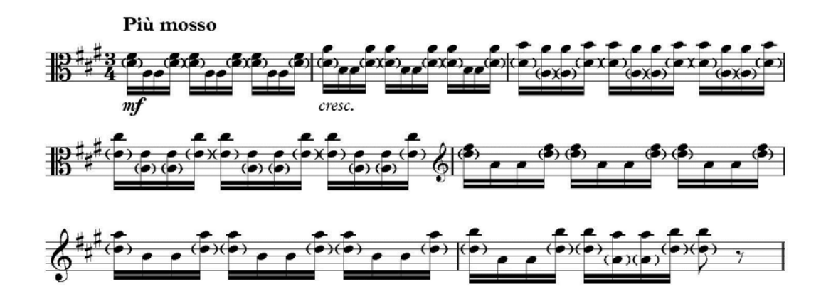
Example 3.5.1 Vasilenko, Knights , fragment, Piu mosso , bars 101-107 (Moscow: Gosudarstvennoe muzykal'noe izdatel'stvo and Wien, New York: Universal Edition, 1932), 2. Reproduced by permission of Universal Edition.

because of their instrumental inconvenience. They unnecessarily overburden the texture of both instrumental parts that are already intensified by continuous semi-quaver rhythmic patterns, broad use of registers and chords in the piano part. This section gains better articulation and expression, when one slightly modifies and lightens the texture of these double-stops.