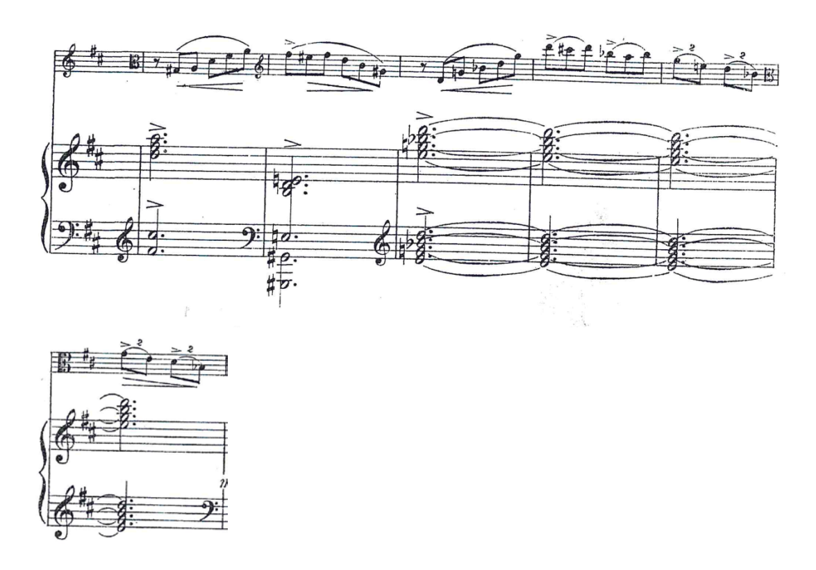
Example 4.4.3b Vasilenko, Sonata for Viola and Piano, op. 46, fragment, Fourth section/Coda, bars 499-503 (Moscow: Gosudarstvennoe muzykal'noe izdatel'stvo, 1925), 33. Reproduced by permission of the Library of the Union of Composers of the Russian Federation, Moscow.

Here they frequently reach the top notes of the viola's playing range. This feature became distinctive of viola music towards the second half of the twentieth century, but was hardly ever employed in the music in the early 1920s. Moreover, Vasilenko's further comments give an explanation of his particular choice of a solo instrument, which lend special significance to the analysis of this sonata and provide