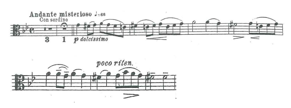
Example 5.2c Vasilenko, Madonna Tenerina , fragment, Andante misterioso , bars 1-11 (Moscow: Gosudarstvennoe muzykal'noe izdatel'stvo and Wien, New York: Universal Edition, 1932), 2. Reproduced by permission of Universal Edition.

Tenerina from the Four Pieces on Themes of Lute Music of the Sixteenth-Seventeenth Centuries, op. 35, for viola and piano written in 1918. The Madonna Tenerina is based on an instrumental sample of early music from Italy that Vasilenko discovered in archives. The outcome of Vasilenko's stylization in the lute pieces is very appealing and thoughtful, and communicates with a contemporary audience without requiring knowledge of all the details of the Baroque style and mentality. Moreover, the austere minimalism without any embellishments of the first theme of the Madonna Tenerina in conjunct motion that gives the impression of "tramping" backwards and forwards between the pitches E, F#, G and A does not develop any further and reminds one of the ascetic simplicity, plainness and steadiness of the monodic chants. In addition, the narrative qualities of this musical prayer addressed to the Virgin Mary are distinct from the very first bars.