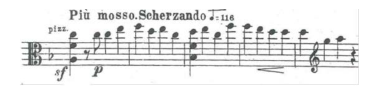
Example 3.5.3b Vasilenko, Serenade for the Lady of my Heart, fragment, Meno mosso, bars 84-88 (Moscow: Gosudarstvennoe muzykal'noe izdatel'stvo and Wien, New York: Universal Edition, 1932), 2. Reproduced by permission of Universal Edition.