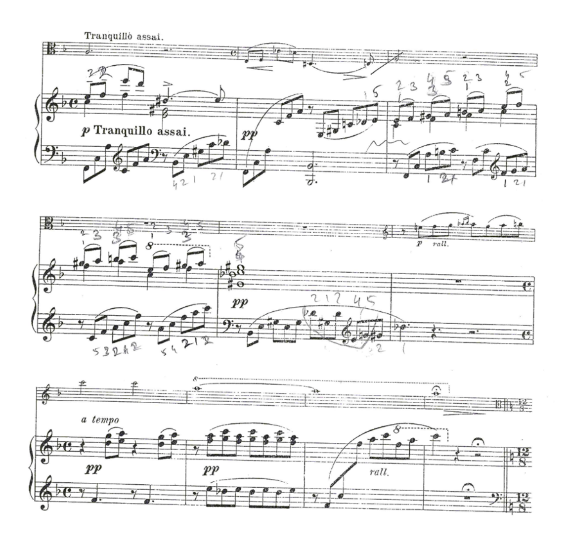
Example 4.3g Vasilenko, Sonata for Viola and Piano, op. 46, fragment, Fourth section, bars 440-442 (Moscow: Gosudarstvennoe muzykal'noe izdatel'stvo, 1925), 30. Reproduced by permission of the Library of the Union of Composers of the Russian Federation, Moscow.