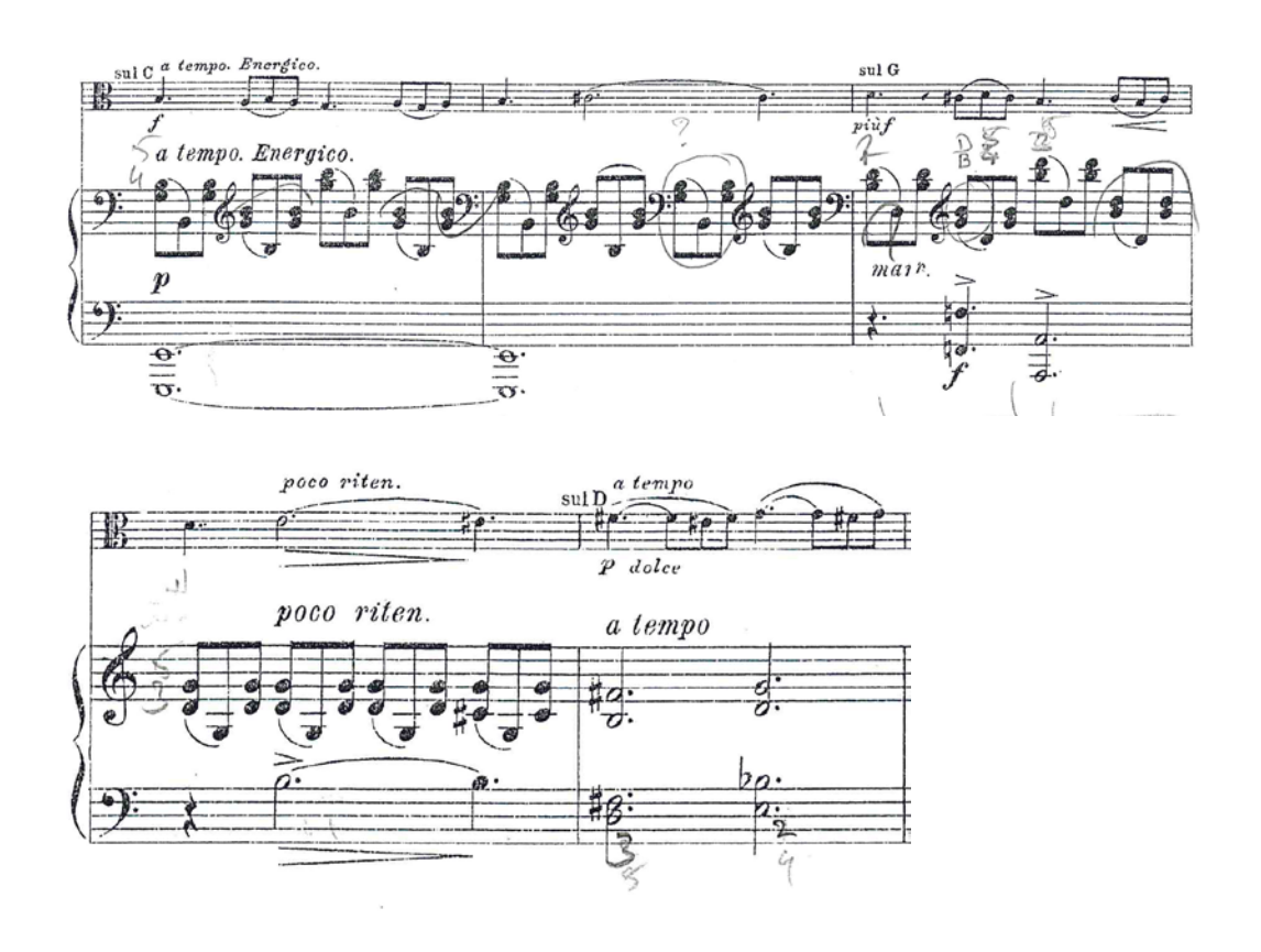
Example 4.4.3a Vasilenko, Sonata for Viola and Piano, op. 46 , fragment, First section/Exposition, bars 124-128 (Moscow: Gosudarstvennoe muzykal'noe izdatel'stvo, 1925), 11. Reproduced by permission of the Library of the Union of Composers of the Russian Federation, Moscow.

This unusual repositioning implies that the composer was looking for a distinctive colour and timbre effect of a rich, deep and expressive tone production. It is interesting to compare this feature with Vasilenko's perception of viola qualities described in his book about instrumentation. He emphasized that the viola does not possess exceptional qualities in the middle register due to a certain nasal effect in its timbre. In his opinion, the high register exhibits broad expressive possibilities, <sup>245</sup> the qualities that Vasilenko unreservedly demonstrated and enhanced in the sonata.