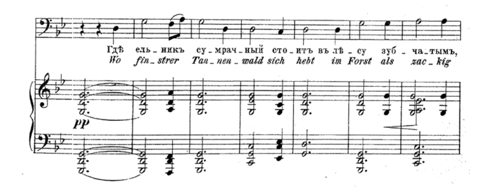
Vasilenko, Vir', fragment, Moderato, bars 7-15: Sergei Vasilenko, Dve poemy dlia basa s orkestrom, op. 6. Perelozhenie dlia basa s fortepiano. Vir', slova Ivana Bunina. Vdova, slova Iakova Polonskogo [Two Poems for Bass with Orchestra, op. 6. Arrangement for Bass and Piano. 'Vir', Text by Ivan Bunin. 'Widow', Text by Iakov Polonskii] (Moscow, Leipzig: Jurgenson, 1905), 3.

poetry with the same titles by Ivan Bunin and Iakov Polonskii respectively, and dedicated by Vasilenko to Fedor Shaliapin. The first poem is in G minor. It depicts an Old Believers' hermitage hidden in a dark wood and protected by a wild bird called vir' . The bell ringing for evening prayer and the smoky flames of candles enrich the mysteriousness of the ascetic harsh habitat of the worshipers. Its sombre ritual melody written in the low register, gradually gains almost continuous note repetition, similar to Vasilenko's writing in the cantata Kitezh .