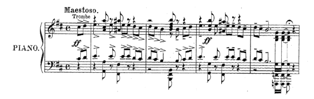
Example 5.2b Bog Gospod'. The original Old Believers znamennyi tune no. 7: Fond znamennykh pesnopenii [Fund of Znamennyi Chants]. <a href="http://znamen.ru">http://znamen.ru</a>

Vasilenko, Skazanie o velikom grade Kitezhe i tikhom ozere Svetoiare, op. 5, fragment, Maestoso, bars 1-4: Sergei Vasilenko, Vstuplenie i ariia gusliara. Skazanie o velikom grade Kitezhe i tikhom ozere Svetoiare, op. 5 [The Introduction and Aria of a Gusli Player. The Legend of the Great City of Kitezh and the Quiet Lake Svetoyar] (Moscow, Leipzig: Jurgenson, 1902), 3. Reproduced by permission of the British Library, London.