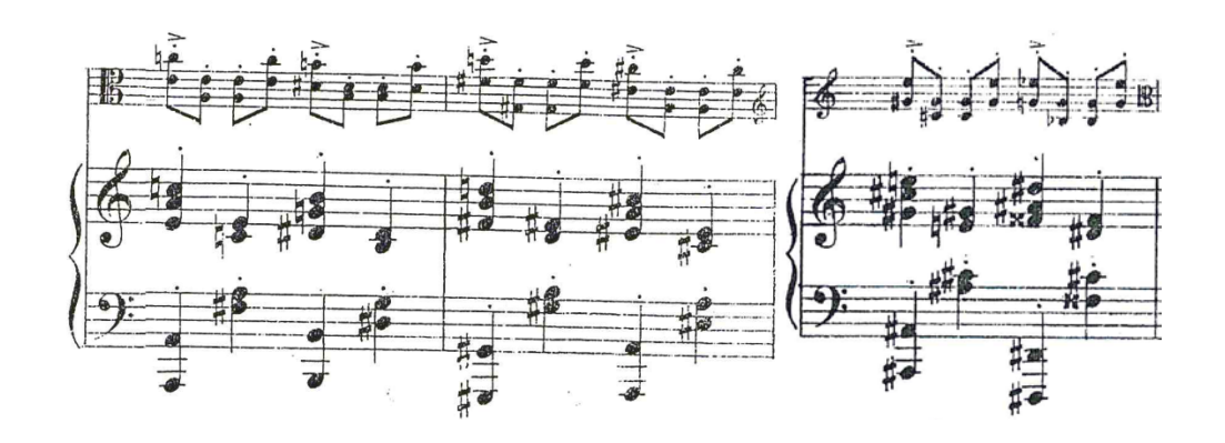
Example 4.3e Vasilenko, Sonata for Viola and Piano, op. 46 , fragment, Fourth section, bars 470-476 (Moscow: Gosudarstvennoe muzykal'noe izdatel'stvo, 1925), 31. Reproduced by permission of the Library of the Union of Composers of the Russian Federation, Moscow.