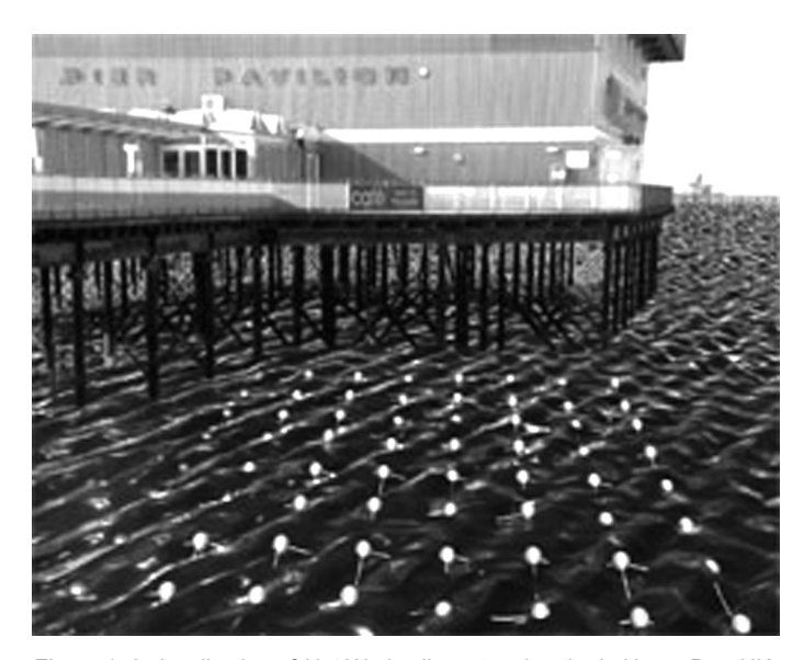
Figure 1. A visualisation of Net Work adjacent to the pier in Herne Bay, UK.

Downloaded by [Goldsmiths, University of London] at 01:43 28 January 2014