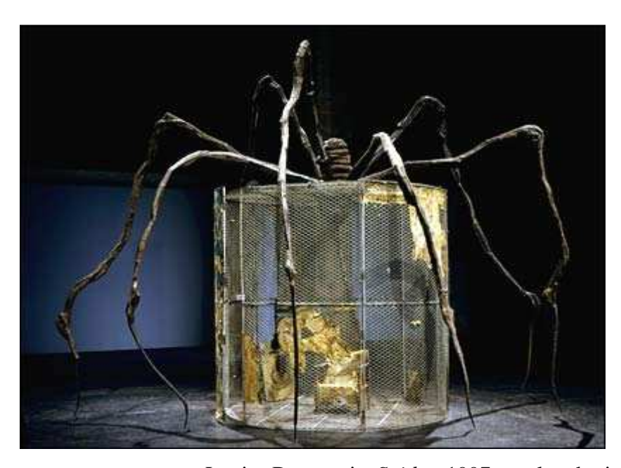
Louise Bourgeois, Spider, 1997, steel and mixed media