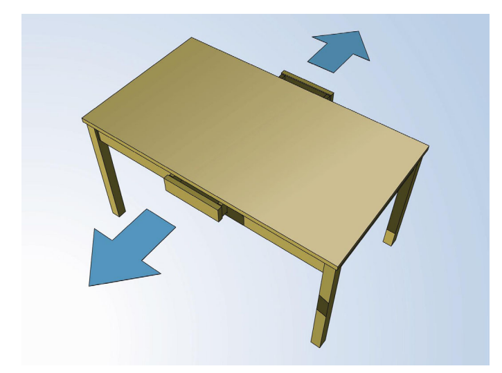
Figure 3: The Shared Drawer

Some of examples do not rely upon technology to function, but use their physical design to promote sharing by forcing co-operation. The Shared Drawer (see Figure 3), for instance, is a single drawer housed in a double face-to-face workstation. The drawer can be accessed from both ends, but is longer than it's housing in the desk and so it can never be fully open or closed to both users at the same time. This proposal seeks to promote compromise between the two users, who would have to frequently negotiate the drawer's state.