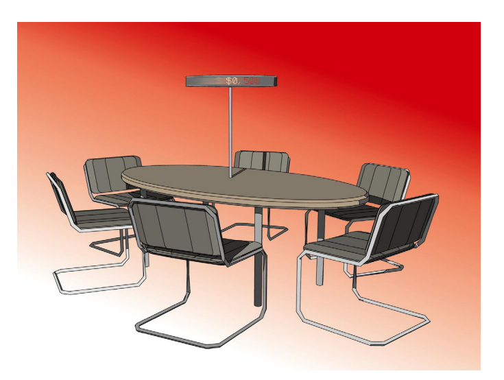
Figure 2: The Meeting Cost Counter

meeting (including overheads). This information is then displayed on the circular screen mounted above the meeting table, which updates every second.