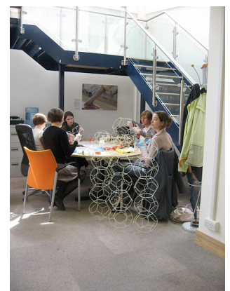
Figure 2. NFP Synergy grow-kit workshop, weaving a vertical structure