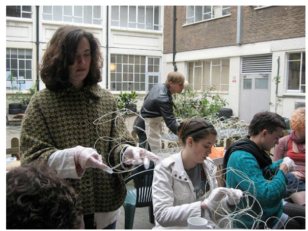
Figure 4. Byam Shaw grow-kit workshop, students weaving a vertical structure