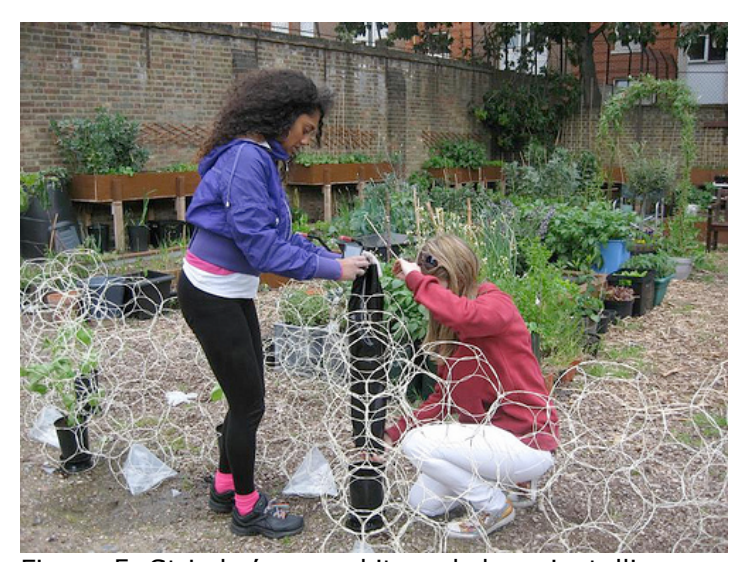
Figure 5. St.Luke's grow-kit workshop, installing a vertical structure in the allotment site