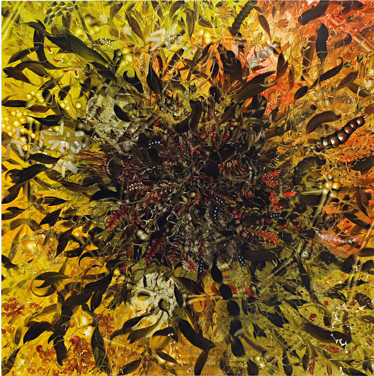
5. Neuronic Plasticity , 2008, oil on canvas 51 x 51 in.