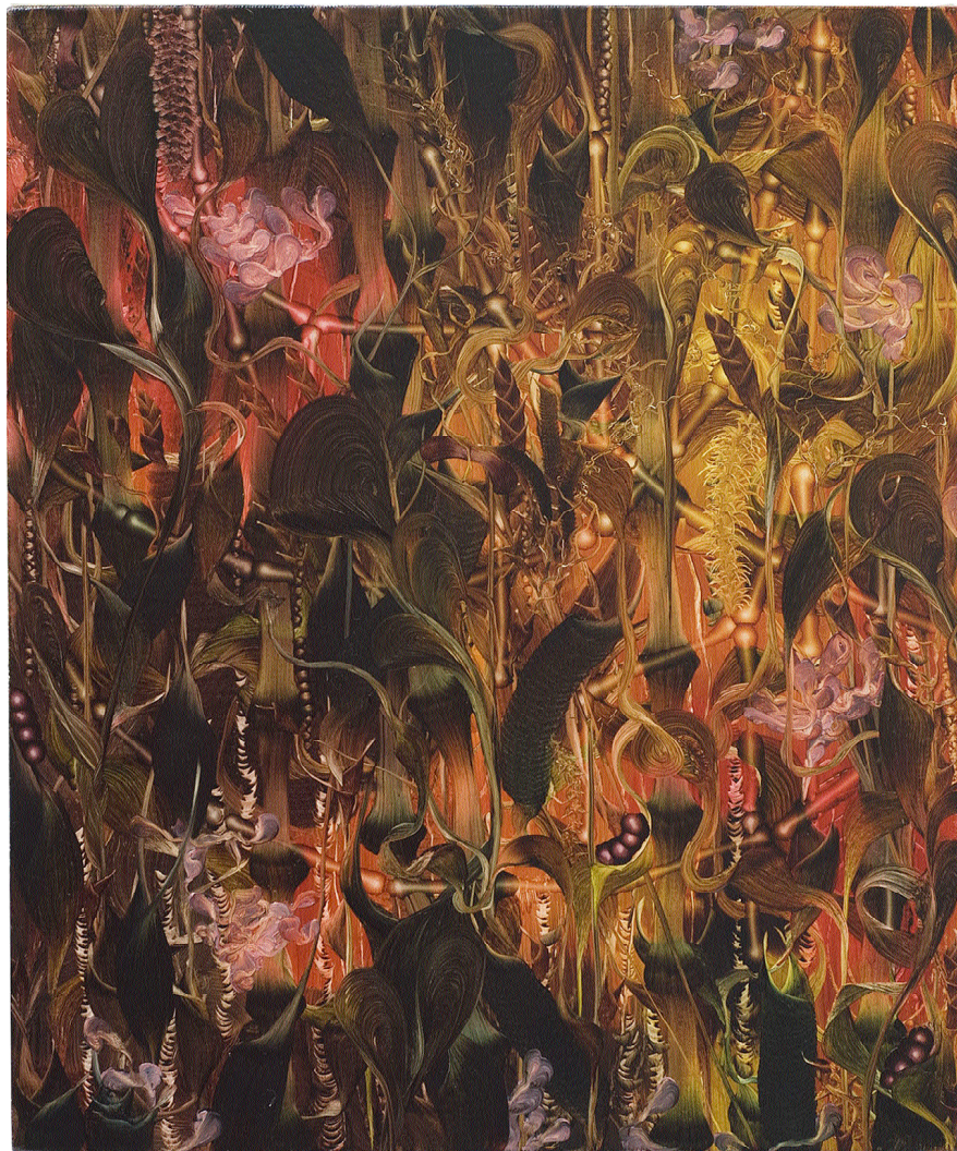
13. Dark Rumor , 2009, oil on canvas, 14 1 / 4 x 11 3 / 4 in.