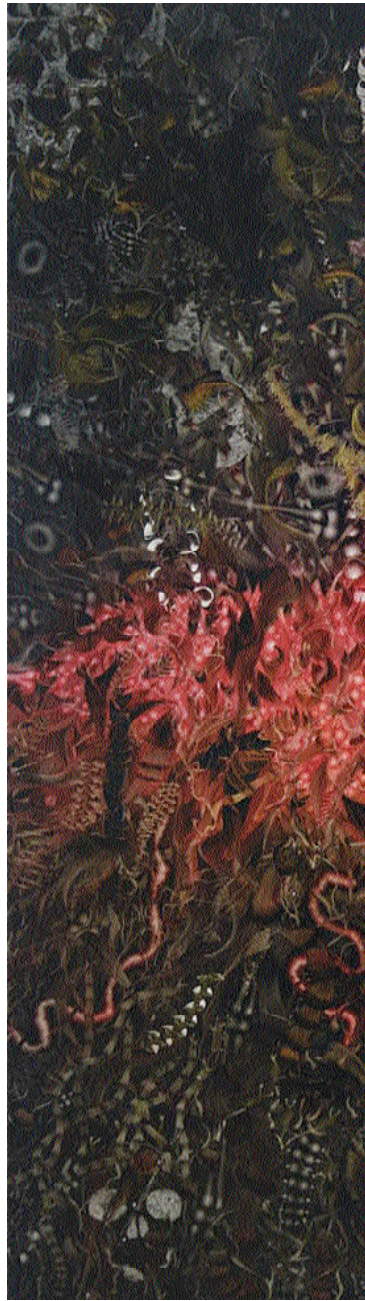
9. Feast of Skulls , 2008, oil on linen, 78 x 120 in.