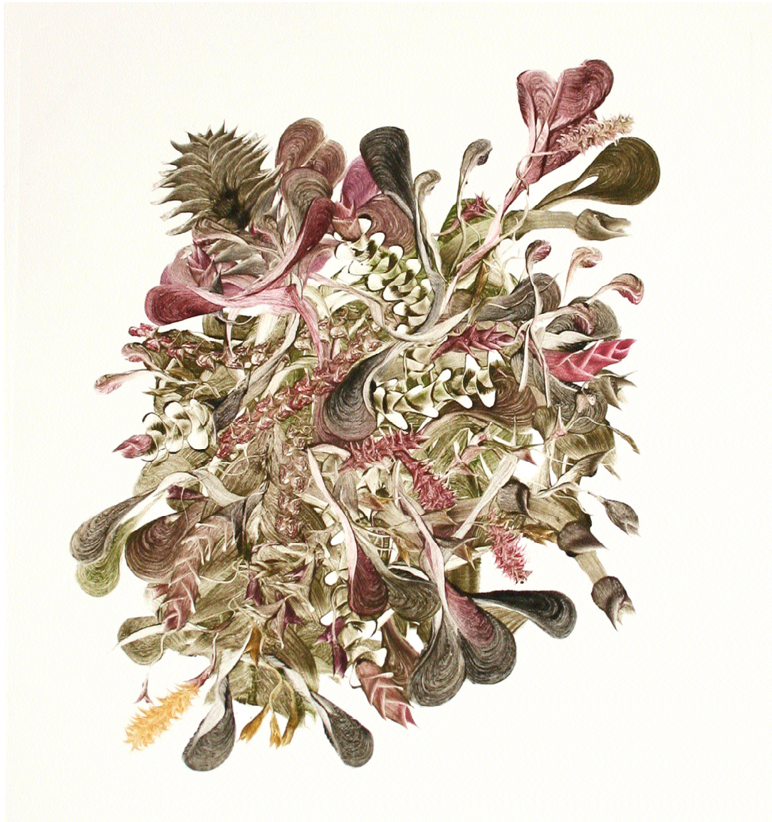
21. Untitled , 2009, oil monotype, 9 1/2 x 8 1/2 in.