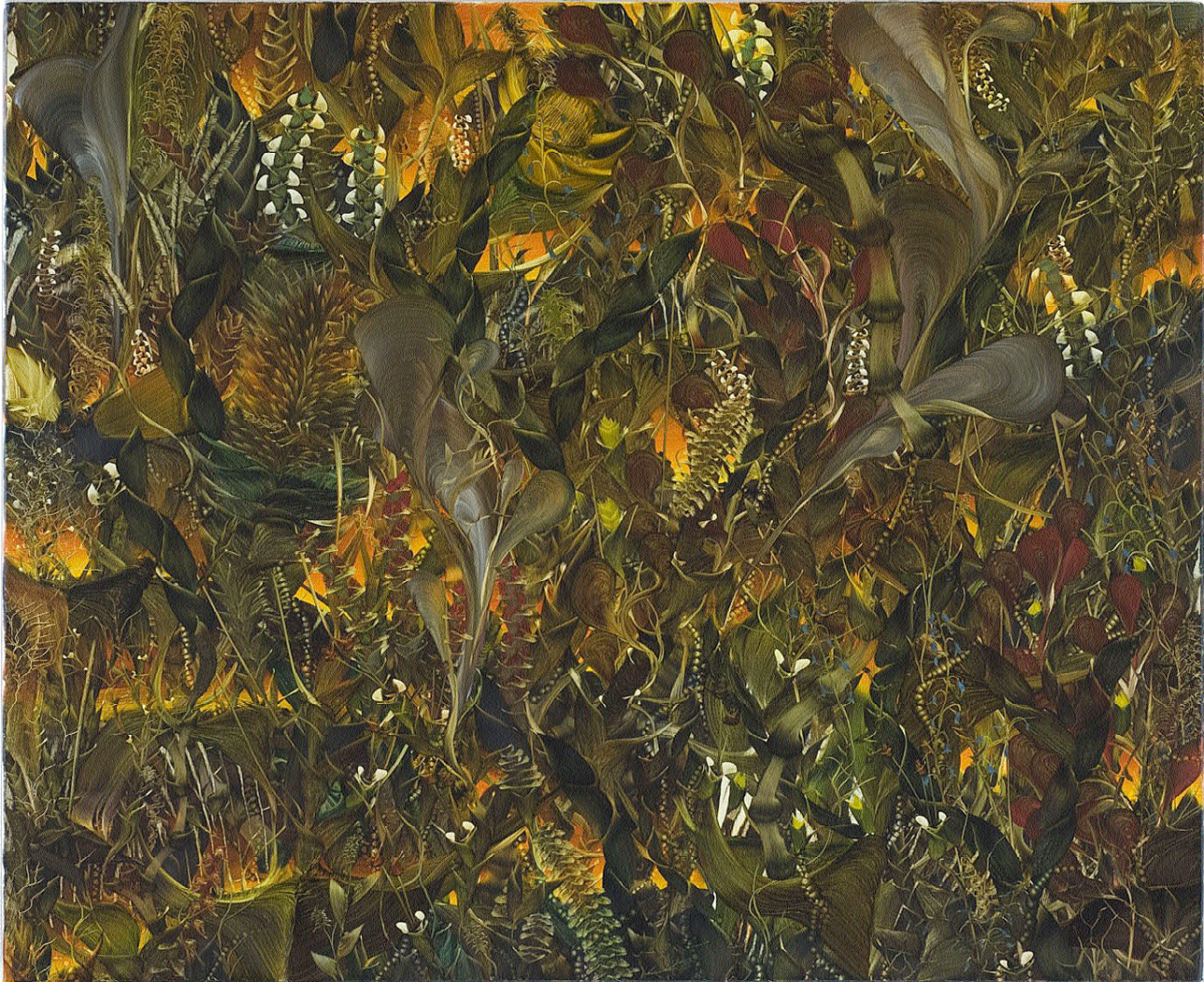
8. Fear of Riot , 2009, oil on canvas, 17 3 / 4 x 21 3 / 4 in.