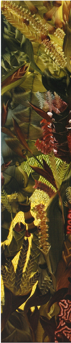
10. The God Particle , 2008, oil on linen, 43 1/4 x 71 in.