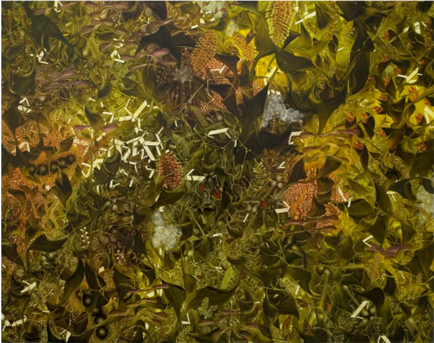
7. Dancing Mania , 2008, oil on linen, 37 1/2 x 47 1/4 in.