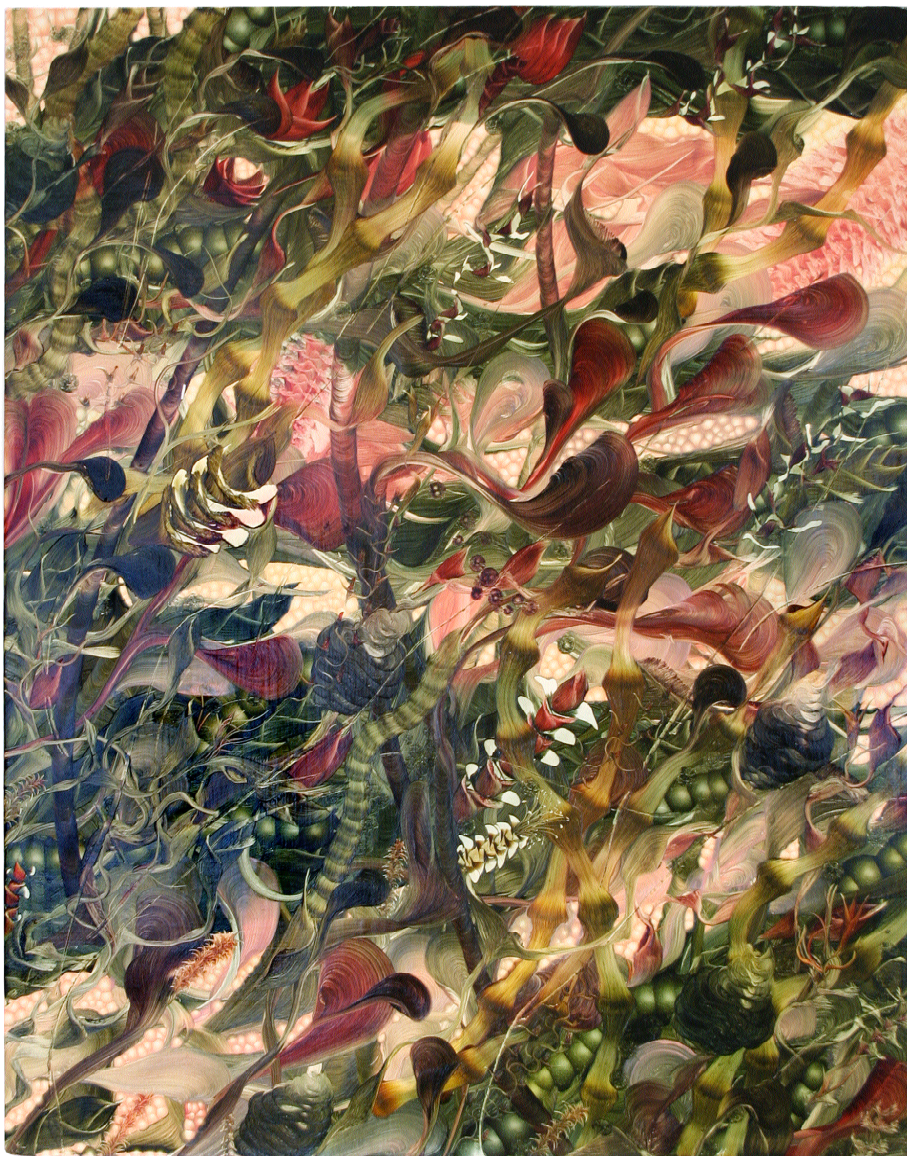
12. Choreomaniacs , 2009, oil on linen, 19 3 / 4 x 15 3 / 4 in.