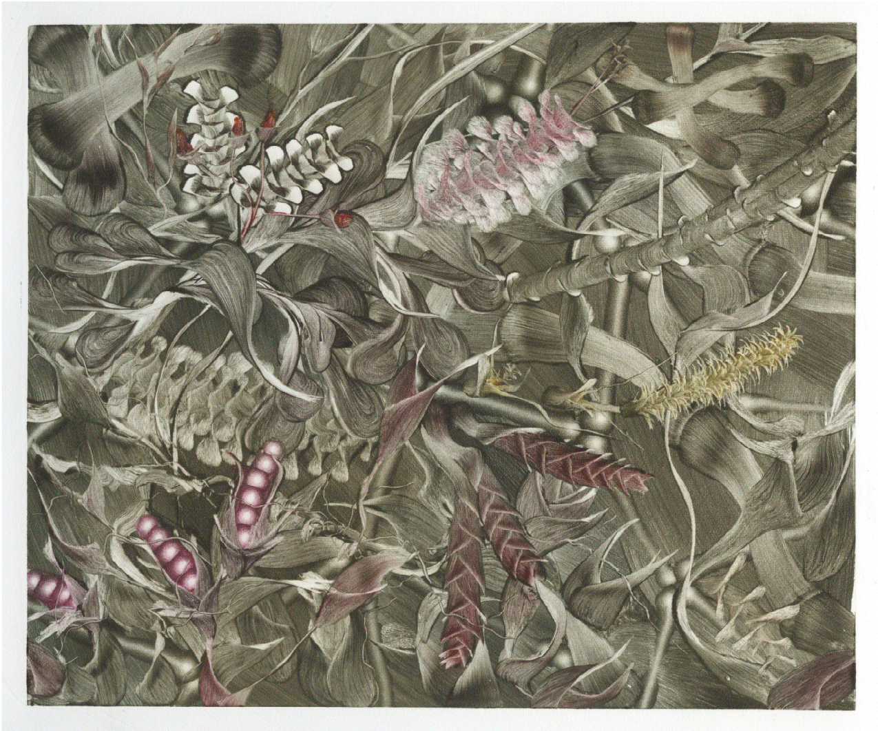
15. Untitled , 2009, oil monotype, 7 x 8 3 / 8 in.