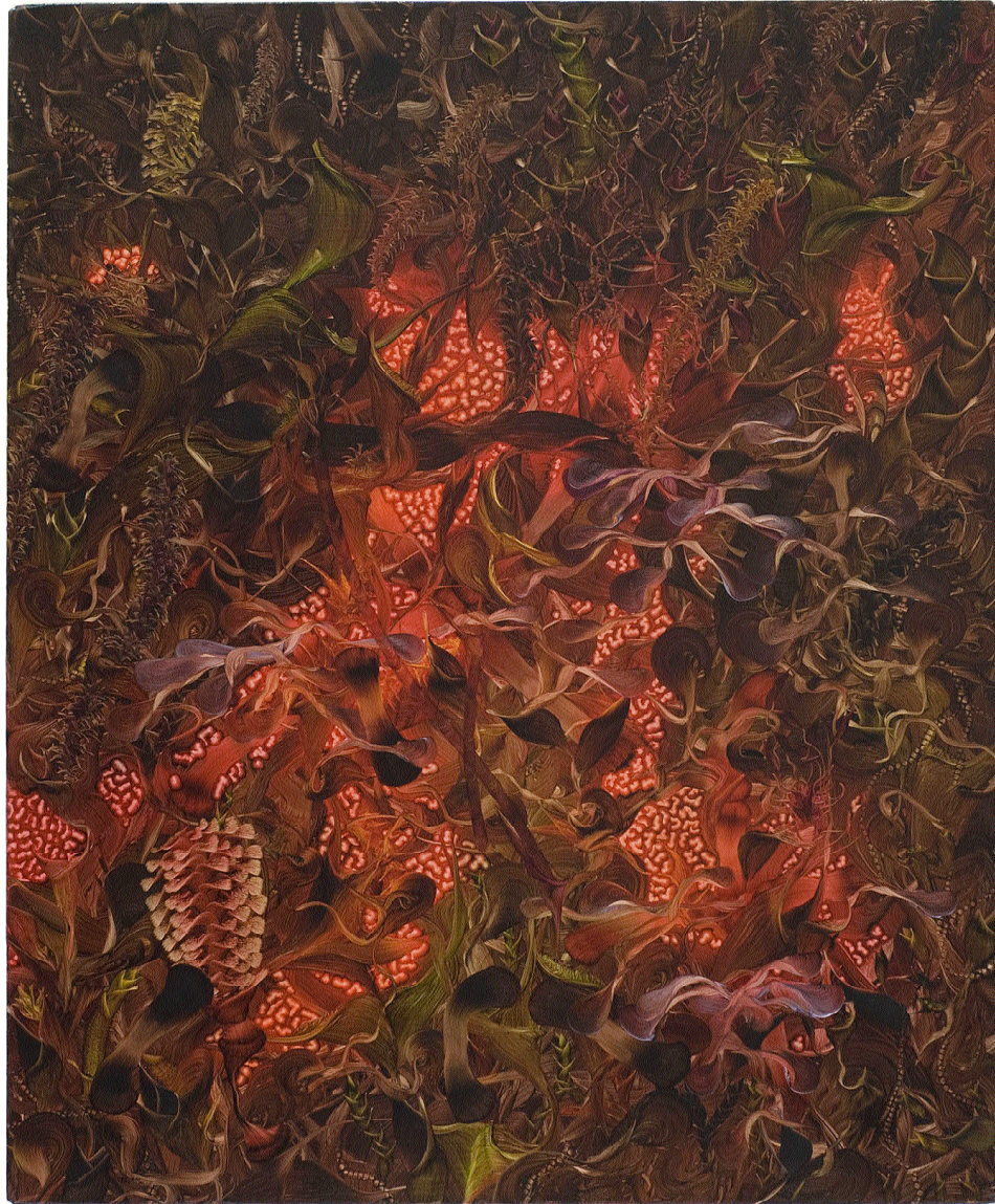
11. Of Music and Hot Blood , 2009, oil on linen, 21 3 / 4 x 17 3 / 4 in.