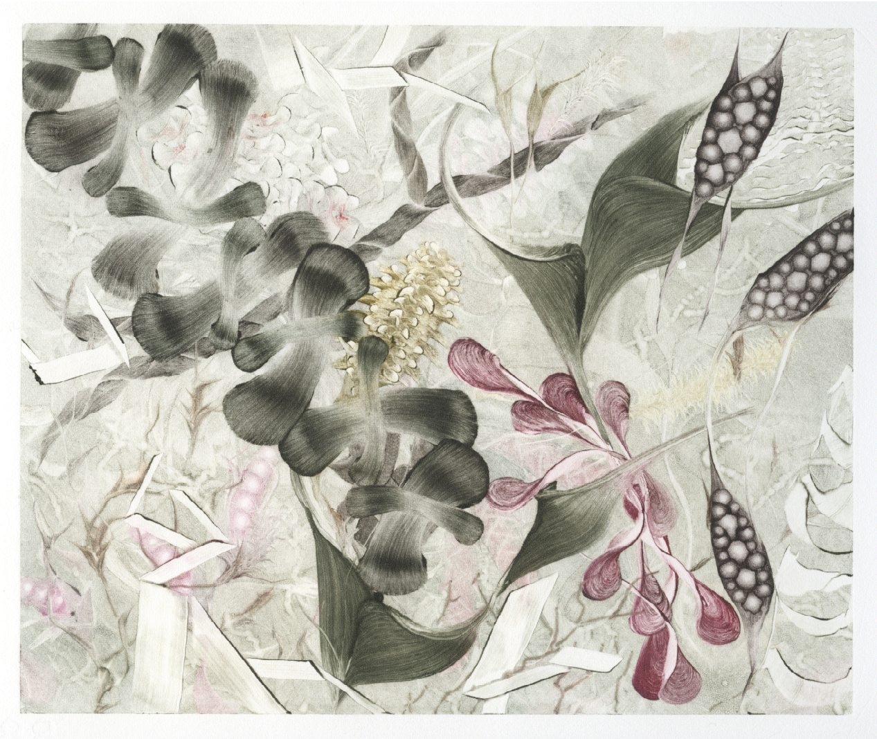
18. Untitled , 2009, oil monotype, 7 x 8 3 / 8 in.