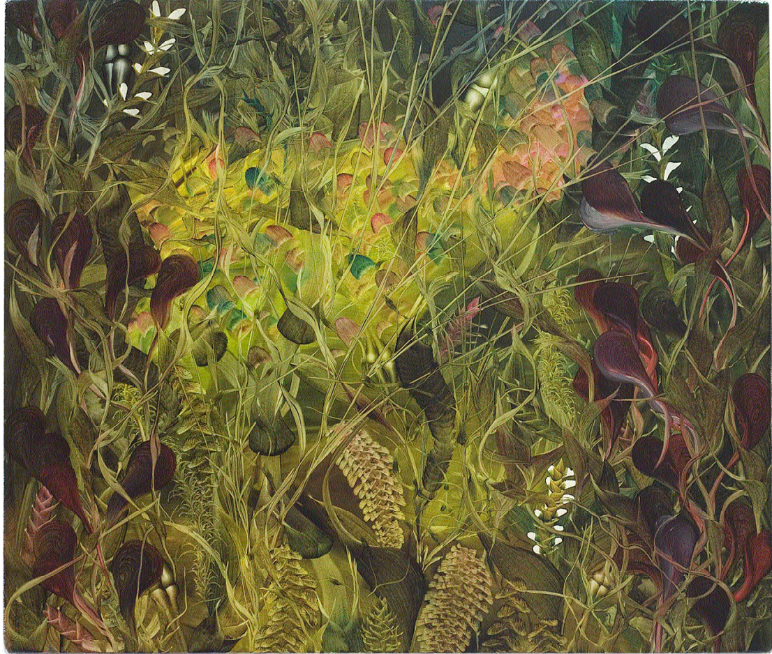
14. Bundschuh , 2009, oil on canvas, 11 3 / 4 x 14 1 / 4 in.