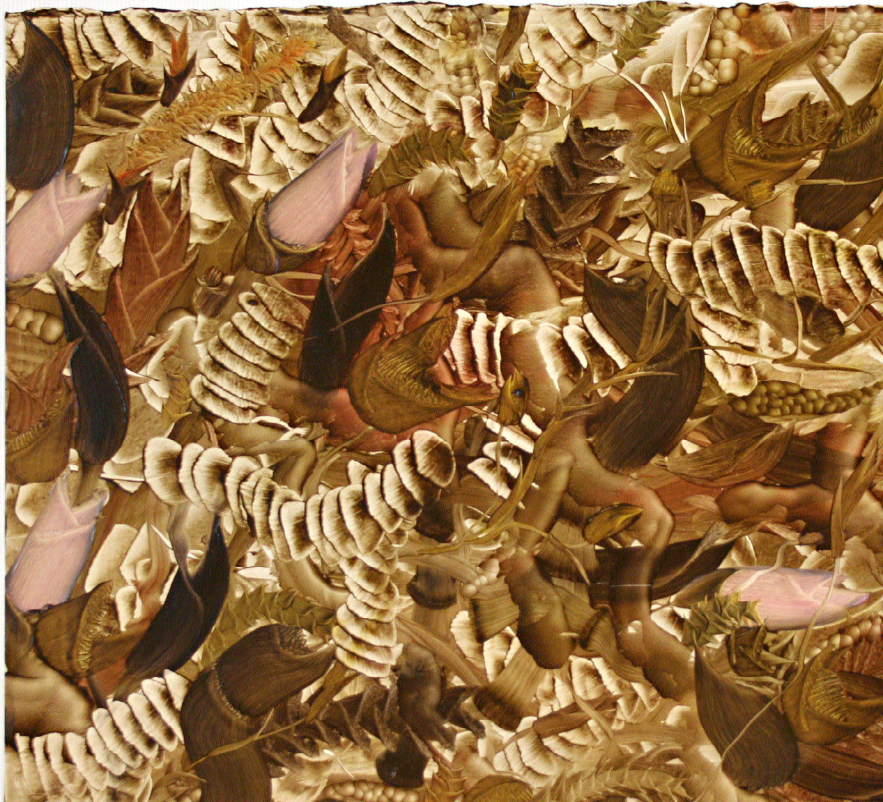
24. Untitled , 2009, oil on paper, 11 3 / 4 x 16 in.