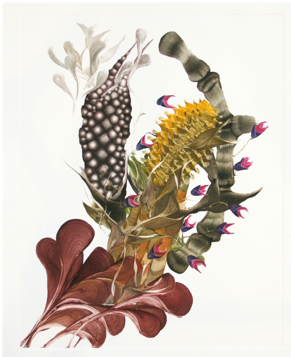
22. Untitled , 2009, oil monotype, 11 x 8 1/2 in.