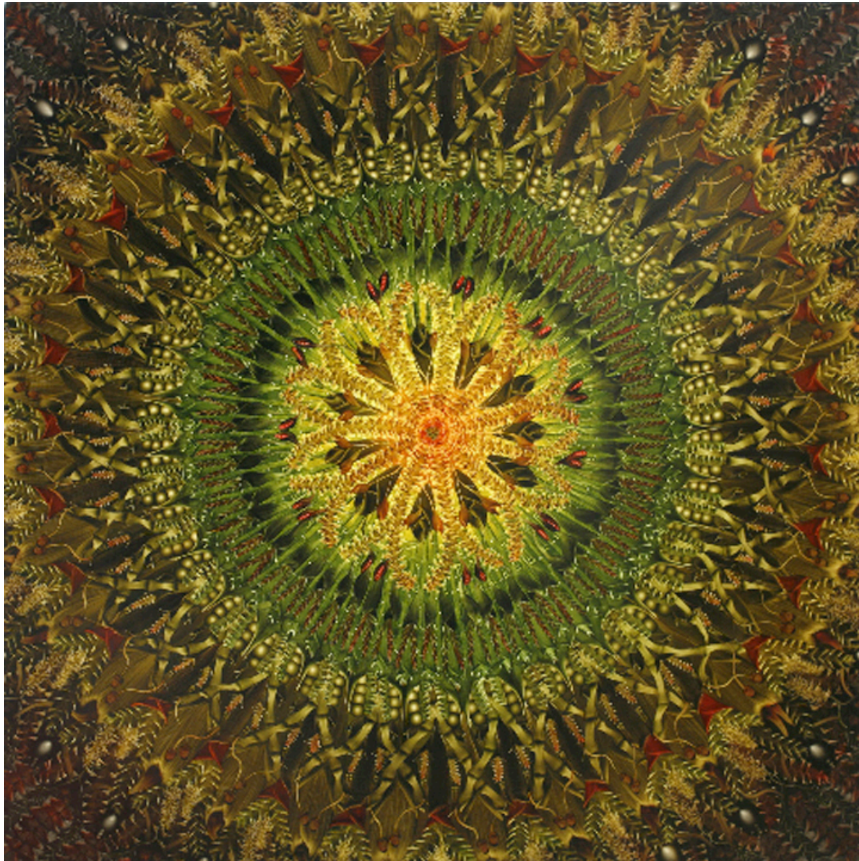
4. Replicator , 2008, oil on linen 51 x 51 in.