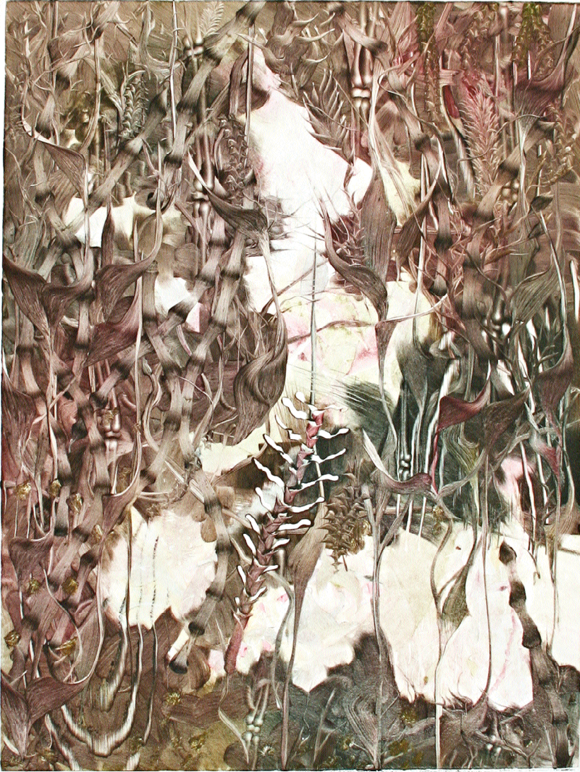
20. Untitled , 2009, oil monotype, 15 x 11 in.