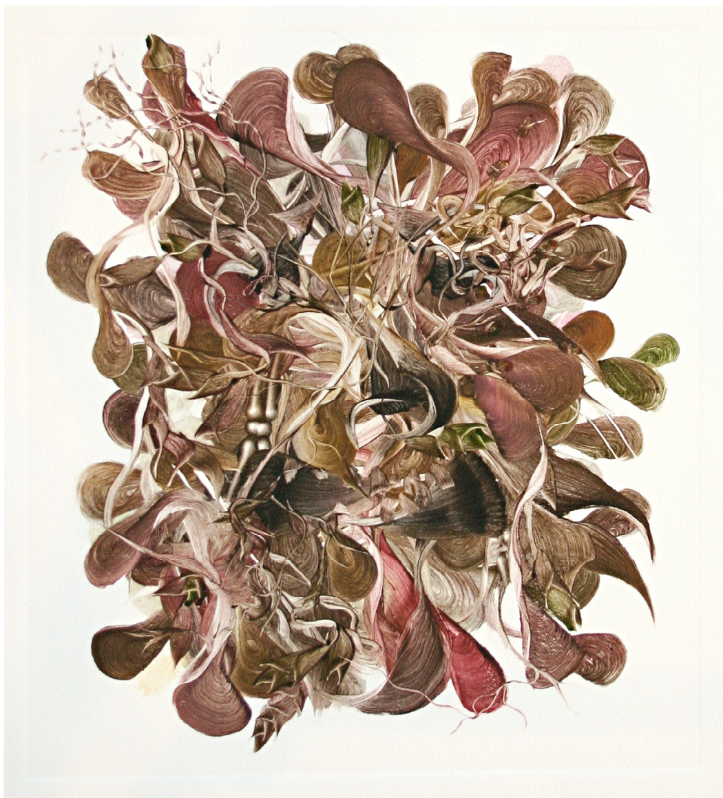
17. Untitled , 2009, oil monotype, 9 1/2 x 8 1/2 in.