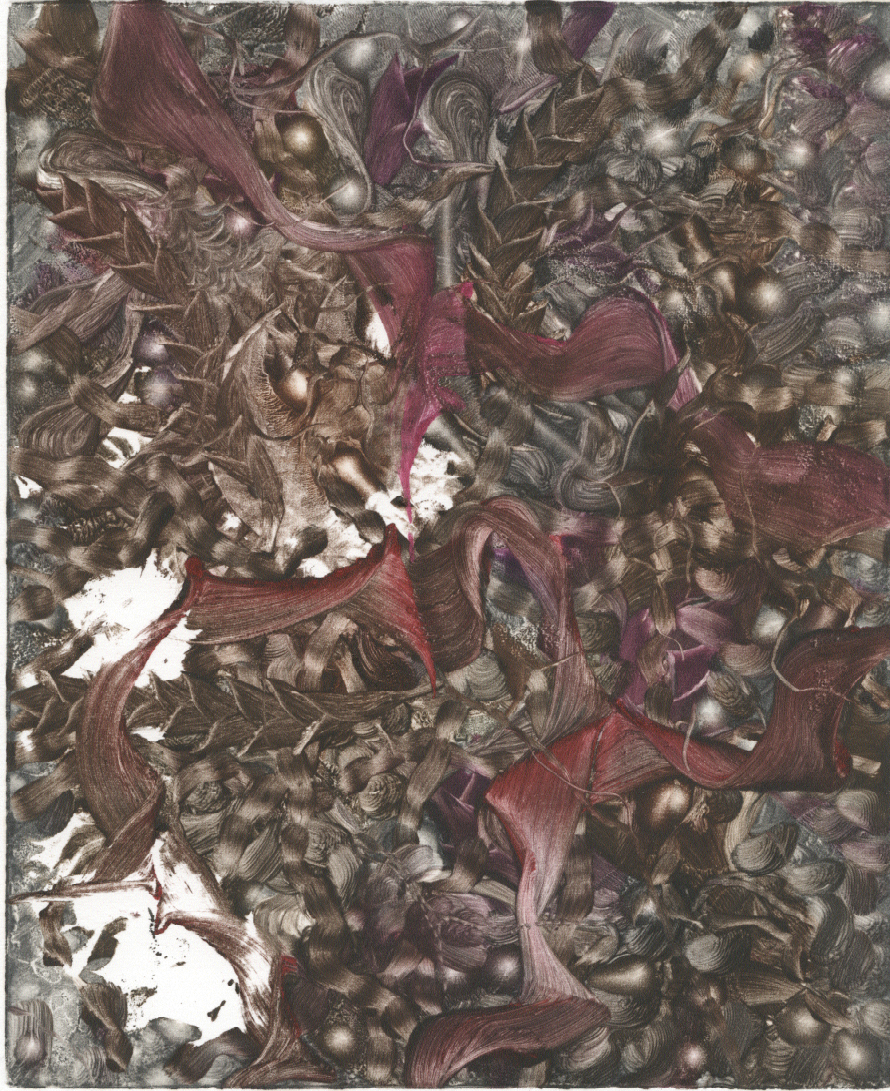
16. Untitled , 2009, oil monotype, 8 1/4 x 6 3/4 in.