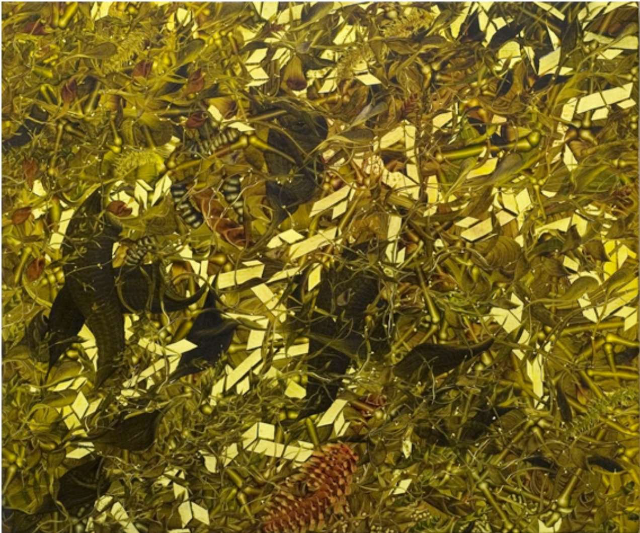
3. Riebeck's Hedge , 2008, oil on linen 17 3 / 4 x 21 1 / 4 in.