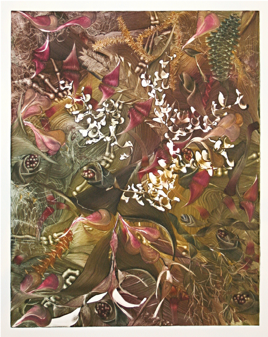
23. Untitled , 2009, oil monotype, 11 x 8 1/2 in.