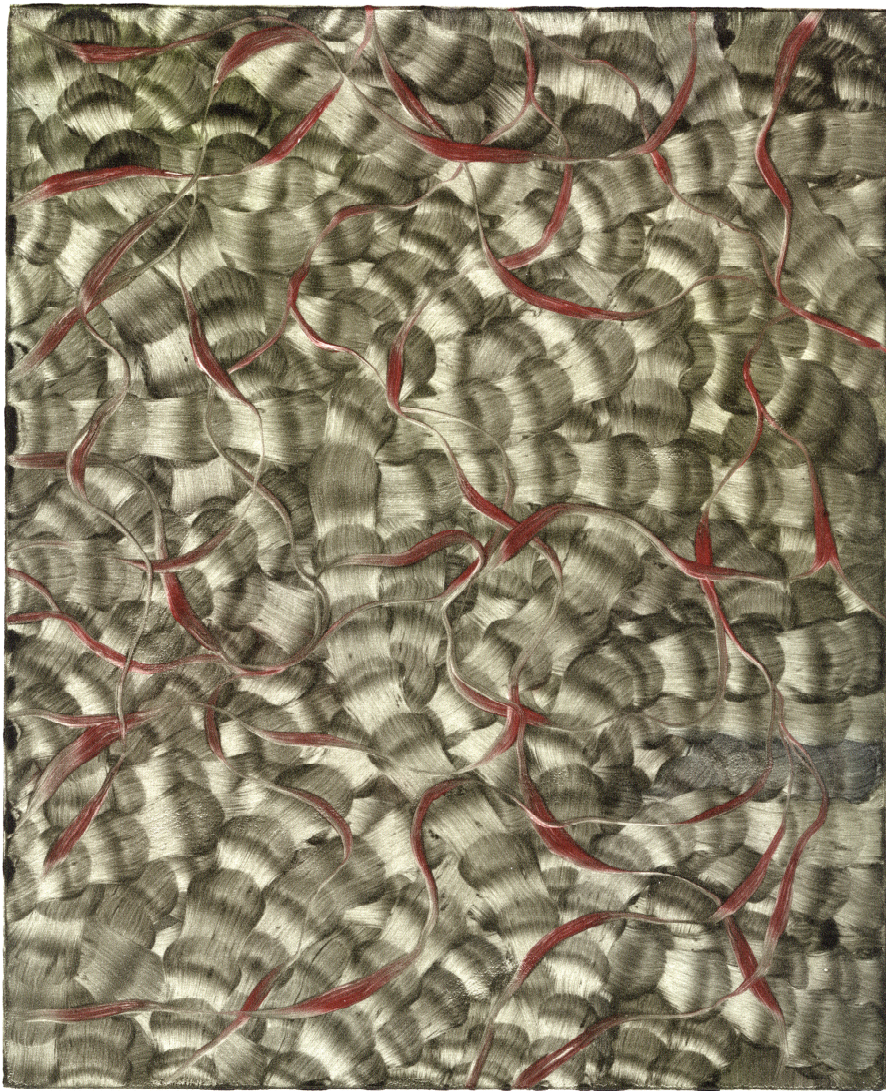
19. Untitled , 2009, oil monotype, 8 1 / 4 x 6 3 / 4 in.