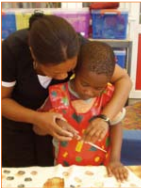
Carnival arts motivates children