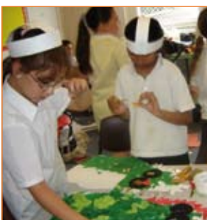
Developing skills in D and T

in that it is recreative because the song already exists, but to write a song is to create it from nothing and the experience of creating from nothing except just an idea is very very enriching." (artist)