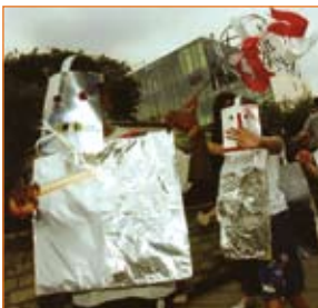
School carnival day 'The Iron Man'