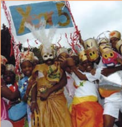
Carnival day at school

teachers and artists to show to children in schools and to teachers at staff meetings.