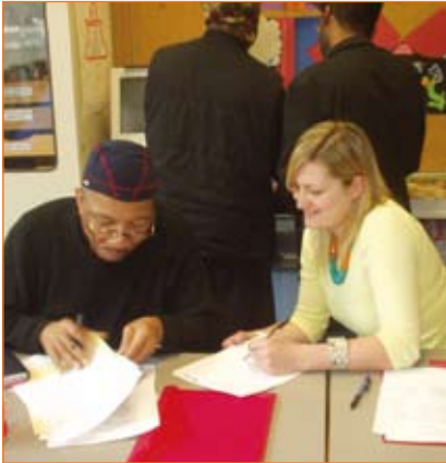
Collaboration with artists was the key

their work with children and record their work in schools. Some teachers contributed extensively to this process. Recording of artists workshops in college and in schools helped artists reflect back on their work and on student learning. The input from college staff, artists, students and teachers has meant that we have been able to produce resources using new media technologies. We have created an Intranet resource and also one accessible by schools.