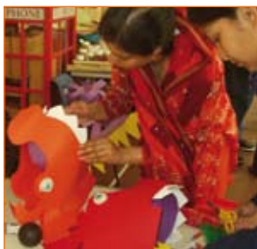
Parents in school making costumes

tracking, finding this allowed them creative release; others thought assessment would confer gravitas.