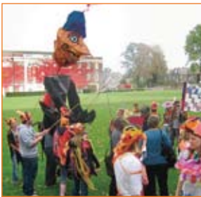
Students parade as Guy Fawkes at Goldsmiths