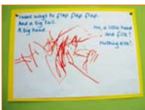
Costume design from a nursery school