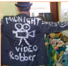
Midnight Video Robber

"Carnival provides opportunities for all pupils to achieve, including pupils with special educational needs. The excitement of carnival and all its art forms motivates the children, increases their confidence and encourages them to get involved. Carnival provides an opportunity to celebrate children's achievements. This was my experience working with the children on Carnival themes." (class teacher)