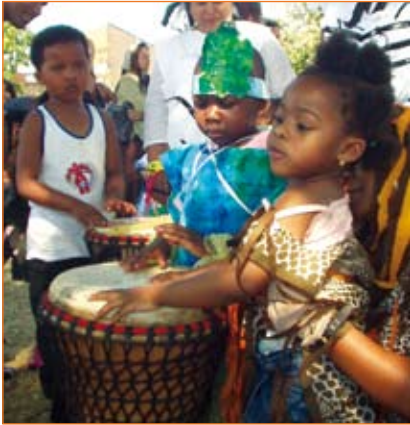
Inclusion: every child can be involved in carnival