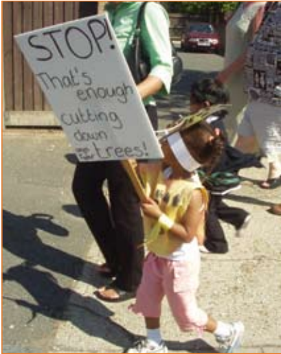
Parent and child make an environmental statement through carnival