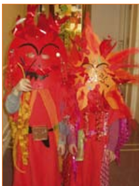
Students' children took part in the workshops

"Nowadays we need to be more aware in planning creative and performing arts that we can't just draw on English culture-in fact there is no such thing as 'English' culture now you have to draw on all the influences on all the things that are influencing children and making them who they are. I mean when I came out of school I had no knowledge of any other culture. It wasn't seen as important but it is. You need to be aware... and it makes things so much more interesting and it is a more exciting way to execute the curriculum." (student)