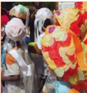
School carnival parade

sense of achievement when the performance took place.