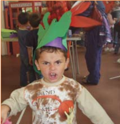
I'm a dragon!