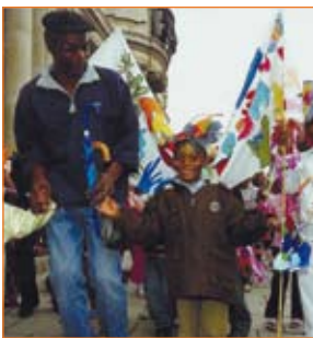
Parents and children in carnival on the streets