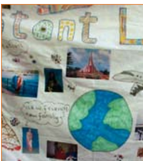
Banner made by parent group