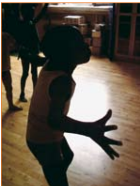
Boy expressing himself through dance