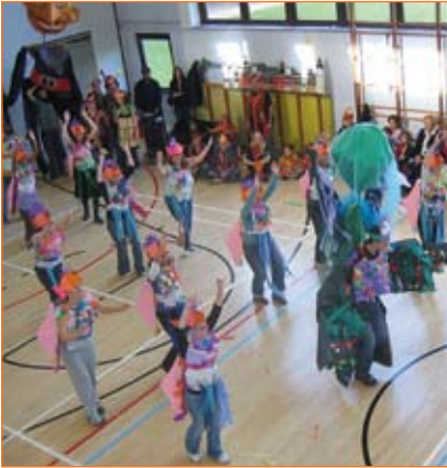
'Under Da Sea' from above - PGCE student carnival