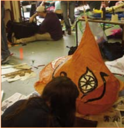
The challenge of scale