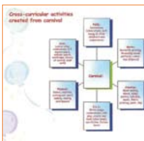
Early years curriculum map from students planning