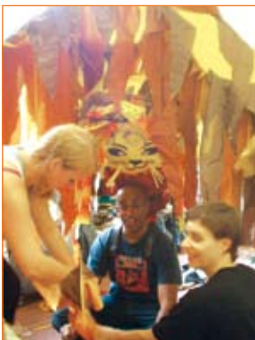
PGCE students putting on costume

“The project has enabled us to develop a more inclusive and creative curriculum which enthuses and engages all pupils. It is essential that teachers can see how Carnival can be incorporated into their planning for the national curriculum. It should not be an add on or marginalised. Carnival is cross curricular and therefore can be linked to planning in a variety of creative ways. We discussed how Carnival could be integral in the curriculum planning for two weeks. We decided the theme would be stories and took the theme of Annancy the Spiderman. The theme was discussed with the children and they were asked for their ideas to give them some ownership of the work and planning. We made links with geography, history, literacy, design and technology and all the arts.” (HEARTS teacher)