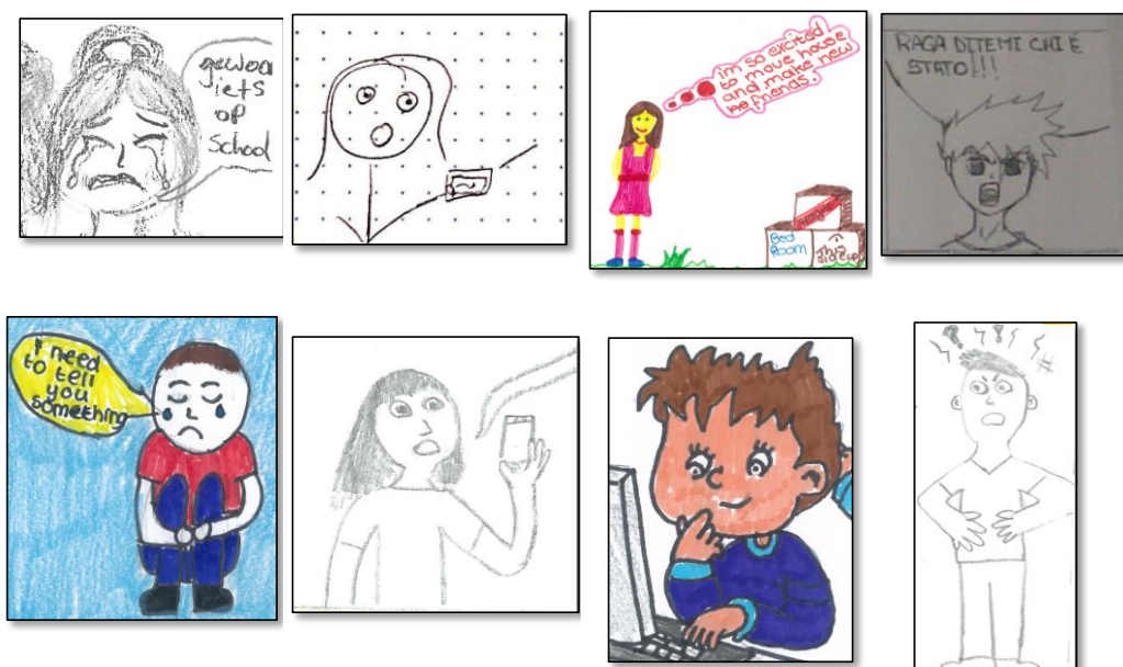
Figure 4. Examples of cybervictims’ emotions. From left to right in both rows, Sadness, Surprise, Joy, Anger. The phrase “Gewwon jets op school” means “Just something at school”; the sentence “Raga ditemi chi è stato!!!” means “Guys tell me who did it!!!”.