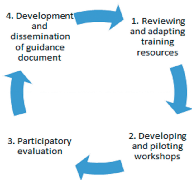
Figure 1. Representation of the project's action research cycle.

From July 2018 separate workshops for men and women were held at the NGO centre, facilitated by the external trainers and NGO staff. The workshops followed a similar structure to previous years, but with a curriculum and approach informed by the pre-workshop sessions and ongoing evaluation and learning events. An aim of this participatory evaluation process was to develop a critical lens on these workshops, based on insights from participant observation conducted by two university researchers. These researchers also facilitated focus group discussions and interviews with the workshop participants, facilitators and NGO staff, using participatory and visual methods to facilitate evaluation. Reflections on workshop content, facilitation and participant engagement did not come at the end of the action cycle, but were part of an iterative process, with learning emerging from earlier workshops informing later ones, and further informed by discussion during regular team meetings held at the university or in the city. Using participant observation as a tool within a wider PAR approach, we acknowledge that the meaning of 'participation' differs and blurs, with participant observation generally intended to observe change and participatory research to create change (Wright and Nelson, 1995).