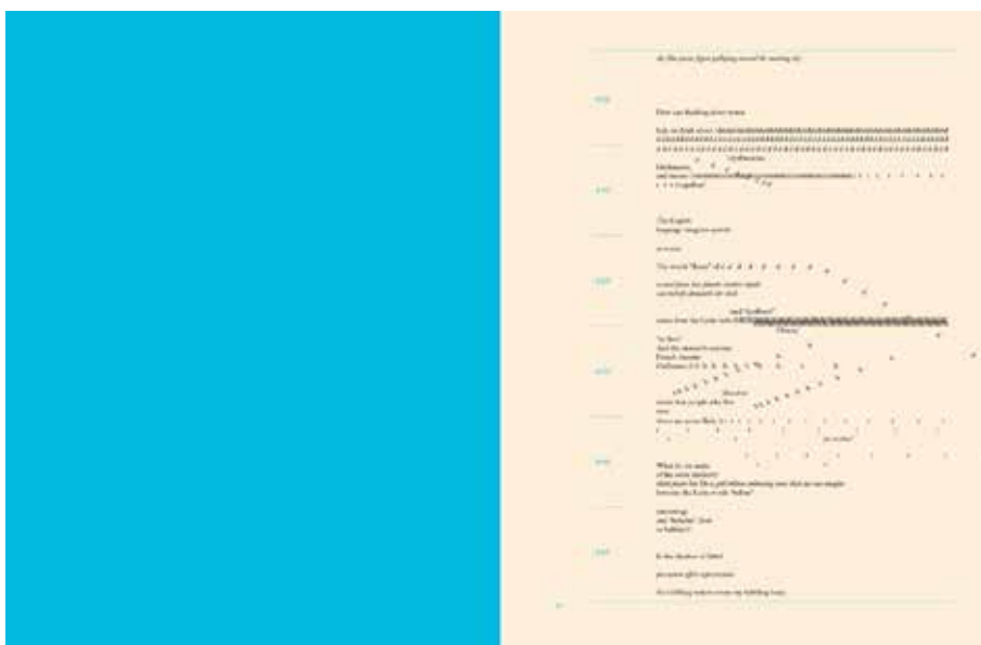
5 JJJJerome Ellis, from “Dysfluent Waters,” in The Clearing (Brooklyn, NY: Wendy’s Subway, 2021). Courtesy of the artist and Wendy’s Subway.

Why did slave owners often withhold clocks and watches from the enslaved, as well as knowledge of how to read these timepieces? [...] Can black song heal these traumas arising from time and sound? How can we create gentler, more humane clocks? How can we learn from the dandelion clock? How can we learn from the water clock? (p. iii)