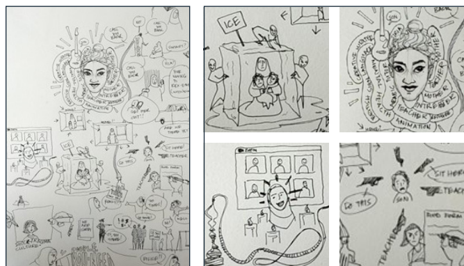
Draft sketch drawn as participant spoke about her experiences