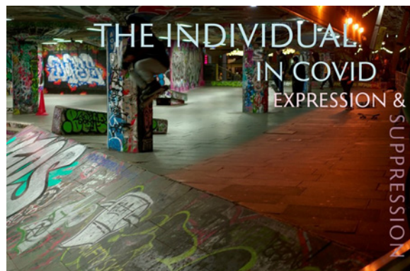
Figure 4 Example of how photos were grouped under thematic headings

peoples' assets, skills and abilities, through photographs, and use quotes (rather than images) to convey negative impacts on wellbeing. (See also photographer's reflections on working with researchers online - co-power.leeds.ac.uk/blog10_tp-ks/ ).