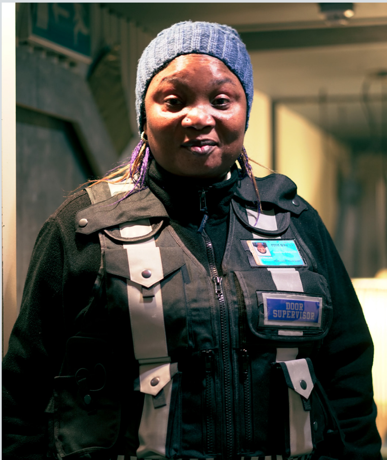
The Photobook and virtual exhibition can be accessed at: co-power.leeds.ac.uk/outputs