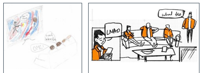
Participant's drawing at a focus group with young people at a youth group in London | Artist's sketch titled 'a day in March' based on focus group and participant's drawing

Working closely with the other four Work Packages in the CO-POWeR Consortium enabled us to identify synergy between the research teams. It was agreed that anonymised focus group and interview transcripts would be shared with artists, working in different mediums, to produce several outputs, including a 'graphic narrative' – similar to a graphic novel where pictures tell a story. Illustrators from WP5 were involved in focus group discussions in London, one with parents at a refugee network and one with young people at a youth centre. These focus group were co-facilitated with artists to help participants draw pictures while they talked about their experiences of the pandemic. Figure 2 shows how participant's drawings were re-worked by artists as part of developing a graphic narrative.