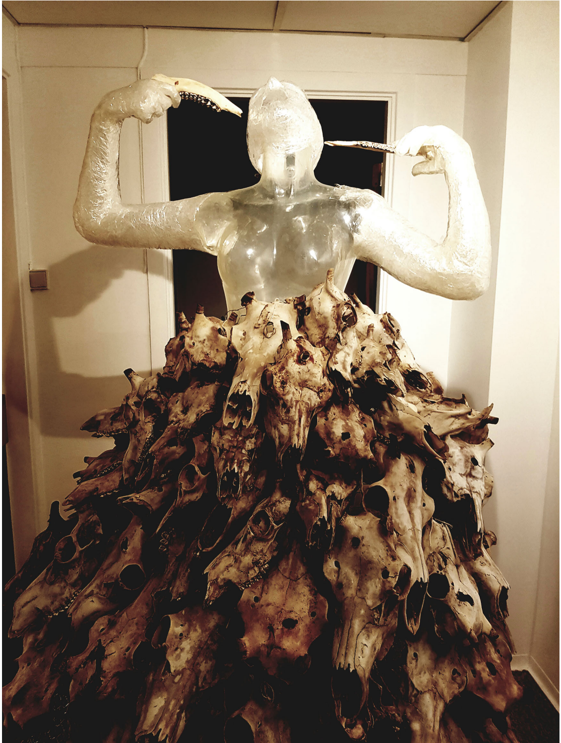
Máret Anne Sara, Shouts from the Shit Flood , 2016, mixed media