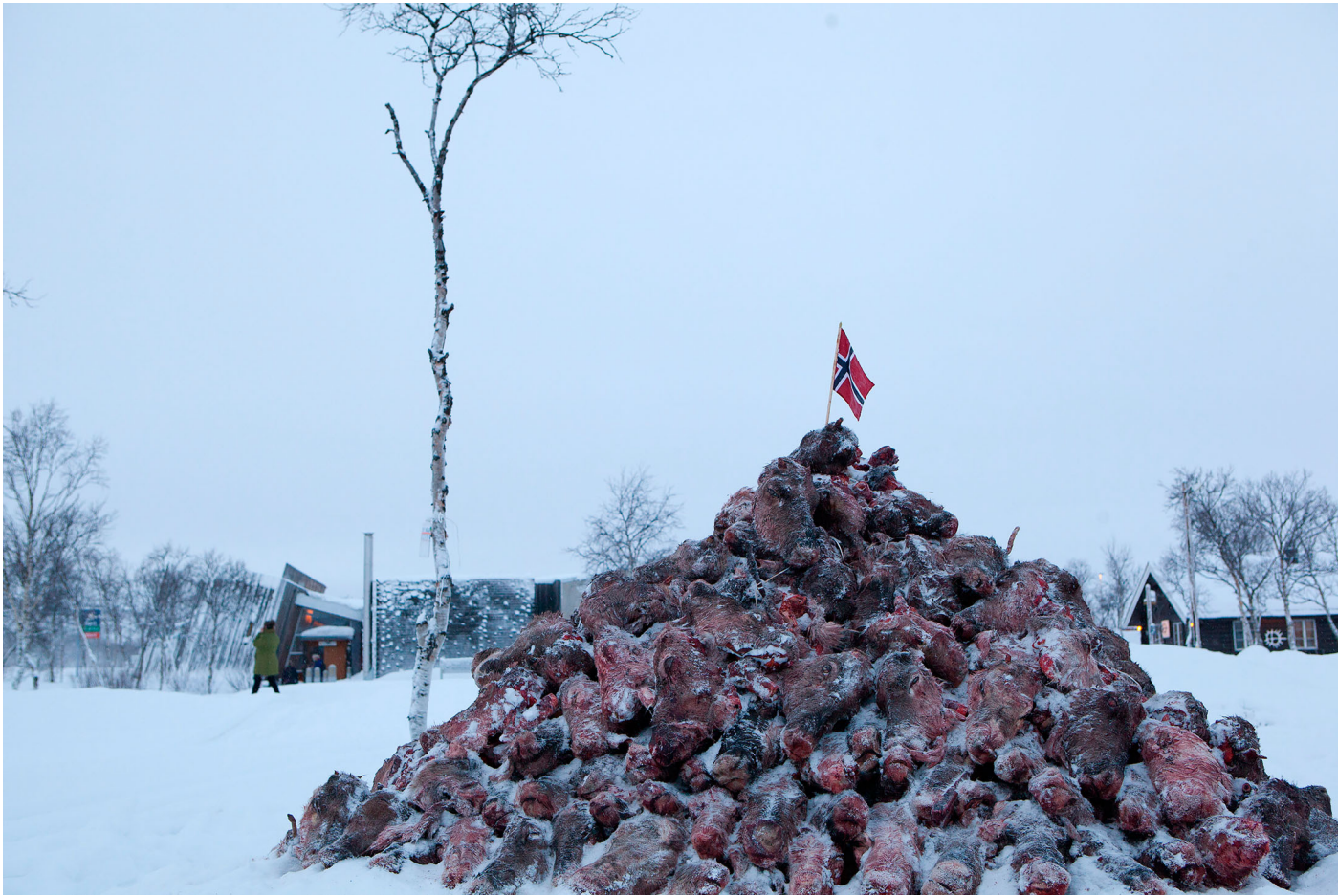
Máret Ánne Sara, Pile o' Sápmi , 2017, reindeer heads, Norwegian flag, Tana bru criminal court, Norway