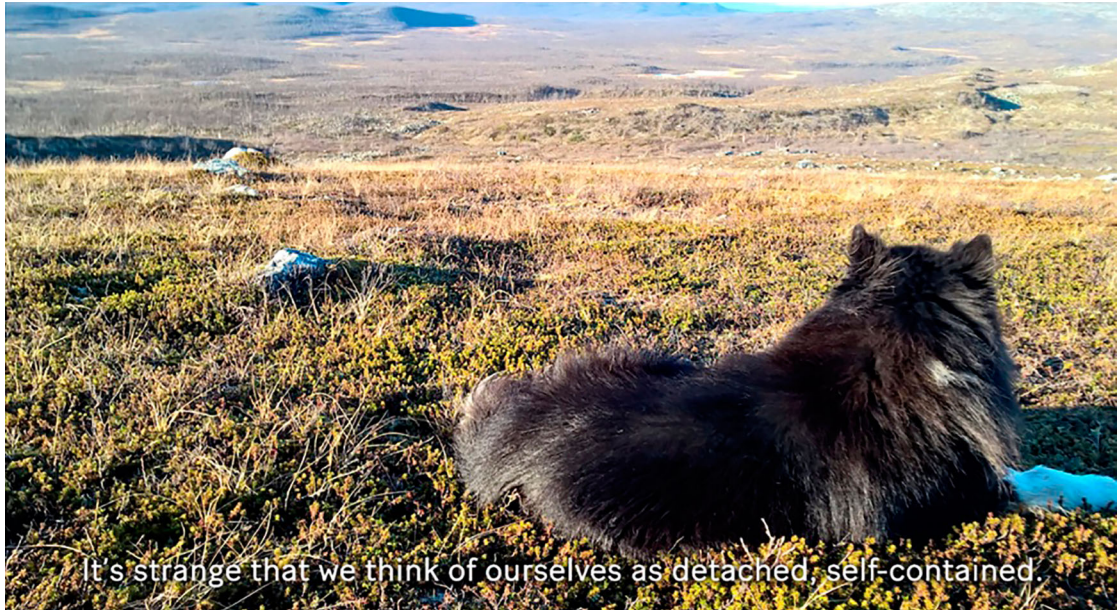
Leena and Oula Valkeapää, still from Manifestations , 2017, single HD video, 15 minutes, collection of the artist, photo: Oula Valkeapää