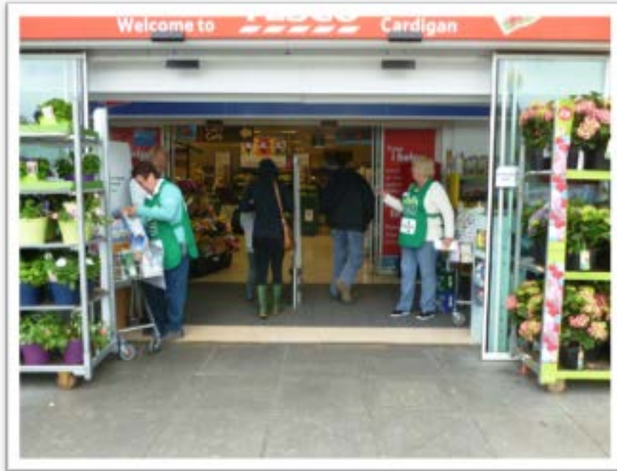
Figure 3: Volunteers collecting food outside supermarket

By 2016, demand had increased further: 'We had a big increase in the number of clients by 35%, mostly due to benefit changes and delays': Fortunately, the number of their donors had also increased: