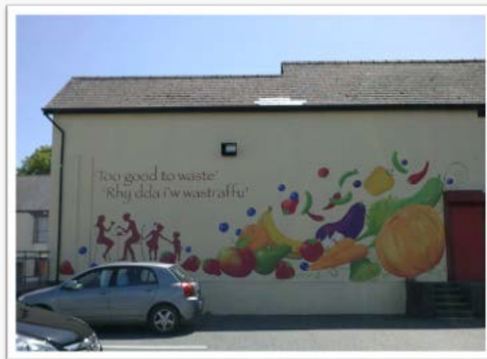
Figure 7: Too good to waste': Mural on wall of Transition Bro Gwaun cafe

Interestingly the community fridge which our wonderful team of ‘foodie’ volunteers are now running, gets a more positive response from the general public than the café used to - less stigma seems to be attached... However, I think it’s still seen primarily as a poverty resource, and only secondarily as a way of reducing waste.