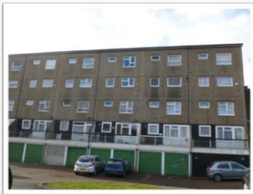
Figure 1: Flats on Northern Heights before demolition

In 2015 and 2016, I regularly spent time in a community centre which I have called The Hub located on a 'regenerating' council estate here termed Northern Heights. I interviewed both staff and users, some of whom were also food bank clients. The community centre ran a cafe and also a holiday lunch club for children. The Hub forms the first Case Study and it was here that I had my first lessons on living with poverty in 21 st century UK.