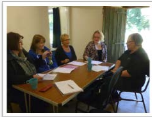
Figure 6: Patch branch committee meeting