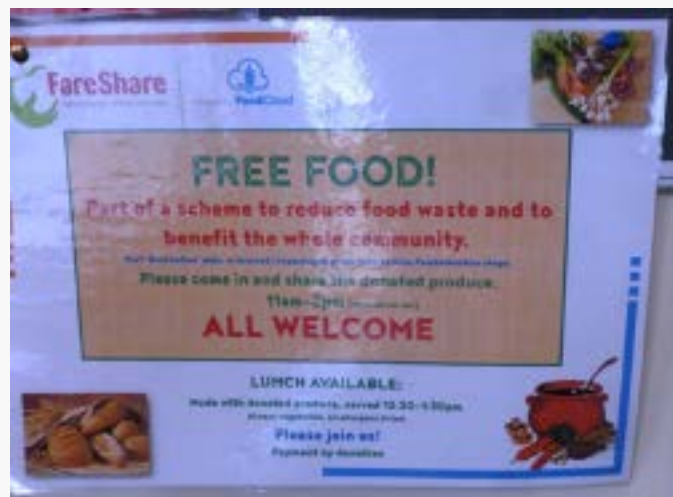
Figure 4: Poster for Fareshare Food Cloud produce

When Trussell asked her to set up another food bank branch in the area, she was happy to do so, making a total of four in the county. In effect, the headquarters became the main collecting point for food, which was then ferried out to the three other branches.