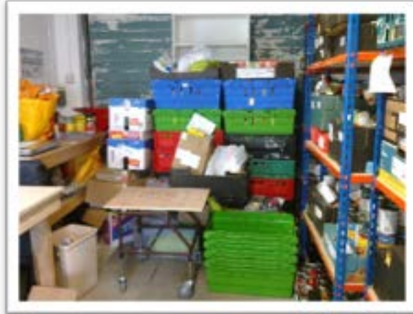
Figure 2: the store-room at St. Nicholas