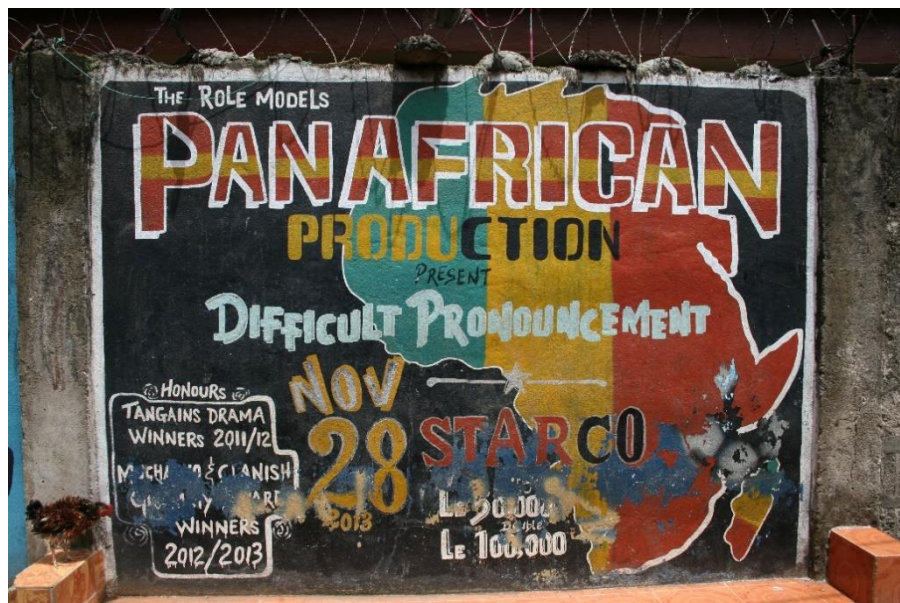
Figure 6: Advertisement for a Pan African Production in East Freetown

At the time of writing one of the more prolific groups in the East is Pan African Productions, who have around 30 part-time members and produce both live performances and videos, which are often not just advertised via banners and flyers, but also murals (as in Figure 6 below).