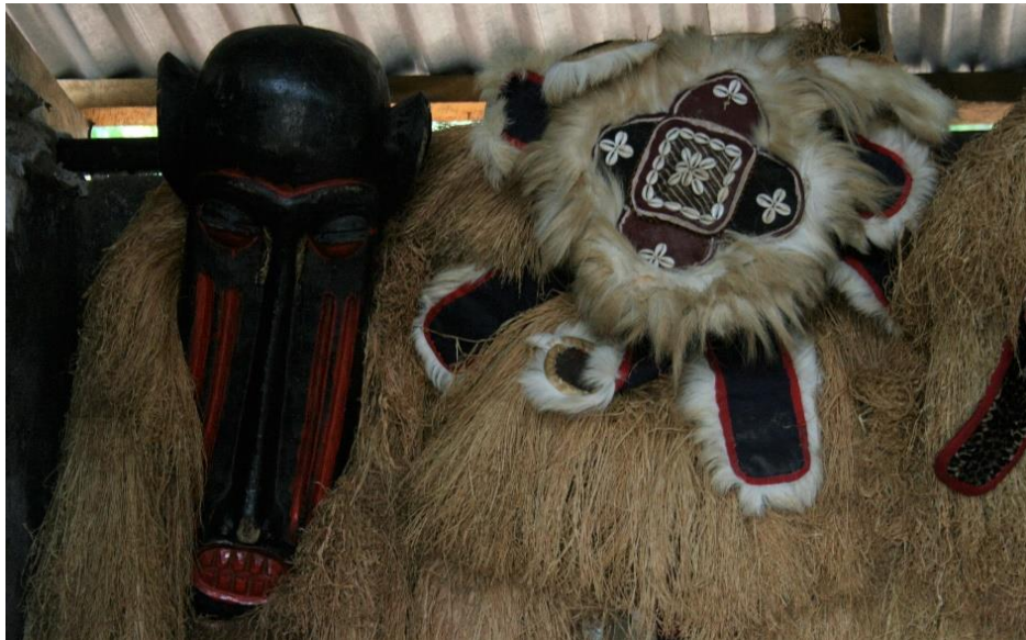
Figure 1: Mask in storage at the Cultural Village in Aberdeen, West Freetown in 2016

heritage, or even at political rallies. Masquerades in particular have become commodified and also serve as tourist attractions, and certain masks can be bought at local markets. Images of 'masked devils' (such as in Figure 1 below) also often appear in tourism brochures and murals (Basu and Zetterstrom-Sharp, 2015). These blurred lines between sacred and secular indigenous performances are another interesting illustration of the hybridisation of the two publics and its implications for cultural life in Sierra Leone.