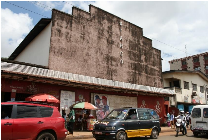
Figure 3: Starco Hall, East Freetown, outside in 2016