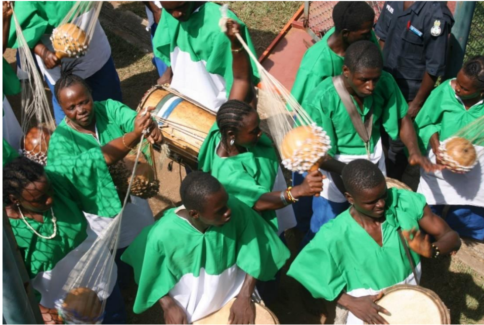
Figure 11: Performers in the colours of the Sierra Leonean flag at the National Stadium in Freetown in 2011 on the occasion of the 50th anniversary of Sierra Leone's Independence Day in 2011

Financial and structural support by public institutions for theatre and the CCIs more broadly is thus almost non-existent and only a small range of cultural and creative activities are currently supported by NGOs and development agencies (mainly funding theatre for educational and developmental purposes, as analysed in Chapter 4) or by private and business sponsors (such as mobile phone companies or breweries) – as the quote below emphasises.