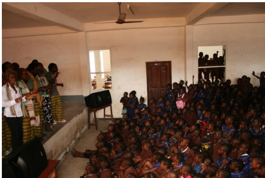
Figure 7: The Freetong Players International performing in a school in 2011

As mentioned above, the Freetong Players International are currently the only full-time professional theatre group in Sierra Leone and beside their more recent community and developmental theatre work for NGOs and development agencies (which mainly allows them to survive), they frequently also perform in schools, both to entertain and educate. Figure 7 below shows one of their school performances in 2011.