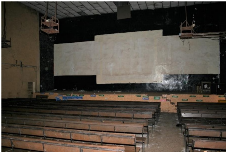
Figure 4: Starco Hall, East Freetown, inside in 2016