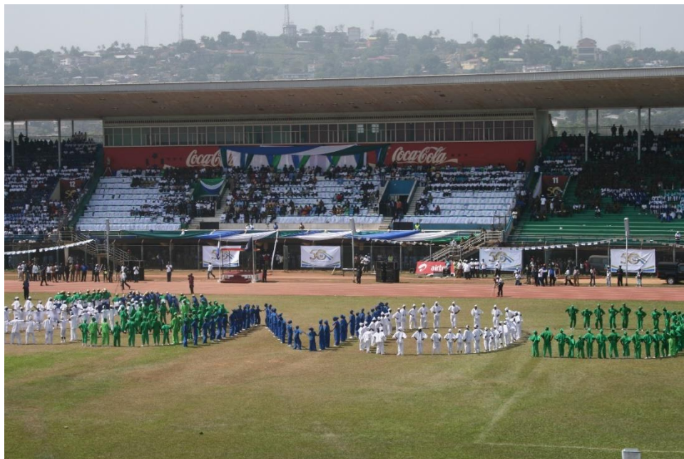
Figure 10: Performance at the National Stadium in Freetown in 2011 (funded by the government) on the occasion of the 50th anniversary of Sierra Leone's Independence Day

The patronage of the arts for branding purposes by political parties has a long history in Sierra Leone. According to Nunley (1985), party symbols, such as those of the APC and the SLPP, were already used in the 1960s for the decoration of lanterns during the popular Lantern Festival described in Chapter 3. Nunley also suggests that both the rise of the APC itself and the subsequent introduction of the one-party state in 1978 were supported by the APC's patronage of lantern-building groups and masquerade societies and their ability to mobilise followers (Nunley, 1985). Today, political parties still offer occasional ad-hoc support for certain cultural representations and events, mainly for displays of 'national culture' and folklore; for example, at festivals, on occasions of nation-wide celebrations (such as the country's Independence Day, as in the Figures 10 and 11 below) or for 'political cheerleading' as part of their political campaigns before elections. In this context culture is thus mainly instrumentalised to further a political agenda, in the sense of promoting institutional legitimacy or a certain type of propaganda. This kind of support, however, does not feed into the sustainable growth of artistic and creative practices, cultural organisations, or the ecology of culture more broadly.