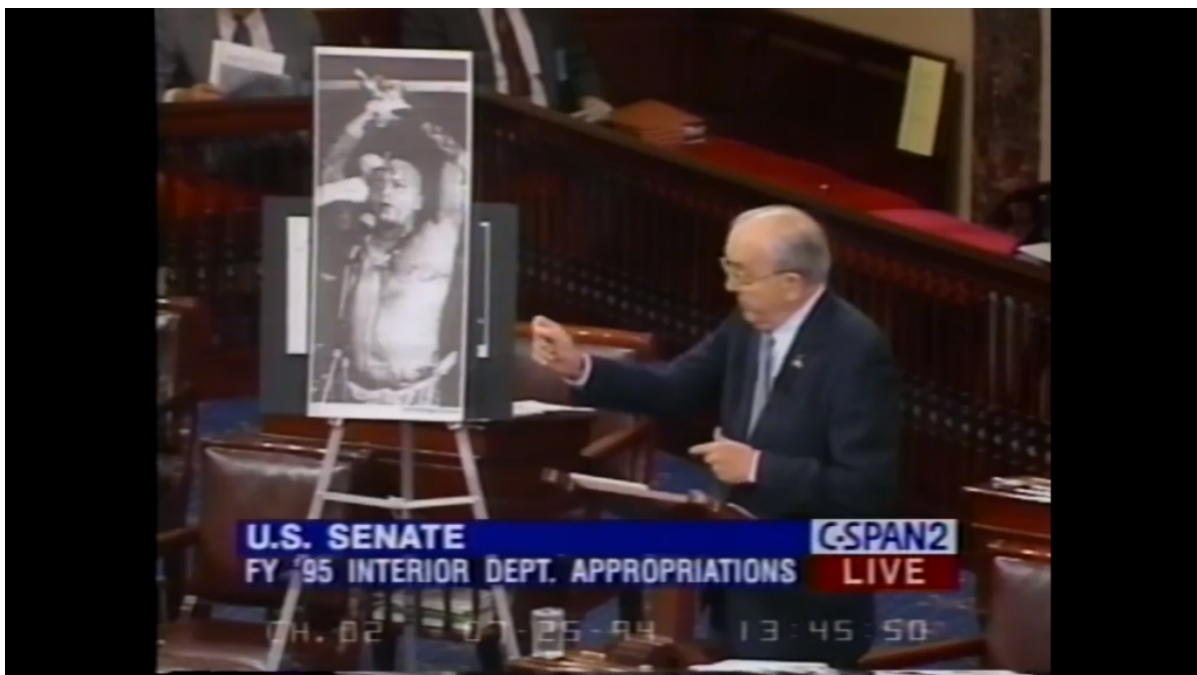
Fig. 1: Video still featuring Jesse Helms on the floor of the US Senate on 25 July 1994. Next to him is an image of Ron Athey as St. Sebastian in Martyrs & Saints (1992). Public domain. Available at: https://www.c-span.org/video/?c4520996/user-clip-jesse-helms-ron-athey .