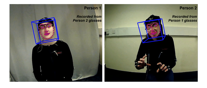
Figure 1: Dyad recording setup. Person 1 and 2 are seated in front of each other. The footage is recording from a camera on each person's PupilLab Glasses. The blue box and the facial landmarks are exported from OpenFace software and added to the original video.

In this work, we look at the gaze and speech of participants during unstructured conversational tasks. We aim to validate some of the previously reported gaze behaviours, but also to look at how people's gaze changes when they are looked at or not by the other person. This initial work aims to strengthen our understating