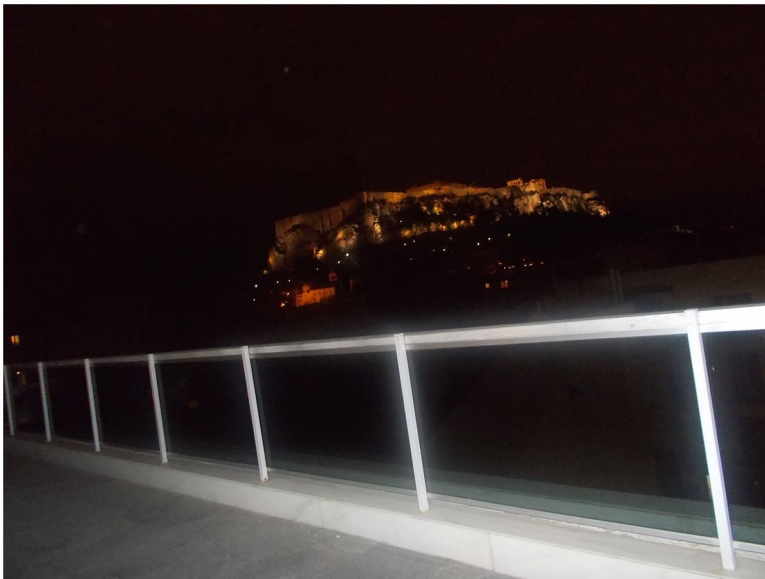
Figure 5. The Acropolis from Lina's balcony in the night.

too. By including her balcony in the frame, she brings the monument closer to the house thus blurring the boundaries between the public and the private spheres. The combination of the two elements (balcony and monument), result in an undisputed proximity.