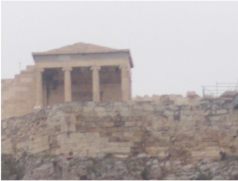
Figure 6. Georgina's picture of the Acropolis.