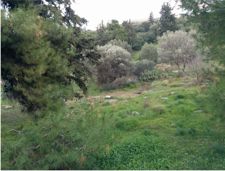
Figure 1. Michalis's picture of the Acropolis.

distance to the Acropolis differently and develop (or fail to develop) strategies for dealing with the gap between themselves and the monument. We analyse each ethnographic biography – child, photograph, context – in turn before turning our attention to the four children's encounters with each other at the workshop, and their discussions on the photographs taken with other children in the study. All ages (in parentheses) of the children are correct for the times we were working with them.