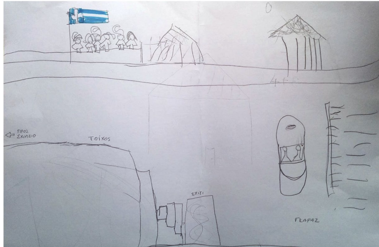
Figure 3. Lina's map of her neighbourhood, and of things that matter to her there.

When Christos asked Lina to draw her map of places that mattered to her (see contextualization section), she sat quietly and thoughtfully, contemplating what should be included. After lengthy consideration, she yelled 'I know! The obvious one of course, Acropolis!' She made several attempts at drawing the monument, and when she finished with the Acropolis she drew the Greek flag next to it, which was the only bit of colour in her drawing, as well as a staircase to indicate her home (see Figure 3). She drew some people on the Acropolis too (she said 'the people'). When she was done with the map, Lina asked Christos if he could write down the names of the places for her. He agreed and asked her what he should write? House, garage, a sign reading 'to the school'. Christos asked her 'what about the Acropolis, should I write something there?' 'No,' she responds, 'everybody knows it's the Acropolis.'