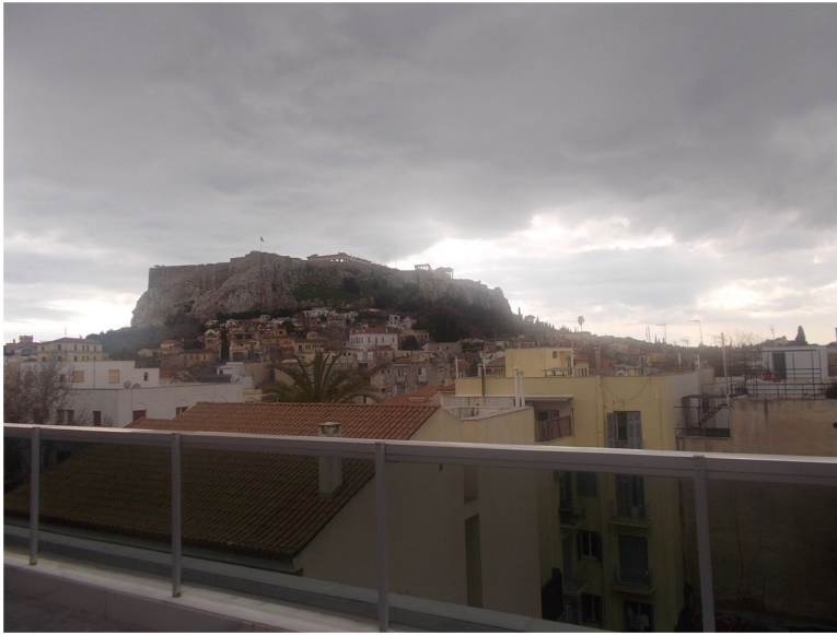
Figure 4. The Acropolis, as seen from Lina's balcony during daytime.