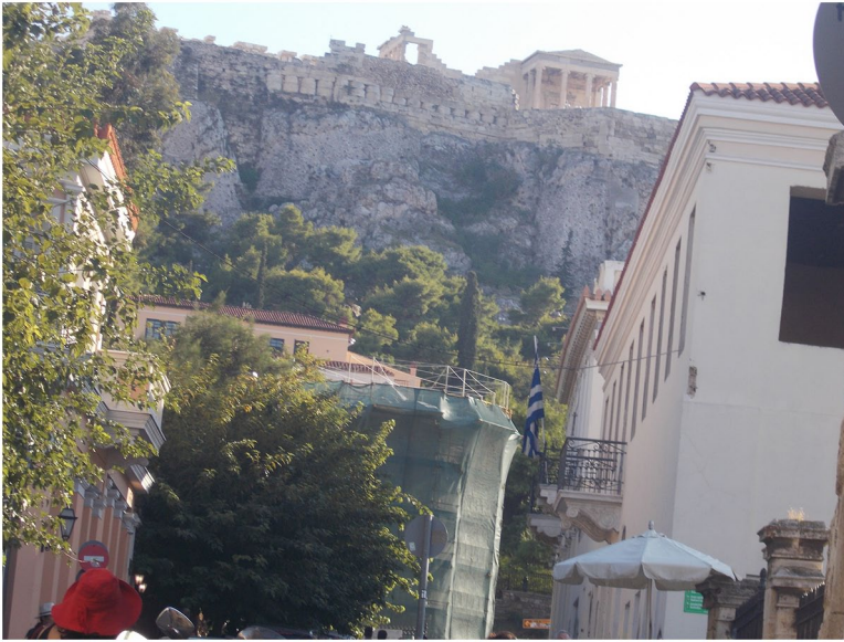
Figure 2. Ardian's picture of the Acropolis.

taken from below – indeed, this became one of the 10 pictures he chose to later bring with him to the workshop.