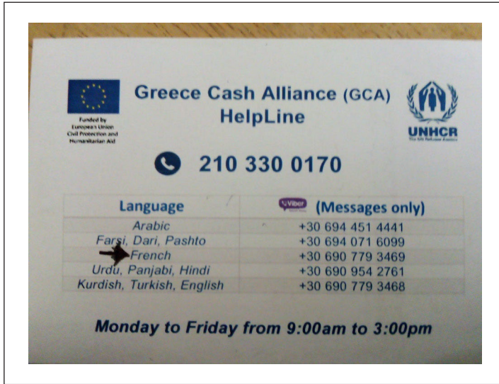
Figure 1. Viber numbers that asylum seekers have to text to in order to solve technical problems with their cards

analysed in relation to the other technologies that asylum seekers need to navigate on a daily basis. In Greece, the technological obstacles for migrants start when they decide to claim asylum. Indeed, since 2016 migrants who want to book an appointment with the Asylum Office to lodge their asylum application need to do this through a mandatory Skype system, which can be difficult for many to manage. Indeed, for some migrants, owning a smartphone and getting access to the internet is not so straightforward, and Skype calls can be made only during specific time slots – usually one or two hours per week, depending on migrants’ nationalities. 15 As a result, ‘the line is always busy, it took me three weeks before reaching the Asylum Office’ (Interview 2). Since the onset of Covid-19, the asylum procedure has almost entirely been done online: after pre-booking an appointment via Skype, migrants need to lodge their asylum application online on the Hellenic Ministry of Migration and Asylum website. 16