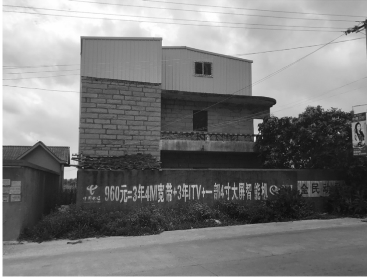
Figure 8. Telecommunication adverts on a wall in rural China.

Some of these arguments remain true, particularly the rural-to-urban division. According to the CNNIC's 37 th report in 2015, when this study started, estimates of rural Internet users reached 195 million, accounting for 28.4% of the total Internet users in China. However, the annual expansion rate (16.94 million, 9.5%) of the Internet in rural areas is twice that of urban areas (22.57 million, 4.8%). The disparities of communication technology access among other social categories has decreased as well. Although the young generation (20-39) are still the main users of the Internet, representing 53.7% of all users, middle-aged and elderly users (50+) have gradually grown from 5.8% in 2010 to 9.2% in 2015. The male-to-female ratio is also becoming moderate from 55.8:44.2 in 2010 to 53.6:46.4 in 2015. In addition, the divides between the high-educated (college and masters degrees) and the middle or low-educated (junior and senior high school degrees), as well as between different income groups are also narrowing (see details in the CNNIC's annual report).