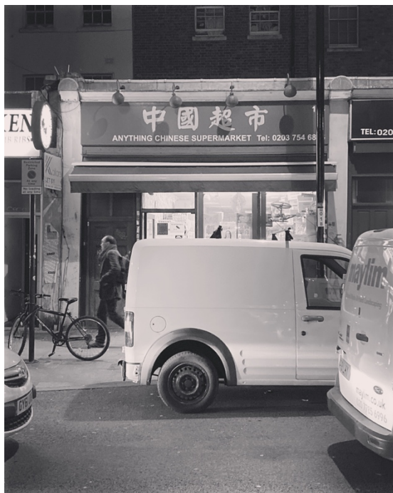
Figure 18. A London-based Chinese grocery store.

2001a, 2005a). According to my long-term observations, incentives to migrate for female migrants not only include structural factors such as unemployment, domestic violence, and relationship breakdown, which have previously been recognized (Parreñas, 2001a; Madianou, 2012), but also vary depending on their residential status in Britain. The story of Xiu Mei, a 46-year-old female migrant, presents a typical example to illustrate the argument. When she first came to Britain in 2000, she never considered that she would settle down here (she and her husband travelled together, but he was deported). Her initial dream was to earn sufficient money and return home to retire. She started from scratch, but her life ambitions kept her on track. In her seventh year of working hard in her cousin's restaurant, Xiu Mei was informed that her application for citizenship had been approved; this became a turning point in her life as a migrant. With legal status, she was entitled to borrow money from banks. A loan and her hard-earned savings afforded her an opportunity to quit the hard labour in the restaurant and run a small Chinese grocery store in London.