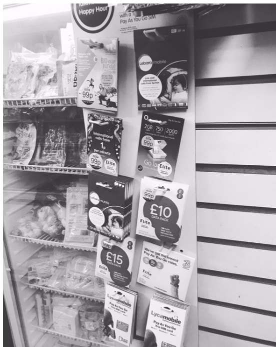
Figure 10. Prepaid phone cards in a Chinese grocery store in London.

renewed former communication methods. Some still adhere to prepaid phone cards because they have to communicate with elderly proxy guardians back home who have limited digital literacy. Migrants of the earlier generation also use phone cards due to their own lack of digital literacy. Even though they access new media, they frequently use certain functions that require relatively less digital knowledge (visual- or voice-based communication), such as webcam calls and VOIP (voice over Internet phone).