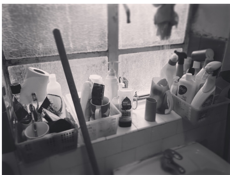
Figure 1. A shared bathroom with many shampoo bottles around the washbasin.