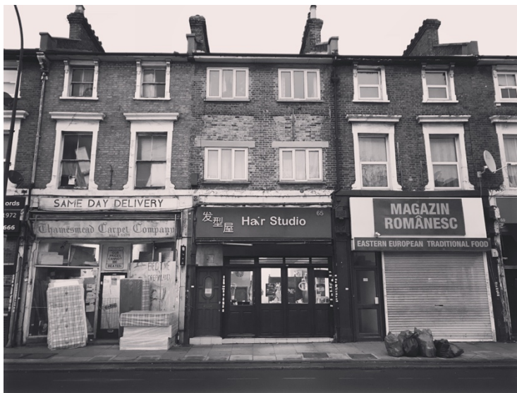
Figure 2. A Chinese barber shop located in southeast London.