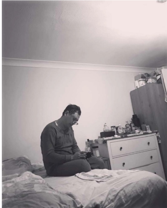
Figure 17. A migrant father browsing his son’s WeChat Moments updates via smartphone after work.

In their study of refugee transnational families, Robertson et al. (2016) suggest that the use of digital photography among refugees has created ‘imaginary co-presence’, where they can share a sense of ‘being with’ their absent family members when direct interaction becomes impossible. Though grounded in a different context, struggling fathers who have gradually lost contact with their families have also benefited from such ‘imaginary’ intimacy and togetherness – while the searchability affordance of social media allows for tracking children’s updates without direct interruption and emotional voice messages serve as triggers recalling the past (LeFebvre & Haggadone, 2018). The combination of various media affordances therefore allows for some kind of simulation of a warm ‘virtual family’ for these struggling fathers.