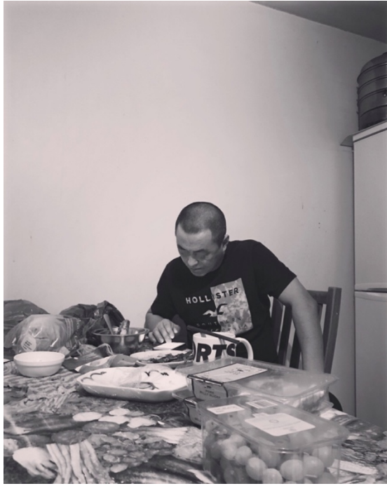
Figure 20. A migrant up-fitter worker from Heilongjiang Province who is listening to WeChat voice messages from his left-behind daughter.

communication between father and child does not last quite as long, usually less than five minutes, after the mother has finished talking and passed the phone to them. What most fathers say to their children through regular phone calls can be summed up as exhorting them to listen to their guardians.