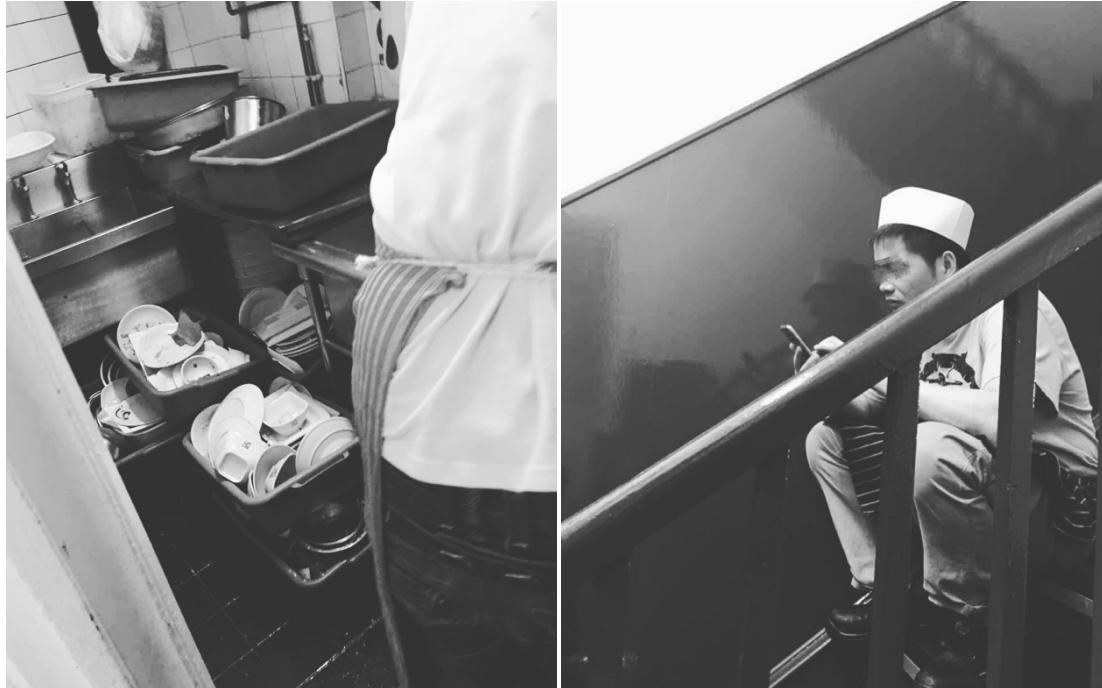
Figure 14 (left). Back kitchen filled with stacks of dishes to be washed.

likely to struggle with their parenting duties because of the lack of mutual support available in both-parent-away families.