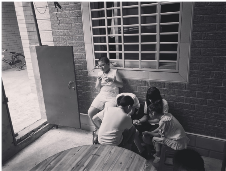
Figure 24. Left-behind children in Fuqing playing with a smartphone together.

The challenge in this chapter, therefore, is to rethink the influence of migration on left-behind children by taking into account the role of media. In so doing my aim is not only to discuss how these children enact agency given their positions in the ‘care chain’, but also to investigate whether their media practices lead to further transformation of distant intergenerational relationships. My argument is that a socio-technical approach, as aforementioned, serves as a helpful starting point to delve into the dynamics of mediated family life in a transnational context, as transnational family is not a given, but a dynamic that is articulated through media use in an ongoing process. This leads to questions concerning how left-behind children perceive mediated parenting and reconstitute their own role as children, as well as the ways in which they respond to it and the subsequent consequences.