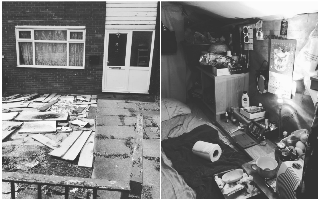
Figure 12 (left). The pathway to a house with over 15 Chinese migrants living inside.