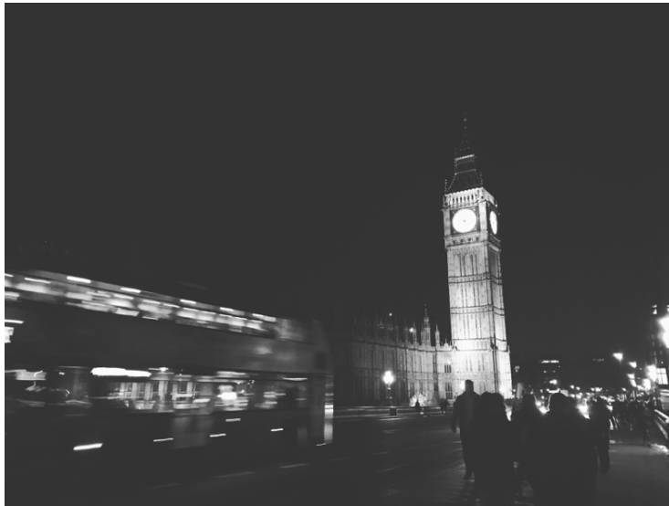
Figure 7. A group of Chinese migrant workers strolling around the streets of London after work.

Given the long-term labour shortage in Britain, for the majority of the participants who work in low-skilled service industries, the income earned for doing the same jobs in Britain was much higher than it would be in China. As noted by Xiao Ou, the migrant worker at the beginning of this chapter, wages for positions in China's catering businesses reach up to RMB 3,000-4,000 (£345-460) per month, which amounts to a week's salary in Britain. In Xiao Ou's words, "returning to home was nothing other than returning to poverty". Thus, for these Chinese labour migrants, remaining in the UK serves as a simple economic prospect, which echoes Parreñas's (2001a) finding in her study of Filipino female migrant workers who opted to not return because of their long-term pessimism about the economic prospects in the Philippines.