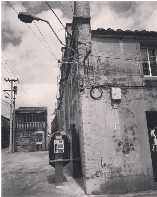
Figure 9. An abandoned payphone and a broadband box newly set on the wall.

presumed non-elite groups, such as those who are comparatively less-educated, relatively low-paid and work in agriculture, forestry, and fishery, or are rural-to-urban migrants. 35 Given the context, the following part of this section aims to describe the contours of the media landscape in China. I then discuss media access among transnational families – transnational migrants and non-migrants – who primarily lie within the aforementioned non-elite group in China.