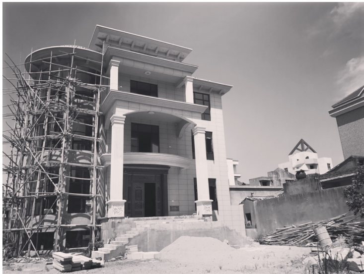
Figure 23. A house under construction in Fuqing.