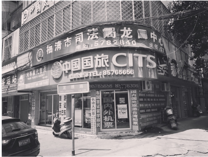
Figure 5. A travel agency in rural Fuqing, a major clandestine migration area in China.