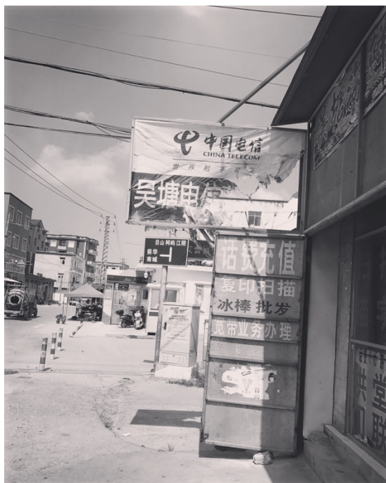
Figure 11. Internet service commercials in Fuqing.

visited, the penetration rates of household broadband have undergone a drastic boost from 13% in 2007 to almost 70% (646/925) in 2017.