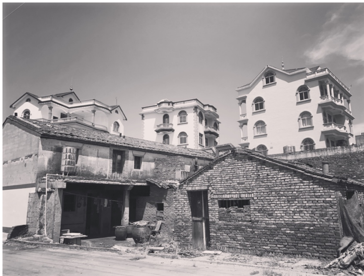
Figure 22. It is not difficult to distinguish the migrant families and non-migrant families.

family members or children left behind, which could be termed “rural hollowing” (Liu et al., 2008); on the other hand, the back flow of remittance has resulted in “rural flourishing” in terms of infrastructure. Chao Hong told me that the most exaggerated example in her village was an eighteen-floor-building with only three people living inside.