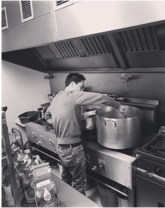
Figure 6. A chef stirring curry in a Chinese takeaway restaurant.

While it is often assumed that Chinese migrants are predominantly male, Chinese women are as willing as their male counterparts to search for better earnings and a more promising future (Lam et al., 2009; Song, 2004). For those women who come to Britain for economic gain, the pressure to support their family is intense. In her study of Chinese takeaway businesses in Britain, Song (1995) discovered the phenomenon of ‘kitchen hierarchy’ whereby women were always allocated the low-intensity jobs such as serving at the counter or waitresses compared to the role of their male counterpart who were employed as chefs. Yet, the increasing labour intensity in UK-based low-skilled businesses had blurred the gender boundary to some degree. It is now not uncommon for migrant women to compete with men for the same labour-intensive jobs (Song, 2004). The high labour intensity could be exemplified by a problematic quote circulating among Chinese migration communities: while women are often considered as men, men are generally treated as animals. In general, the occupation of the participants mainly lies in the catering business, while some work in construction or other service sectors like hotels and nail salons. Roles include: ya-ba-lou-mian (dumb