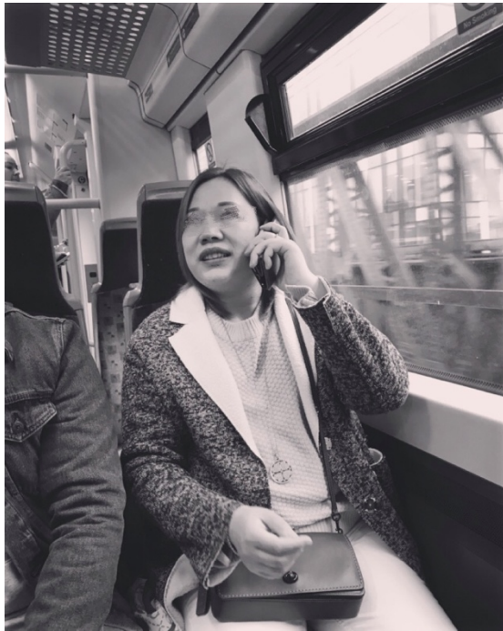
Figure 16. A migrant mother making a phone call with her left-behind son in Fuqing.

year-old migrant mother whose daughter is in a private primary school, told me that it was impossible to contact teachers instantaneously in the past. However, with the advent of digital platforms, parents working abroad are able to gauge children's emotional and social progress through constant interaction with their school. Interestingly, most of the parents involved in the co-tutorial group were not left-behind fathers, but rather female migrants. The tasks that teachers assigned, such as reviewing and checking children's homework, were often performed by these migrant mothers, while husbands at home, on the whole, were not called upon for this responsibility.