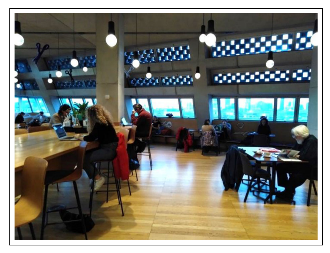
Figure 3. Evidence of hominess threshold in a productive third place (fieldwork).

mindset. He argues that traditional customers need "attention and dedication," while customer-workers require "more of a subtle approach to create a seamless experience for them where you are invisible." The experience of customerworkers is understood as requiring specific adjustments. Adopting such an approach simplifies the norms and behavioral expectations within the place and thus reduces the conflicts highlighted in the compromise third place. For instance, thanks to daily offers, staff do not need to micromanage customer-workers nor to incentivize them to consume regularly. It allows PTPs to maximize customer-workers' financial value. Reversely, customer-workers do not have to worry over how much they should consume if they want to spend the day.