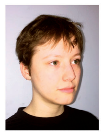
Figure 1. Stimuli of Representational Drawing Task Trials Produced by the Researcher. (Top left: still life photograph of everyday objects ( 752 \times 564 \,\mathrm{mm} ), top bottom: photograph of a hand ( 752 \times 564 \,\mathrm{mm} ), right: portrait ( 556 \times 742 \,\mathrm{mm} )).