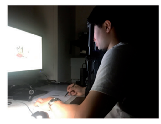
Figure 2. Experimental Flowchart of the Representational Drawing Task Trial I (Top) and the Experimental Set-Up (Bottom).