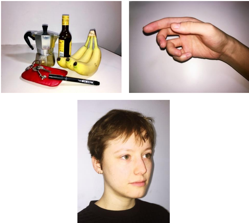
Figure 1. Stimuli of representational drawing task trials produced by the researcher. (Top left: still life photograph of everyday objects (752x564mm), top bottom: photograph of a hand (752x564mm), right: portrait (556x742mm)).

Materials. Participants were tested individually in an eye-tracking lab at Goldsmiths, University of London, within a 1-hr testing session. Stimuli were presented on a colour desktop PC (1920 x 1080) which was 60cm apart from the position of each participant. Eye movements of the right eye were recorded using an EyeLink 1000 eye tracking system with a sampling rate of 1000Hz and a centroid model to fit the pupil image and set the pupil position. Participants were asked to place their heads on a chinrest in a set position and stay still as possible throughout the study. A 9-point calibration was performed at the beginning of the experiment and was maintained for each trial using a drift correct procedure between each trial that corrected fixation errors due to small movements in camera alignment (e.g. caused by head band slippage). The experiment was written and ran on Experiment Builder of SR Research Ltd.