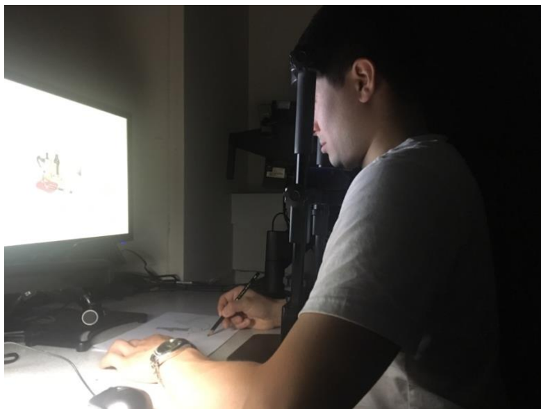
Figure 2. Experimental flowchart of the representational drawing task trial 1 (top) and the experimental set-up (bottom).