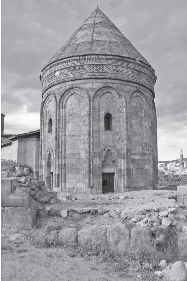
FIGURE 14.2. The dome of the mausoleum at the “Çifte Minaret” madrasa, Erzurum, Turkey, the building of which was paid for by Pādshāh Khatun.

“gave many pensions and allowances to scholars and she ordered [the construction] of extraordinary madrasas and mosques.” 45