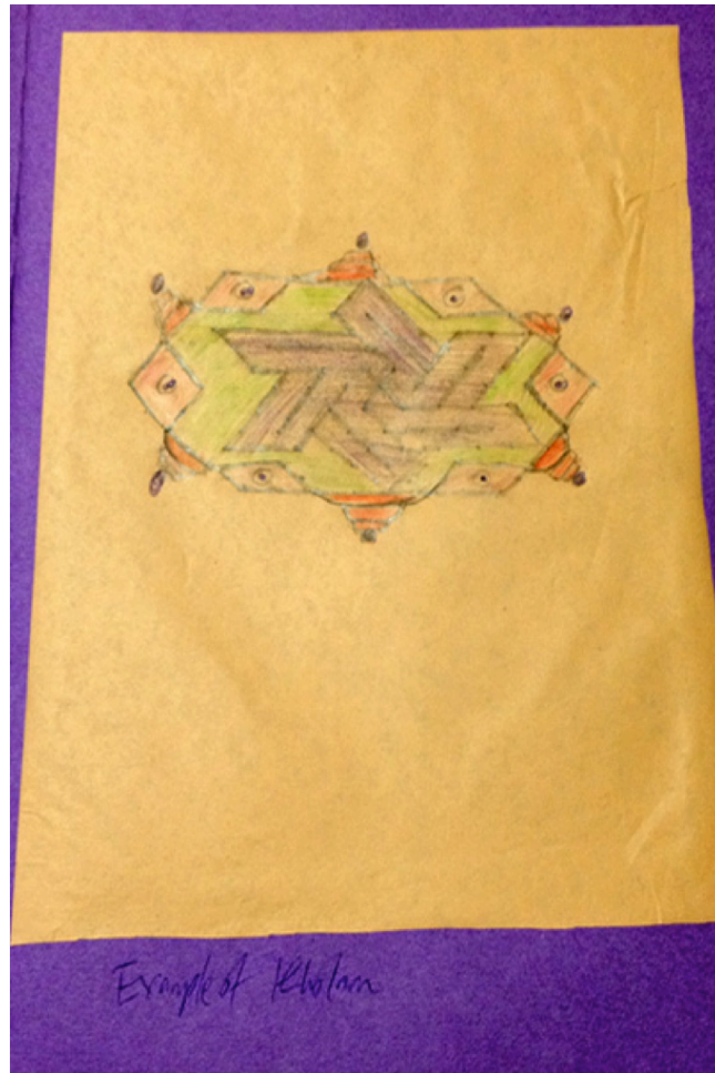
Image 1: "Example of Kholam" (the original spelling of kholam in Sunthiru's scrapbook has been retained)

Drawing on the rich visual imagery of Hinduism mediated via new technologies, Sunthiru's representation of the kolam combines geometric shapes with different colours to create a symmetrical drawing. The drawing is characterised by precision and complexity and it is accompanied by an explanatory text in English. Sunthiru and his sister, Chantia, crafted similar texts reminiscent of the school genre of explanatory texts to accompany many of their drawings of religious rituals, ceremonies and objects they created for their scrapbook. When asked about the source of these texts Sunthiru mentioned using a reference book on Hinduism in English the family had at