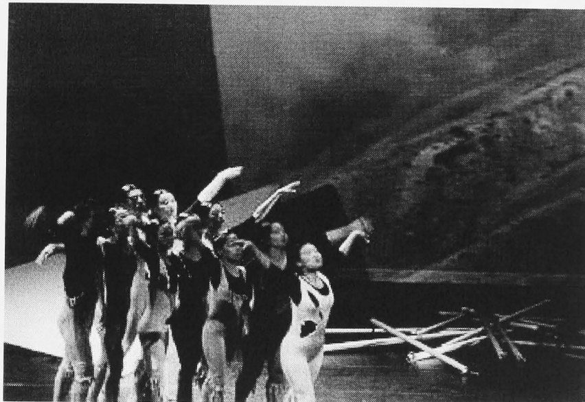
Figure 4. Tainan Jen's Journey of the Wind Birds

In addition, over the last ten years, Tainan Jen Theatre Troupe has held many workshops and festivals to bring about the stable growth of drama and theatre in Tainan. On account of its credibility, the troupe was assigned by the Council for Cultural Affairs to carry out a special project, 'The Guidelines for the Education of Local Drama Talents and the Development of Theatre', in 1997, and has been approved by the Council to be one of Taiwan's 'subsidised performance groups of great excellence' since 1998. However, the most important task for the troupe to accomplish in the foreseeable future is, if the finances are in good shape, to hire