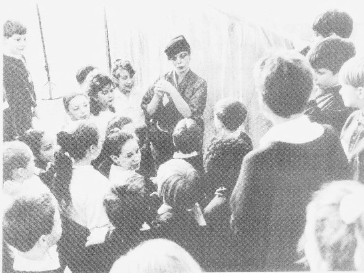
Figure 1. The participatory TIE programme devised by GYPT: The Longest Road

Role play - Usually describes an improvisation where actors or teacher and audience are in role together. This form is active, unlike hot-seating (above). The Longest Road , produced in 1993 by GYPT, in which the pupils are asked to play a group of refugees (see Figure 1 below), is a good example of this.