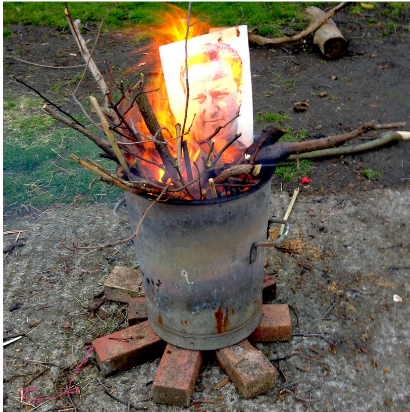
Figure 16 Burning-Taboo .

At the end of the conference we gathered around the fire, exuberant and exhausted. We placed a political placard (an unused art material) with an image of the Prime Minister David Cameron onto the fire. In context, Cameron had set in motion the Brexit referendum to decide whether the UK remained within, or left the European Union. The question was politically hostile and divisive, and provoked an upsurge in racist attacks linked to the leave campaign rhetoric such as the rallying slogan “Take Back Control” ( of the borders ), and its antecedent the Home Office “Go Home” vans in 2013 v . Later we became in touch with a feeling of taboo; of what it might mean to share this image. It felt like an act of scapegoating, blame and violence; complicating our allegiance to non-violent protest. We consider our place within systems of power, patriarchy, privilege and white supremacy. Sensing violence and horror coming closer to us and bringing with it fear and shame.