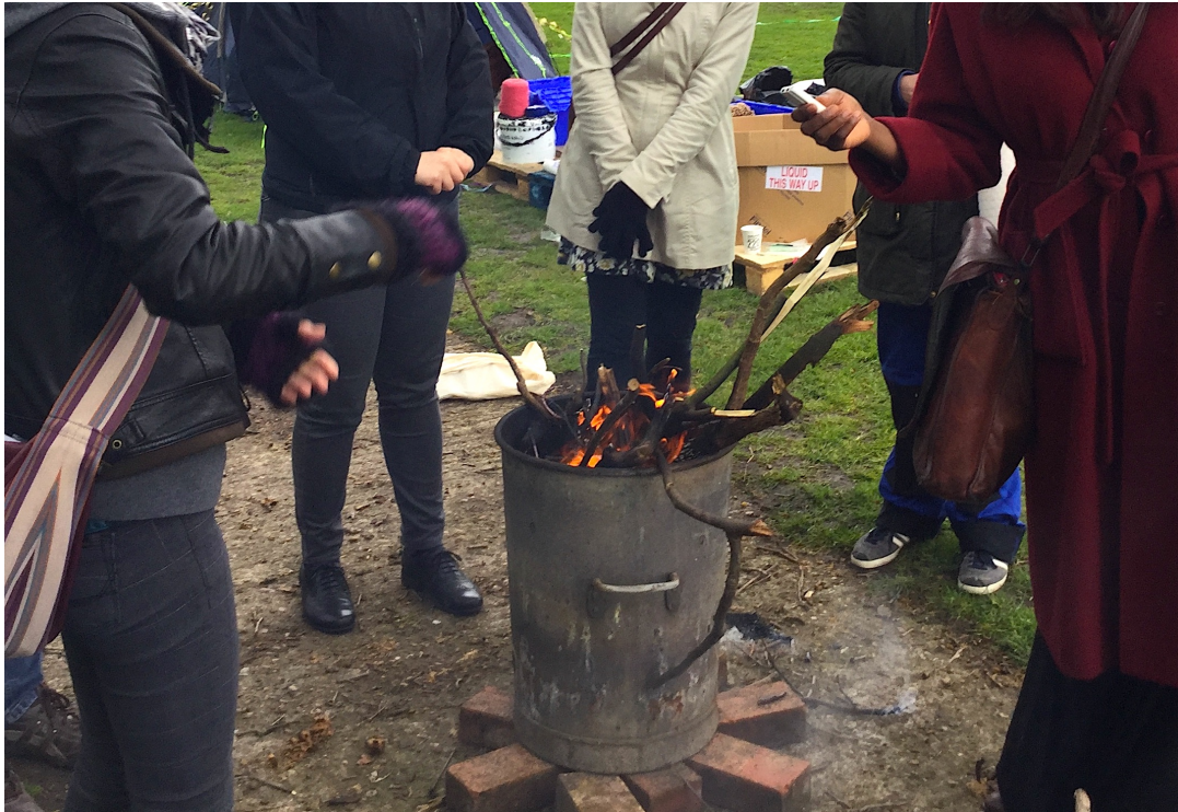
Figure 5 Fire-warmth.

We created signs and banners reminiscent of encampments and festivals (Figure 6).