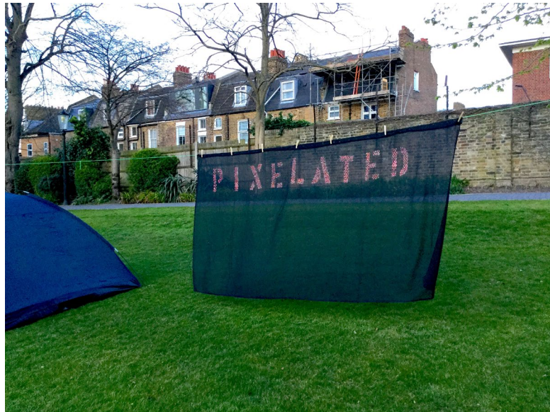
Figure 3 Pixelated .

“ Every place I have ever worked ” (Figure 2). We noted how art therapy is often pushed into/resides on the margins, the erosion of art therapy studios and how digital/virtual approaches/spaces have emerged. Asking ourselves questions about the virtual and physical presence of bodies in spaces in the making of relationships (Figure 3).