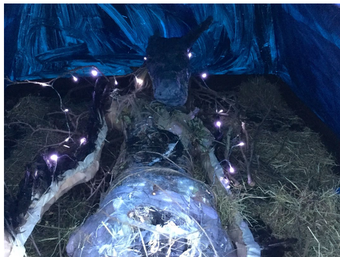
Figure 10 The Hybrid Creature inside the Tomb-Abject–Womb-Unknown tent.