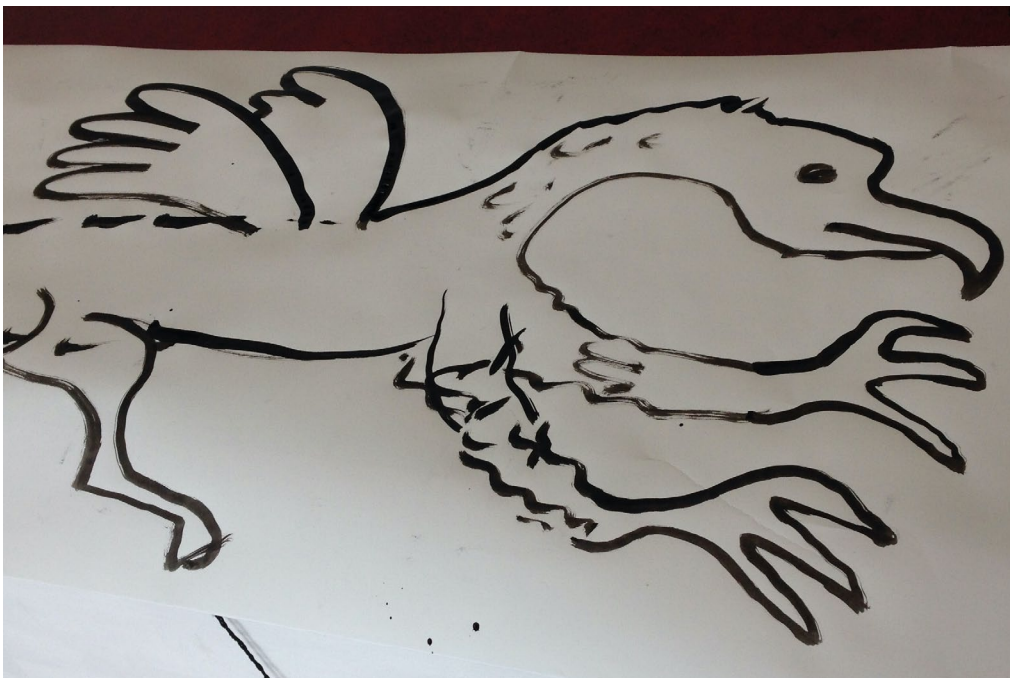
Figure 1 Hippogryph . Robin Tipple.

A fabulous creature born of a mare and a griffin.