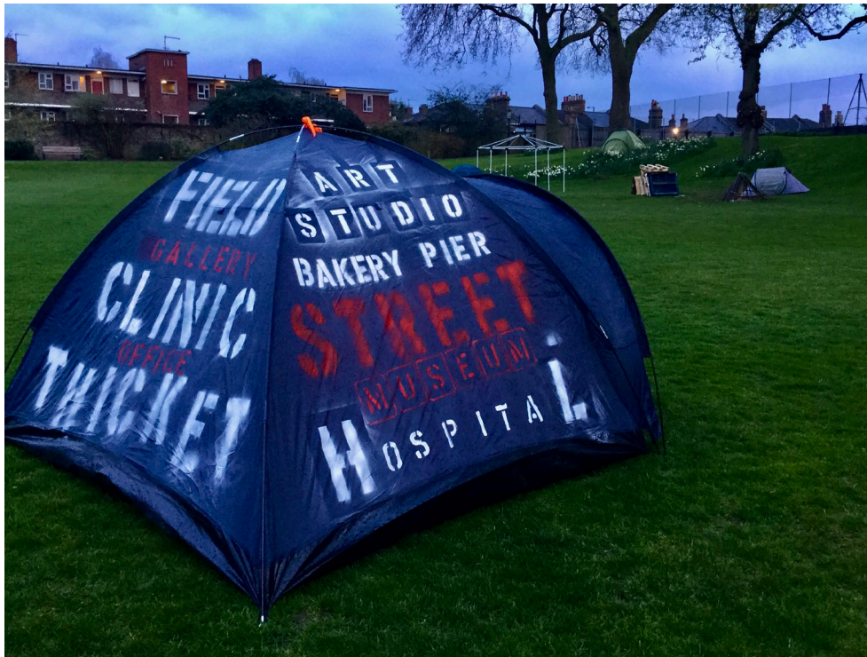
Figure 2 Every place I have ever worked.

invited to follow the contours of the outside in order to find what is folded inside (Deleuze & Guattari, 1988). In 'intra-action' (Barad, 2007) with each other, our 'selves', the site, the materials and some provocative philosophies, a 'third space' (Bhabha, 2004) of art therapy began to emerge.