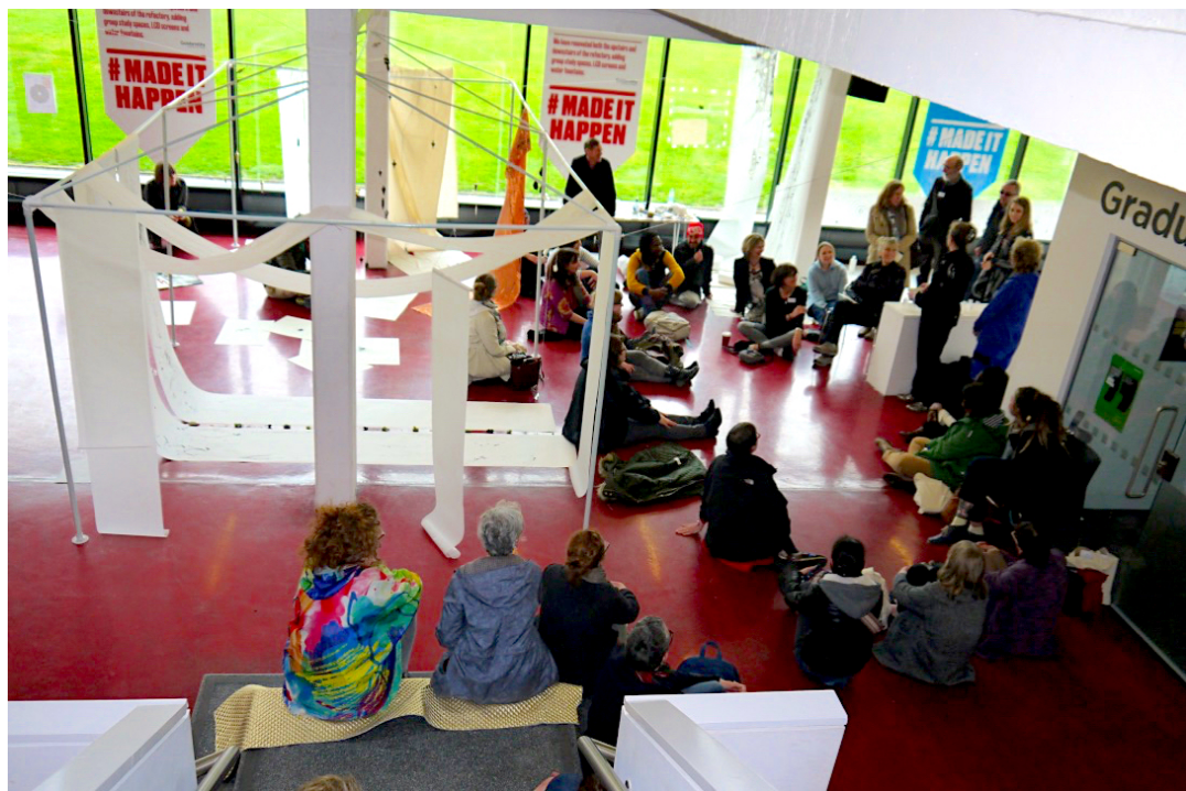
Figure 15 Inside review.