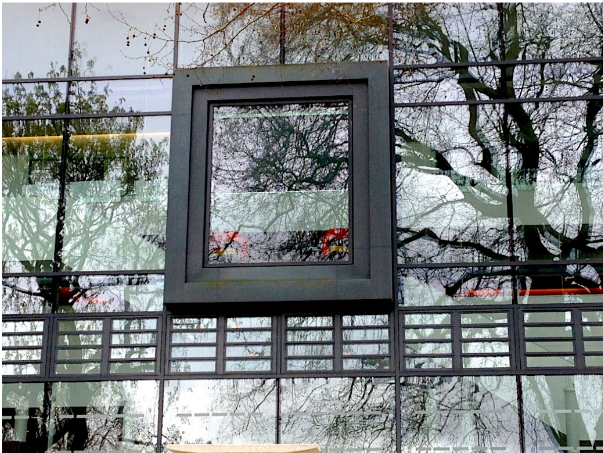
Figure 18 Entanglement-Interface.

Bound up in the entanglements of socio-political histories, peoples' experiences, philosophies, thoughts, beliefs, impressions, and associations, in locations, places, spaces, and materials; oddly entwined, incomplete, imaginative, unanswered, and open to further performance of something that oscillates between the abject/horrifying and as yet unknown.