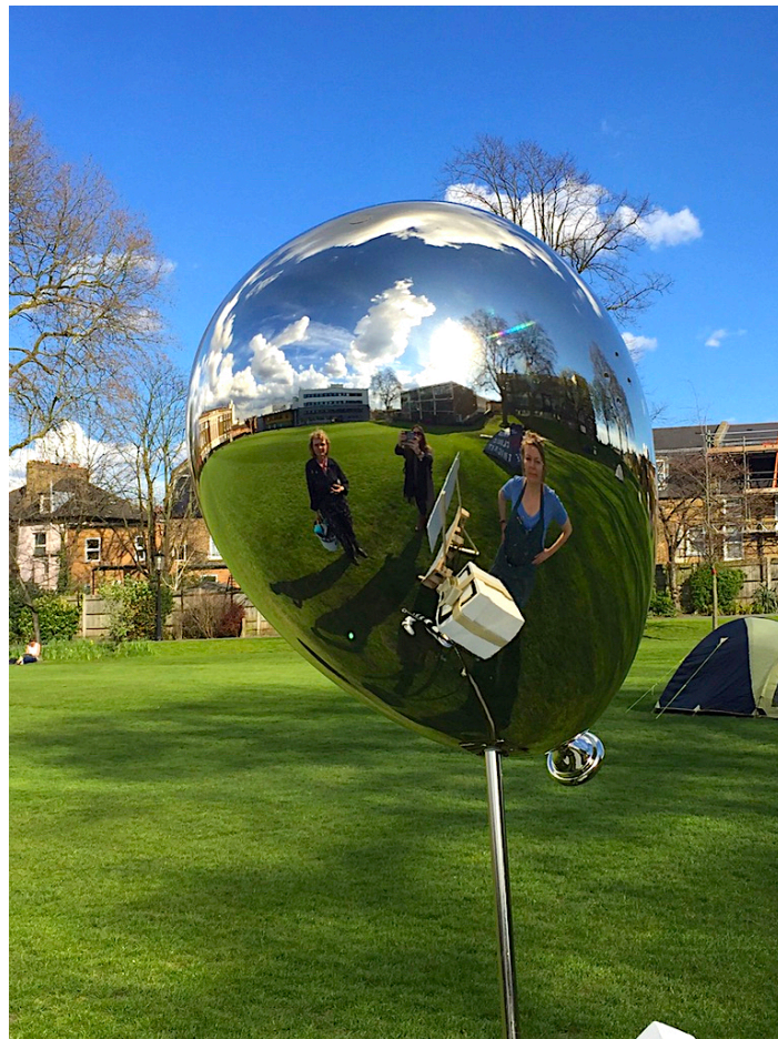
Figure 11 Golden Balloon .

Being in touch with the infinite in/determinacy at the heart of the matter, the abundance of nothingness, the infinitude of the void that is threaded in, through, and all around all spacetime-mattering opens up the possibility of hearing the murmurings, the muted cries, the speaking silence of justice-to-come. (Barad, 2012a, p. 216).