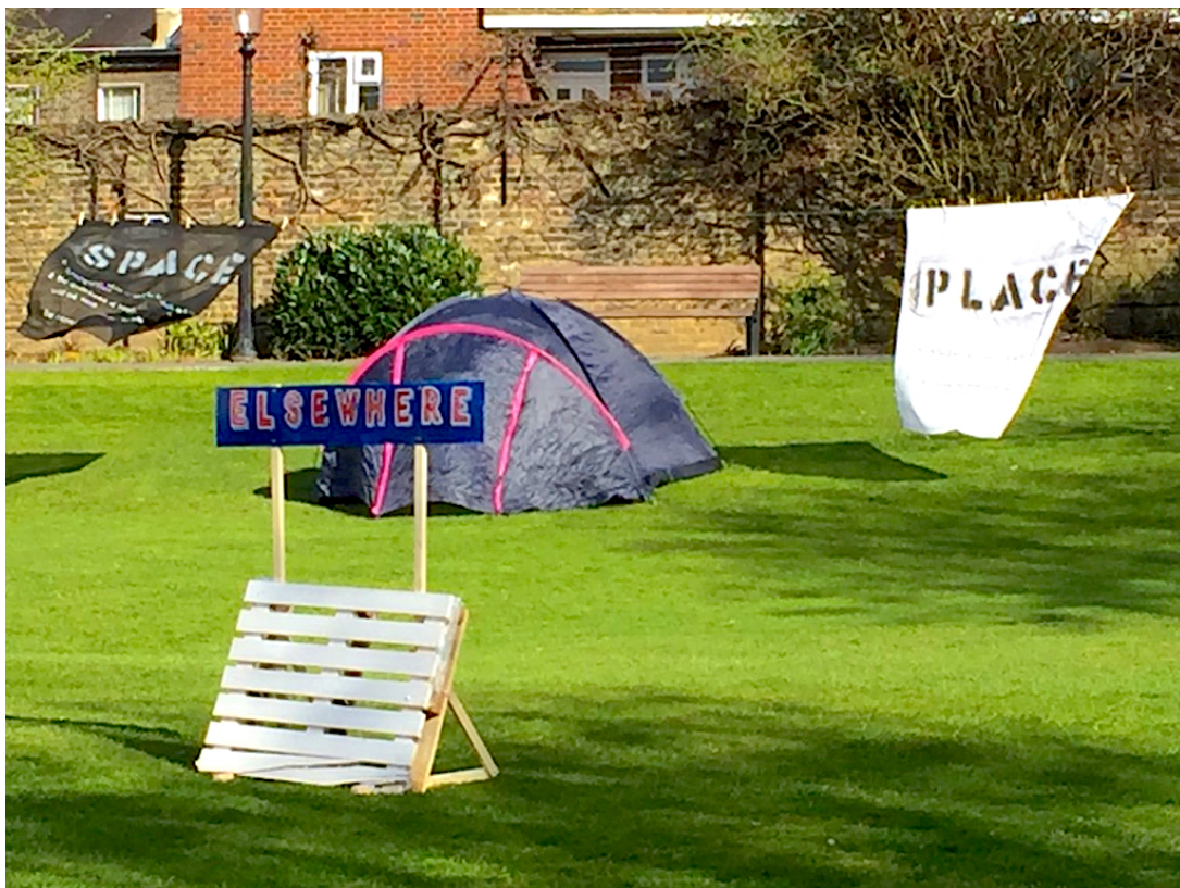
Figure 6 Space-Place-Elsewhere.

We created signs and banners reminiscent of encampments and festivals (Figure 6).