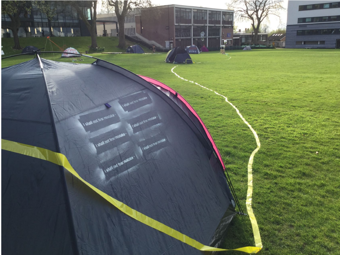
Figure 13 Tents.

Marking territories–boundaries-edges-depositing trails of matter.