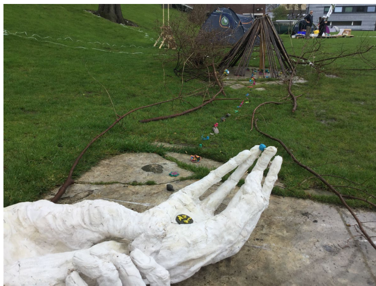
Figure 4 Robin's hands by Kristen Catchpole and miniatures.

The plasticine miniatures were arranged in a caravan between the sculpture of Robin's hands, and a protective shelter made with some recycled fencing (Figure 4).