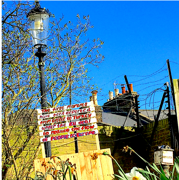
Figure 7 On the Surrey-Kent border.

The first migrants have been deported from Greece to Turkey under the EU deal to reduce the flow of People to Europe