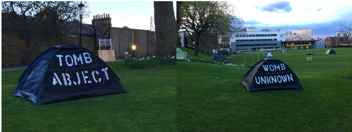
Figure 8 Tomb-Abject .

We recognised this statement was placed on the Surrey-Kent border partly as a response to shame. This came to light when a participant brought us in touch with a mother's pain due to the death of her child, throwing into disconcerting contrast the careless and emotionally disengaged position of placing this uncritical reportage of the plight of unknown 'others'; 'elsewhere' at the farthest reach of the field. We wondered now if this also related on another existential plane to shame and the female body? Perhaps connected to the female body present and evoked in 'Tomb-Abject-Womb-Unknown' (Figures 8, 9). This pregnant hybrid creature lying inside the tent has been reincarnated in several art/exhibition sites in the life of the art therapy training at Goldsmiths (Figure 10). We questioned what else we place at the farthest reaches of the field?