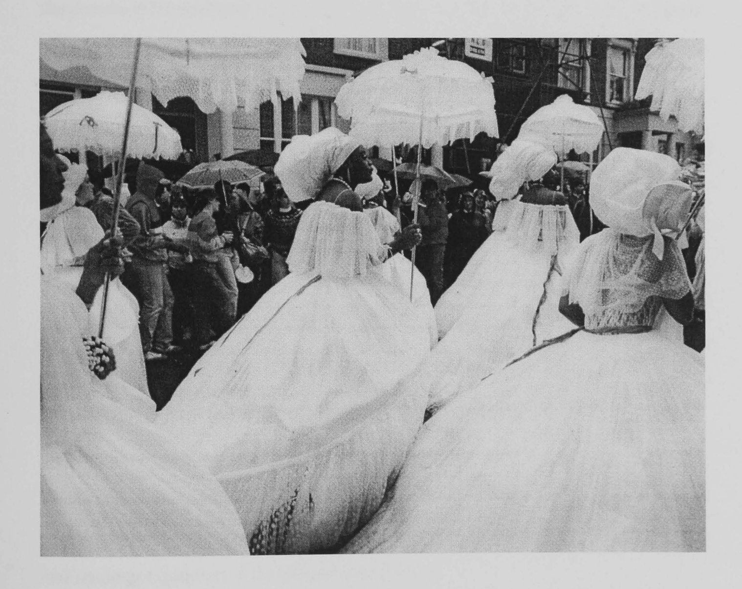
Newton Brown, Cocoyea: Plantations, photograph, 1986, London.

I am saying too that the experience of Black women lends itself to the notion of fluidity, multiple identities, repetition which must be multiply articulated.<sup>2</sup>