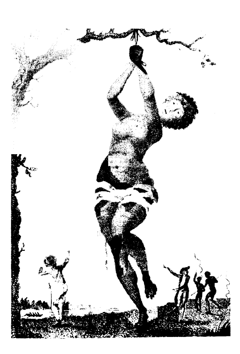
William Blake, Flagellation of a Female Samboe Slave, line engraving after the author's drawing, 1793.

word adding search to reach wind to spool to twist of thread along the Black stretch of ever into Silence that mocks the again in know the word discovers Word mirrored in Silence