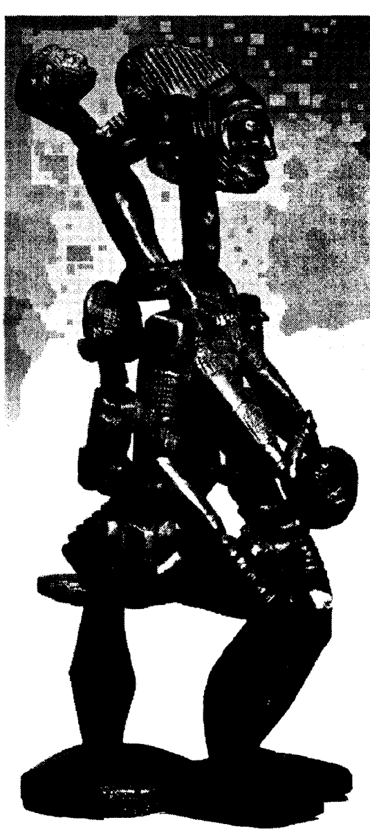
Eloi peoples, Nigeria, Maternity Figure , wood, 19th century, Horniman Public Museum and Public Park Trust, London.