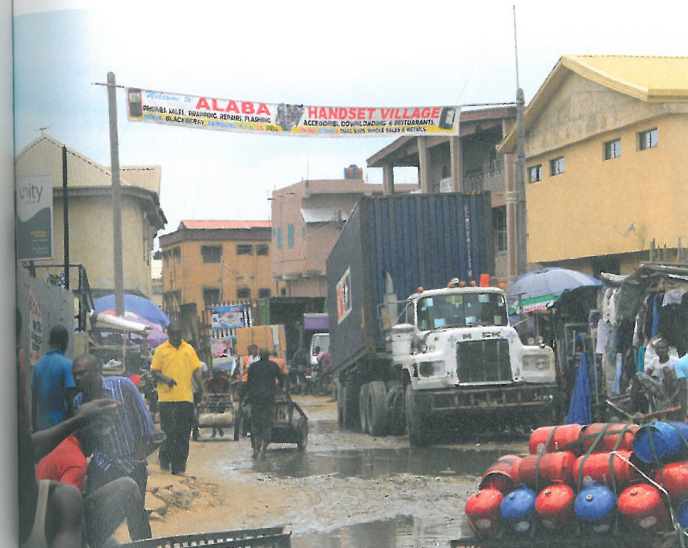
View of the Alaba international market located in Ojo, Lagos State, Nigeria.