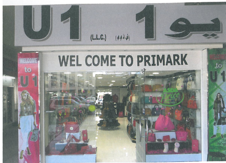
Karama Centre, Dubai, 2013.

always be immediately obvious from the everyday, business-as-usual atmosphere of targeted sites such as Shanghai's Qipu Lu malls, the thousands of stalls in Yiwu's International Trade City, or the Asian trade centers in Toronto's Golden Horseshoe area.