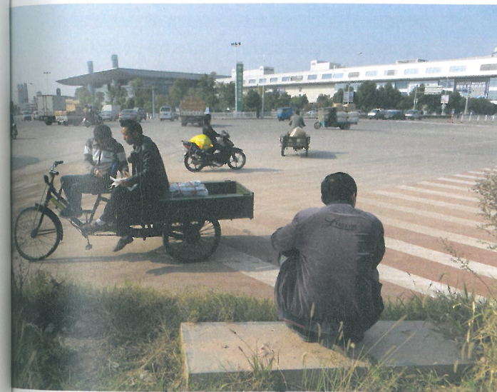
International Trade City, Yiwu, 2012.

itself with lifestyle accessories in trendy settings—are places of both resistance and commodification. 1