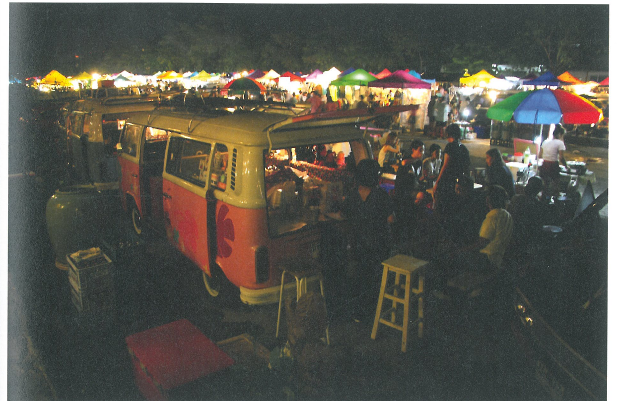
Talad Rot Fai, Bangkok, 2012.