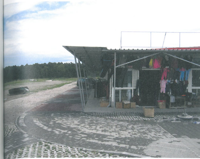
Arizona Market, Brčko, 2006.

Other internationally entwined yet locally unfolding crises also triggered the temporary phenomenon of the Iranian Bazaar in the Turkish city of Gaziantep, which came into existence in the 1990s in response to detours taken by Iranian Shia pilgrims to circumnavigate the Middle East's many pockets of sectarian violence, and found an abrupt end when the Syrian crisis escalated in 2012. As spaces of exception, informal markets uphold economic systems while engendering encounters between otherwise incompatible realms of operation; established routines and relations are thus negated in a particular locale. Sites of alternative exchange—in dropout communities like Quartzsite in the Mojave Desert in southeastern California, as well as the new wave of creative entrepreneurship at hipster markets, where a young urban crowd surrounds