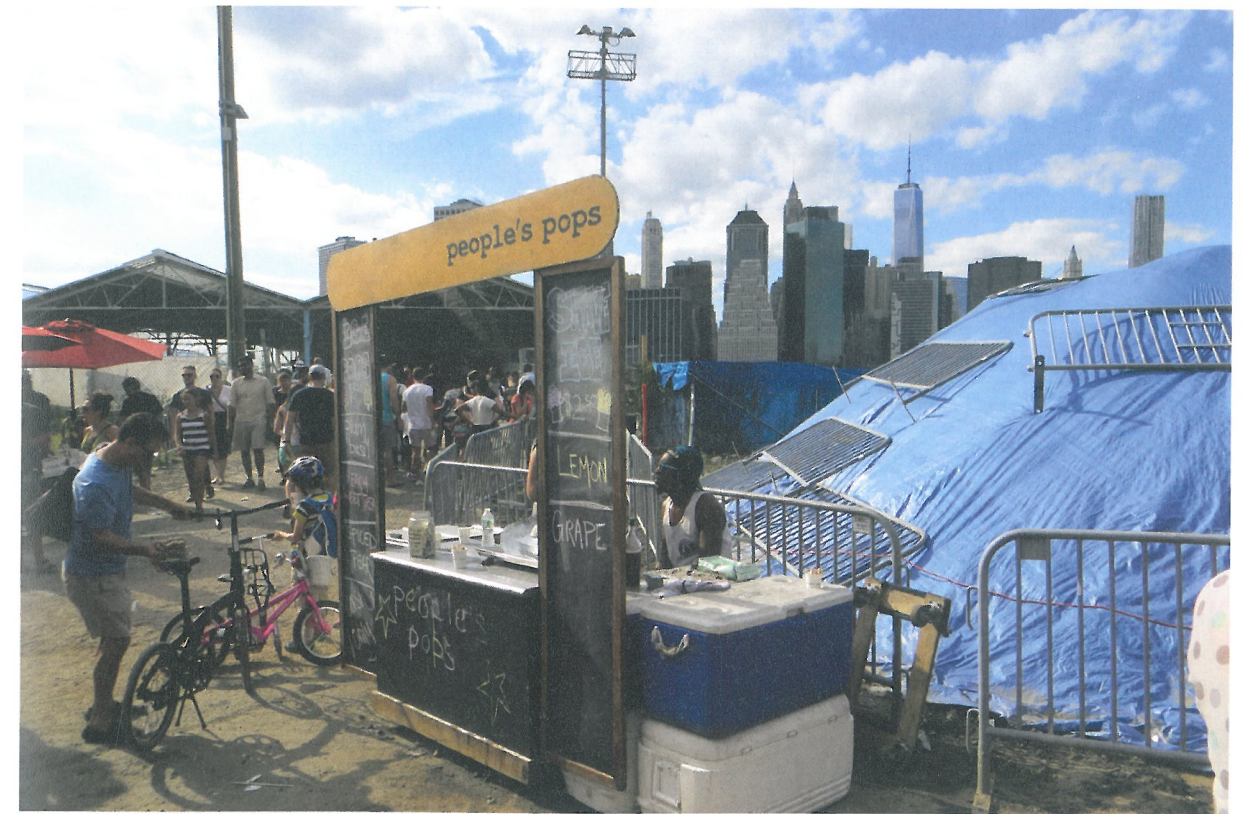
Smorgasburg, Brooklyn, NY, 2014.

Attributing a state of informality—describing something as “other”—has come to serve as a convenient vehicle for top-down intervention, and it is high time we engaged with these assemblages from the perspective of those who are implicated in them. Besides providing livelihoods for themselves, the biggest achievement of informal sellers lies in the creation of a unique common good—the establishment of a market environment. Informal markets are not a naturally given occurrence but only come into being through collective action and contribution. This scope and value of informal markets then becomes interesting as an economic resource to outside parties. Similar to the contestations around the control of, and profit extraction from, other commonly held or pooled resources, questions concerning the people involved in informal markets are overshadowed by struggles over how to best appropriate the capital flows generated by this trade. 17 The fact that the main argument put forward to legitimate acts of intervention is one of improvement and better management highlights the value of what is produced in informal conditions. What is at stake in “improving” informal markets is the control over the market environment, and