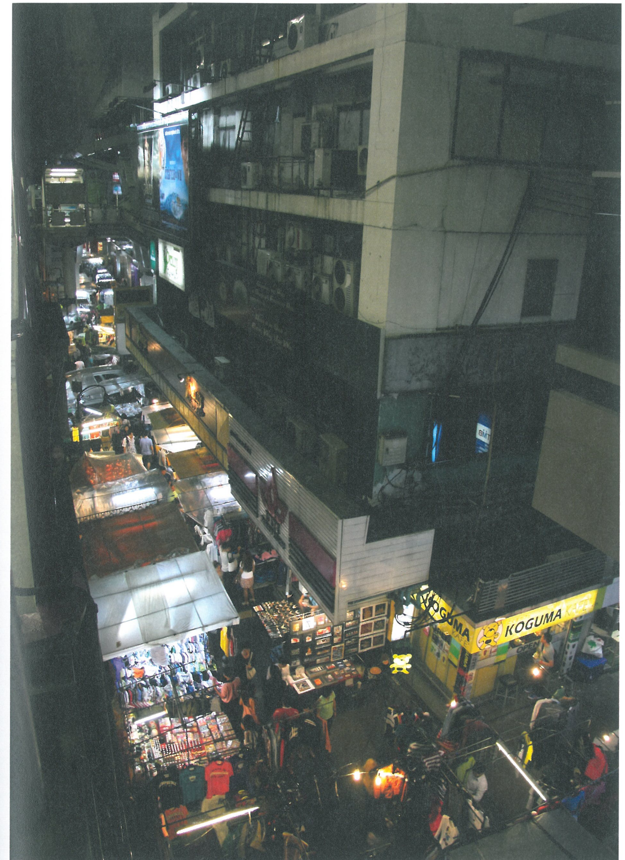
Patpong, Bangkok, 2012.

In contrast to the hegemonic understanding of growth, informal commerce does not necessarily entail unfettered expansion and augmented resource consumption. This alternative perspective rests partly on informal markets' micro-scale operations, which allow for variegated forms of economic exchange more attuned to the actual needs of populations, and partly on opportunities opening up through online trading platforms, which might allow for more complex circuits of usage and recycling. As materials and relations move along these trajectories, entering legal and illegal domains and being put to use in