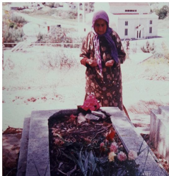
Figure 2: My grandmother praying. Alaminyo, April 2003. Author's photograph.

Herbs had sprouted around the school, and nearby there was a mosque, which was in good condition and looked as though it had recently been painted. This came as a surprise, since we had heard from Turkish Cypriot officials that many of the Turkish properties, houses, buildings, graveyards etc. in the south had been demolished. At the front of the school were four martyr graves: the graves of my grandfather, two uncles and cousin, who died in 1967.