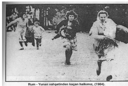
Figure 7. Caption translation: “Our people escaping from the Greek and Greek Cypriot brutality”.

Such photographs have “symbolic power”, in the Bourdieusian sense of “a power of constructing reality” (Bourdieu 1994, p.164). This was a concept that Bourdieu developed throughout the entirety of his scientific life. For Bourdieu (1994, p.164), symbolic power is “the power to make people see and believe certain visions of the world rather than others” – “invisible power which can be exercised only with the complicity of those who do not want to know that they are subject to it or even that they themselves exercise it”. I argue that the photographs shown above function in this way, as a modality of symbolic power: they are richly