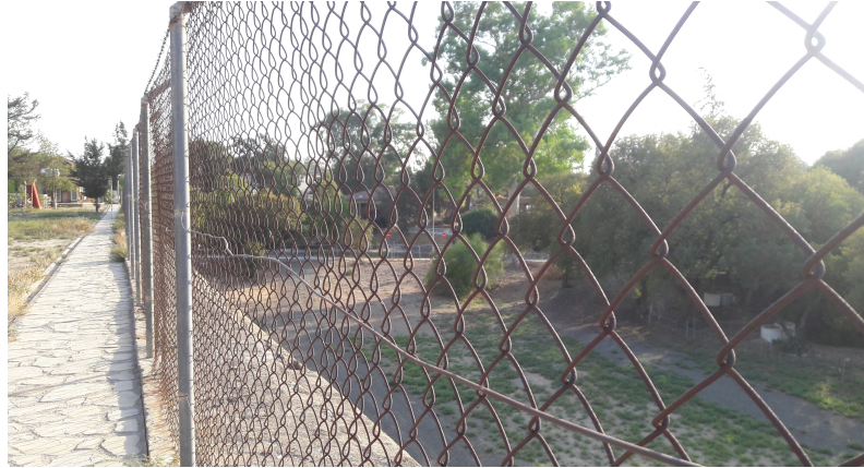
Figure 1: The United Nations Buffer Zone, Arab Ahmed area of Nicosia, July 2016.

Before the opening of the Green Line, I used to look from the Turkish side into the distance, across the barriers at the end of Nicosia (Figure 1). Damaged buildings, the Greek flag waving in the wind, church bells, cars, and sometimes people were all I could see and hear. The “other” side was an unknown place to which we could not travel and about which we did not know. It was a blank space where the Greek Cypriots lived. For twenty-nine years, Turkish and Greek Cypriots were not allowed to pass through the United Nations (UN)-patrolled Green Line, which separated the two communities from each other not only physically but also emotionally, culturally and religiously. 1 For a young Turkish Cypriot, this multilayered division, and the sense of mystery surrounding the area, led to wild imaginings. When I was a child, I used to spend two or three hours every day in Nicosia old town, the Arab Ahmet area, located at the end of the Turkish part of Nicosia, right next to UN Buffer Zone. My brother was a player for Cetinkaya Football Club, the professional team located in this area. Often we would take him to training, and I would wait for him to finish, with my mother and sometimes my father. The end of Nicosia was a place where my imagination began to play tricks on me. I remember asking myself as I looked over the fence: what is on the other side? Does it look like Northern Cyprus? What do the people look like? If they were to see me standing here, how would they react? Would