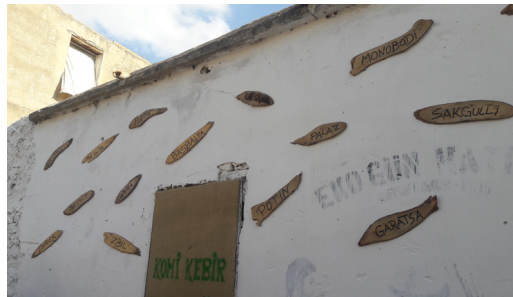
Figure 12. Words used by Turkish Cypriots in Turkish Cypriot dialect, displayed on a wall.

There is also a display of words on a house wall (Figure 12). Language is a marker of cultural hybridisation in Turkish Cypriot society. The words displayed on the wall, which include piron (fork), potin (shoes), iskemle (chair), gabira (toasted bread), ispaho (yarn), belesbit (bicycle), lagani (waterway) and bavuri (tin water bottle), are in the Turkish Cypriot dialect; 31 they are not used in standard Turkish. Thus, they serve to represent a symbolic distinction from mainland Turks. Some of these words also represent the linguistic similarities between the Turkish Cypriot and Greek Cypriot dialects. According to the Joint Dictionary of Greek Cypriot and Turkish Cypriot Dialect (Hadjipieris 32 and Kabatas, 33 2017), piron , gabira and bavuri are among the 3,500 common words used by Greek Cypriots and Turkish Cypriots. Kabatas (cited in Vasiliou, 2016) states: