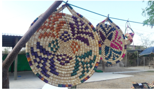
Figure 11. Traditional sestas .

co-existed peacefully, particularly during the 1950s.