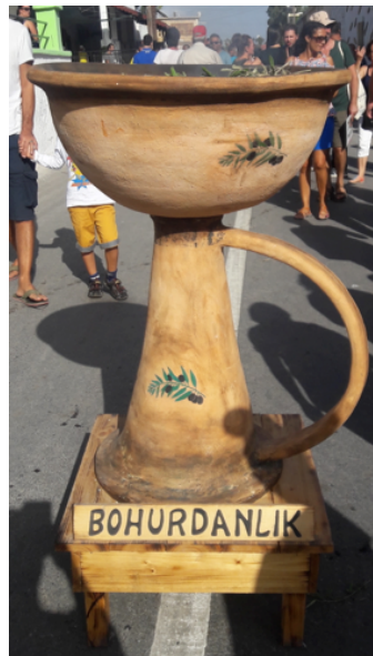
Figure 10. Buhurdanlik.

Bi-annually, in May and October, Buyukkonuk village turns into a bustling marketplace. Villagers keep themselves busy by preparing the homemade products in which they take such pride in and sell and share at Buyukkonuk Eco Day. Many traditional foodstuffs, such as Cypriot hellim cheese, zeytinli and hellimli (olive and hellim bread), lokma and harnup pekmez (carob molasses) are on display, along with traditional handicrafts. The festival lasts from dawn to dusk and the small village becomes a vibrant centre for celebration. I attended the festival in 2016 for the purposes of this research.