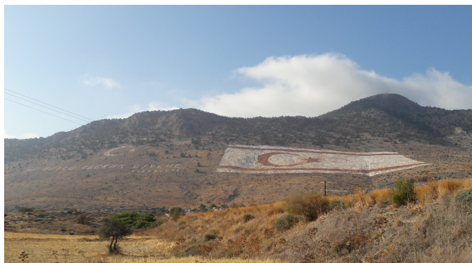
Figure 16. The TRNC flag on the Kyrenia Mountains.

As already pointed out (Chapter 2), Cyprus was divided in 1974 as a result of the tensions between two different nationalisms: Turkish nationalism, and Hellenic or Greek nationalism. Although Greek Cypriot society continues to be influenced by the culturally rich narratives of Hellenism, it is argued that Greek Cypriots have moved away from the discourse of Cyprus as the great island of Hellenism (especially since the division of the island) and embraced the RoC (Kizilyurek, 2018, p.31). In Turkish Cypriot society, however, the situation has been quite different. For Kizilyurek (2018, p.32), 1974 marked the beginning of a “fictional homeland”. Turkish names were given to the places from which Greek Cypriots had been expelled. Kizilyurek (2018, p.32) argues that this policy of “toponymy” was put into practice in order to erase traces of both Greek Cypriots and the British Empire. Symbols of Turkish nationalism were placed on mountains; Turkish flags were erected everywhere.