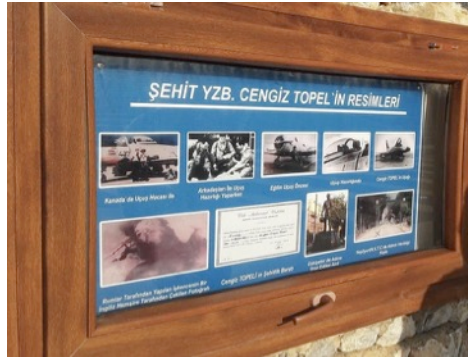
Figure 8: Debris from Cengiz Topel's Plane.