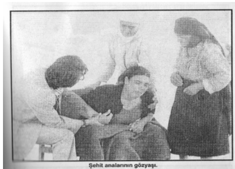
Figure 6. Caption translation: “Tears of the martyrs’ mothers”.

have become fundamental components of official state-sponsored memory and serve to produce the materiality of war (Puwar, 2011). Such photographs are used as documentary evidence – incontrovertible proof – of what occurred in the past. They present truth and veracity, seemingly untouched and unmanipulated. In Figure 7, for instance, women are shown fleeing in terror, creating a gendered depiction of suffering. Greek Cypriots are nowhere to be seen, but they are connoted as the invisible terror that is creating the suffering. It is this existential threat that the viewer is incited to connect with.