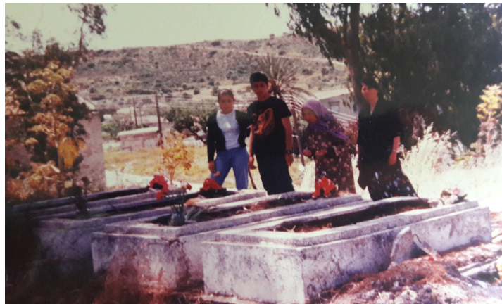
Figure 3: Left to right: me, my brother, my grandmother, my mother. Alaminyo, April 2003.

When my grandmother first saw the graves, she felt relieved, primarily because the graves were intact and had not been destroyed. Ironically, during my research I discovered that the street where the graves and mosque were located had been named after the EOKA 3 leader – “Grivas” – following the war. Despite her feeling of devastation, my grandmother meticulously placed a set of plastic flowers she had brought from the north on each grave. Weeping inwardly, she started to say her prayers, and then watered the graves (Figures 2 and 3).