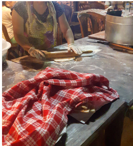
Figure 15. Turkish woman making gozleme .

The final characteristic of post-postcolonial inclusion is the exclusion of mainland Turks. (I provide an in-depth discussion of this counter-hegemonic strategy in the following chapter.) I found that my participants constantly denigrated mainland Turks as backward people who posed a threat to Cypriot culture. Participants reconstructed, manipulated or reinvented older versions of ethnic boundary formation in order to create new ethnic boundaries where culture was seen to offer advantages in relation to present-day situations, interests and challenges. Any degree of cultural difference is enough to construct new ethnicities.