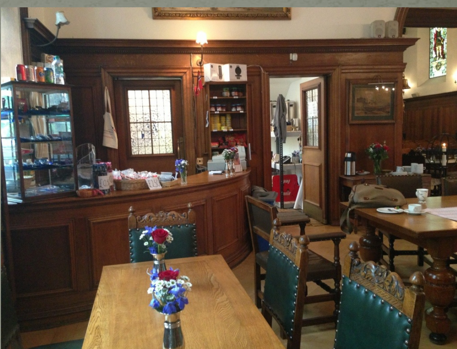
Norwegian Seamans' Church, Rotherhithe