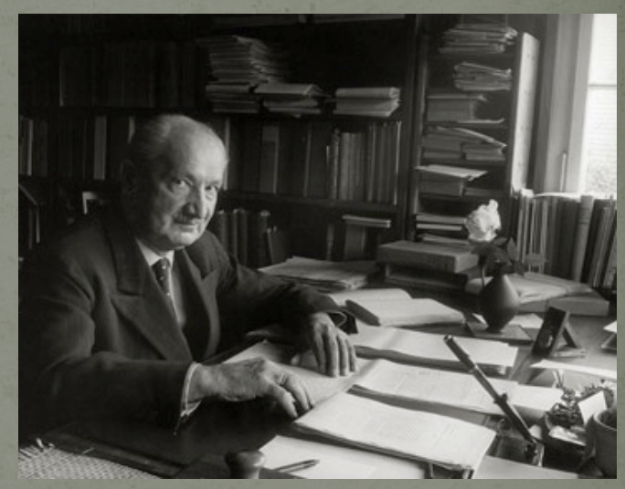
3. A Philosopher At Work

on payment (in advance) of Sixteen Shillings,