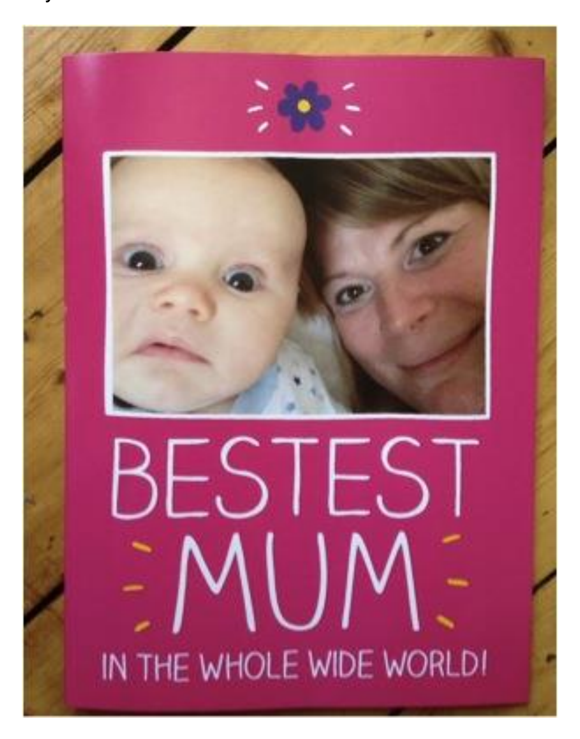
Figure 8. Mother's day card. 2017.

As a therapist and having just become a mother I am thinking a lot about Winnicott's holding environment to be a 'good enough mother' to my baby. This mother's day card plays with the idea of an idealized mother.