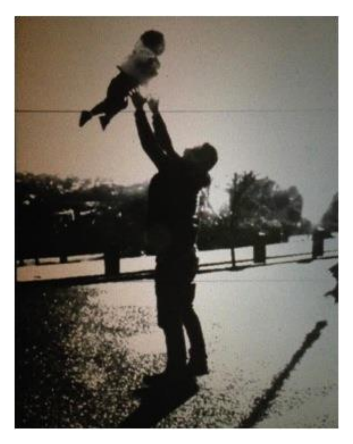
Figure 1. Saudade. 2014.