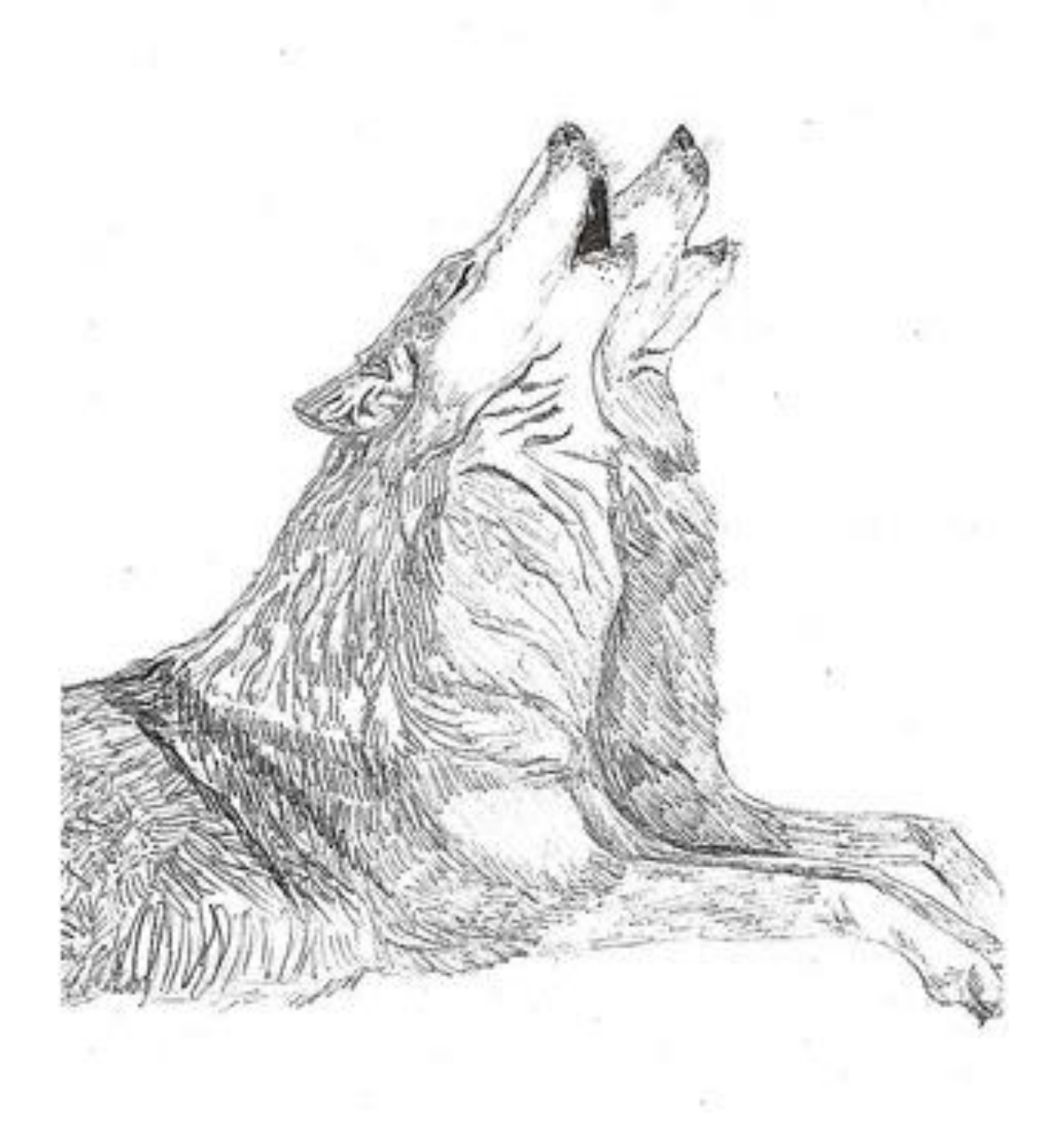
Figure 9. Wolf Music. 2017.

I think Winnicott's idea of the mirror role of mother and family is one of the most significant aspects of being an art psychotherapist and artist for me, enabling a sense of being truly seen and a deep feeling of acceptance. The artwork can act as a mirror and grasp something, reflecting it back more fully