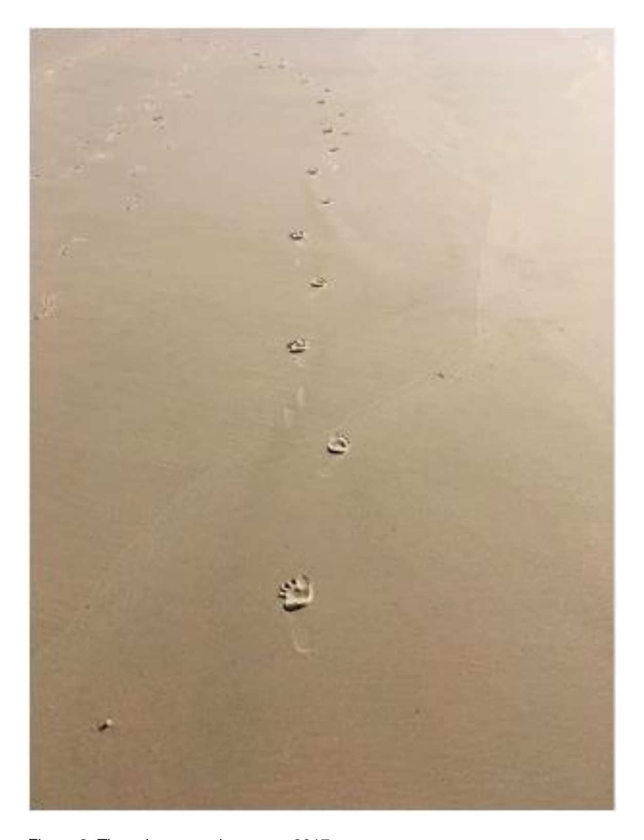
Figure 2. There I am, running away. 2017.