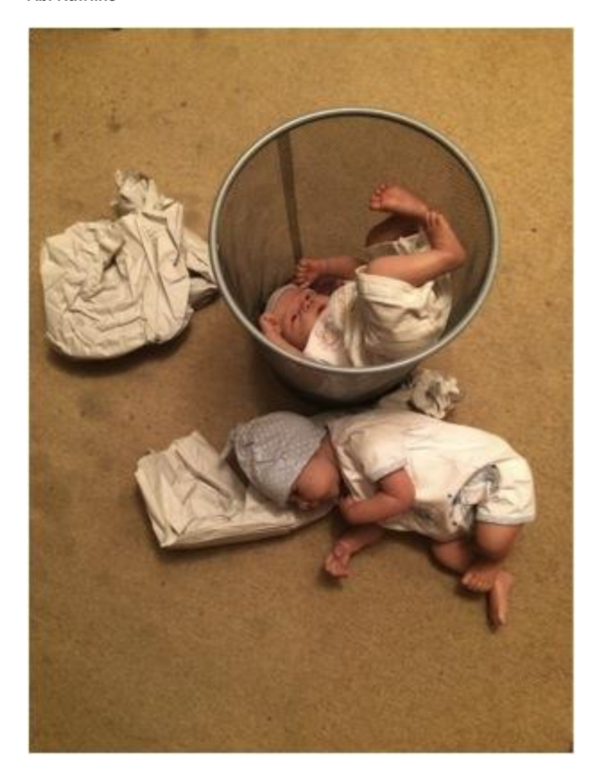
Figure 3. Are You Sitting Comfortably? 2017.

Working to develop therapeutic alliances with people living inside forensic mental health services, I turn to Winnicott's concept of the 'Good Enough Mother'. I reflect on his work as I enter landscapes of devastation and