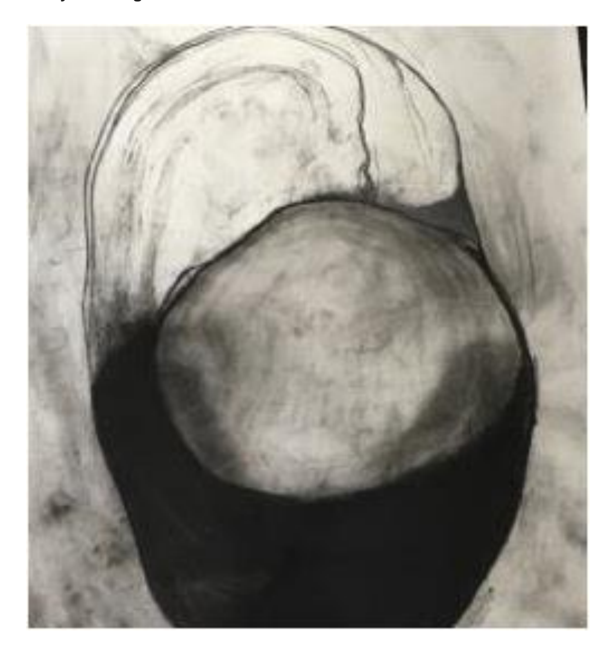
Figure 5. Untitled. 2017.

The work and writing of Winnicott and my involvement in Winnicott Wednesdays play an important part in my development as an art therapist and artist. Being an artist for me is in essence allowing myself to play, create,