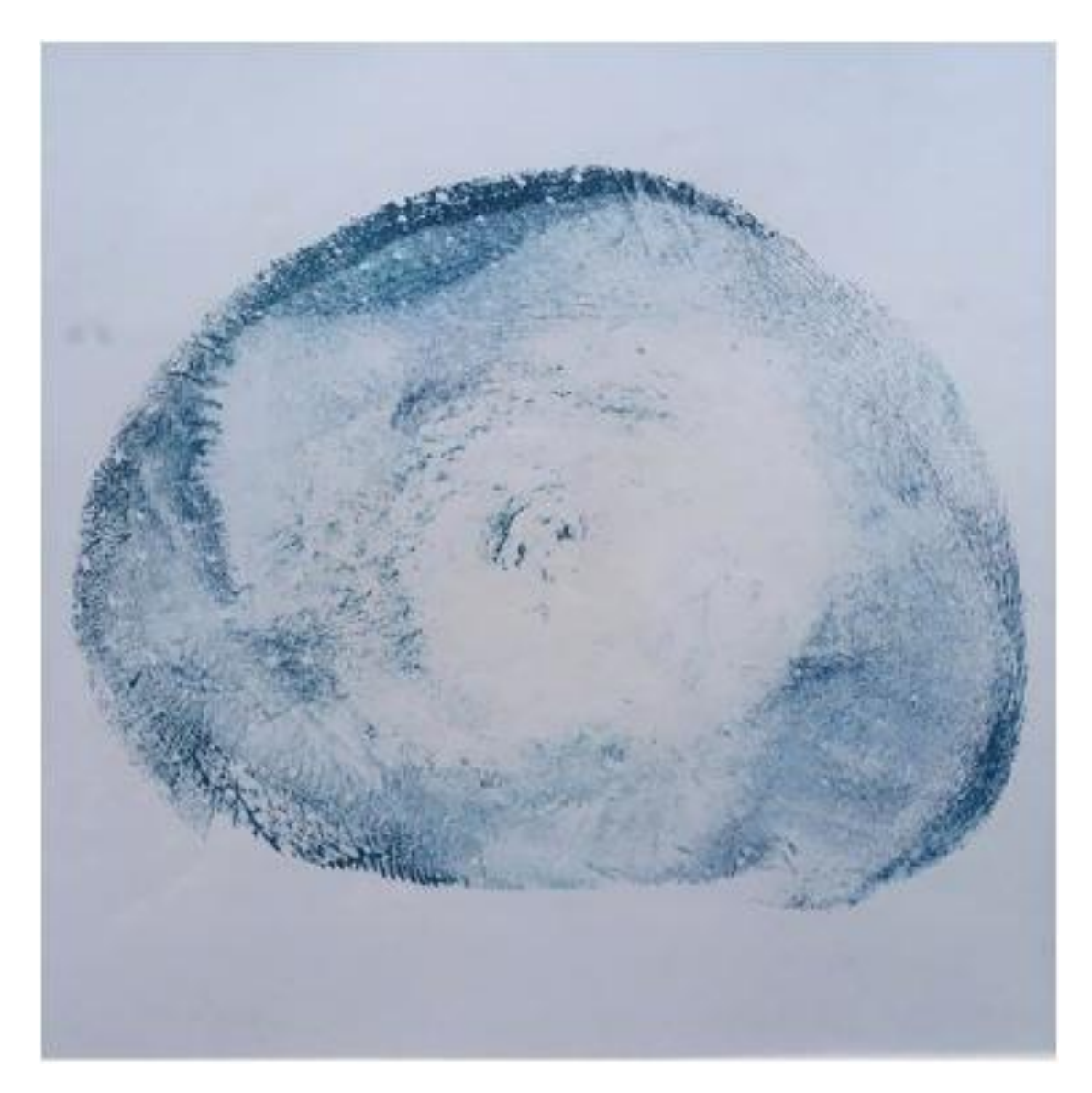
Figure 7. My Right Breast. 2015.

This image came into being after the birth of my daughter. I had always planned to breastfeed, however was unaware of the pressures and strong opinions had by professionals and new mothers about what was the 'right' thing to do. When thinking about Winnicott's ideas, I realised that they are present not only within my work but also in my day to day life and relationship with my daughter, especially regarding his concepts of a 'good enough mother' and 'transitional object'.