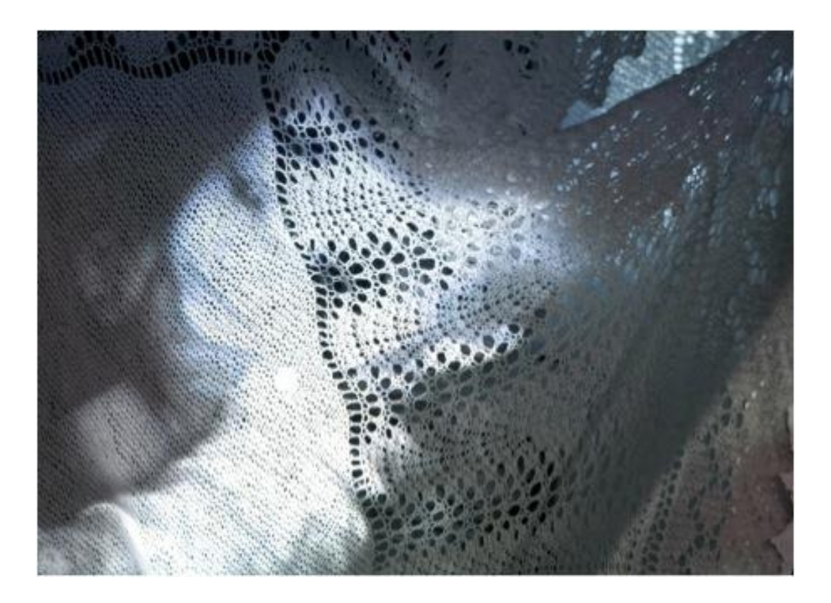
Figure 6. You/Me. 2017.

Winnicott's thinking on transitional phenomena often comes to mind as a therapist, artist and mother. His ideas about transitional objects have given particular meaning to a baby blanket that was handed down to me by my mother. It is a soft, hand knitted blanket with intricate stitching and I recently used it to wrap my baby in when she was first born, when she was sleeping or feeding. As Winnicott has described, I watched her try to pull a little bit of the blanket into her mouth as she was feeding or sucking her thumb, or hold the edge of it in her fingers.