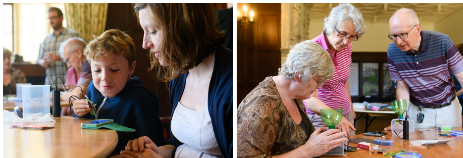
Fig. 2. Mynaturewatch Wakehurst Place workshops.

“The beauty of the project is that technology usually makes kids stay indoors and not explore the outside world, the combination is powerful” ( host comment ).