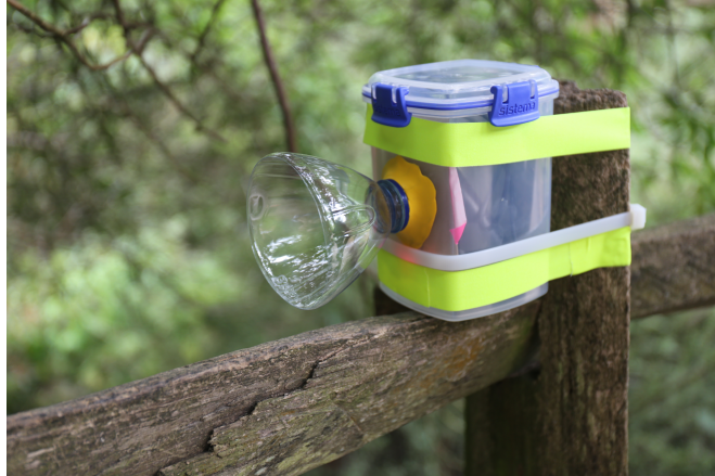
Fig. 1. A Mynaturewatch camera deployed before a workshop at Wakehurst Place.

In parallel research Hecker et al state “research in citizen science takes a diverse approach where the balance between scientific, educational, societal and policy goals varies across projects” [57]. The authors noted, “a major obstacle [in] preventing the adoption of technologies is the presence of those entrenched in traditional solutions” the Mynaturewatch advantages do not compete with traditional methods, but advance them [58]. Participants early images were evocative, but they often deleted them feeling unworthy, personally comparing to project partner BBC Earth pictures.