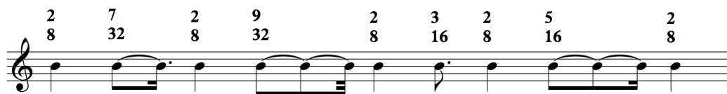
Figure 13: Conversion of time signatures to rhythmic line

This process is used to create time-lines , which are then projected onto other time signature sequences. In Figure 13 below, the time signatures from movement one have been subdivided by the time-line from movement VI, which is used to further define the distribution of rhythmic materials.