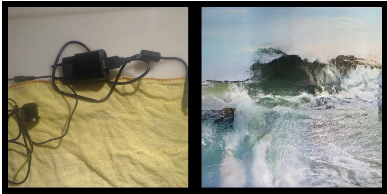
Fig. 1. A frame from Learning to See using a model trained on ocean waves. Left: live image from camera. Right: output from the software. (© Memo Akten, 2017)

Our instrument can be described as an image-based artificial neural network trained on a number of different custom datasets, making predictions on live camera input in real time. Our system processes the live camera image and reconstructs a new image that resembles the input in composition and overall shape and structure, but is of a particular nature and aesthetic as determined by the different datasets, e.g. the ocean, flames, clouds, flowers, etc. We also use the same system to create and present a video artwork (this can be viewed in the accompanying video at https://vimeo.com/332185554 at 00:00–03:02). Figures 1 and 2 show example frames.