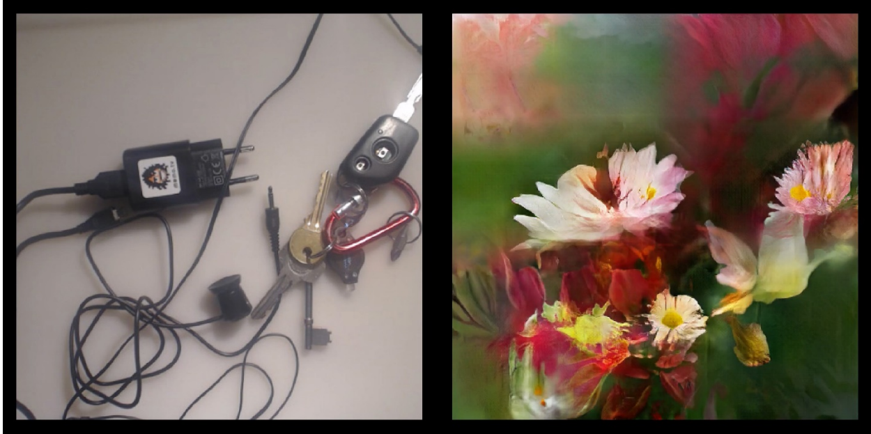
Fig. 2. A frame from Learning to See using a model trained on flowers. Left: live image from camera. Right: output from the software.