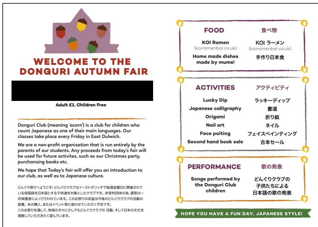
Figure 9 Image: Donguri matsuri flier 2016

or exchanging knowledge of their creative interests throughout the day.