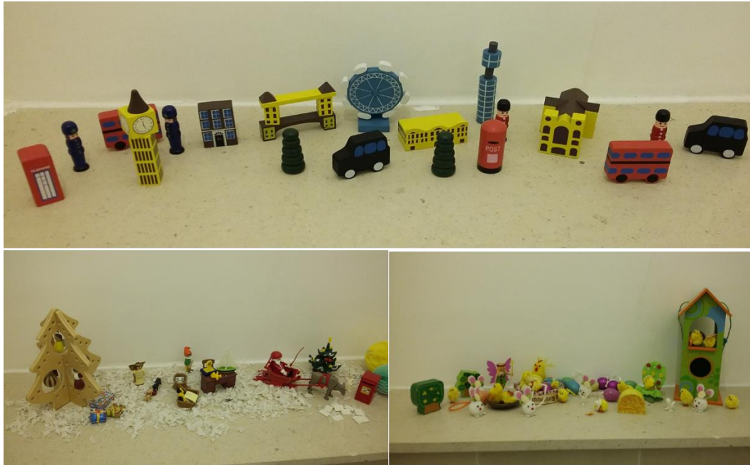
Figure 7 Photo: seasonal miniature objects at Saki's home

reappear as the structuring aspect of the habitus, reproducing their childhood rules and discourses in a different field of domestic life in southeast London.