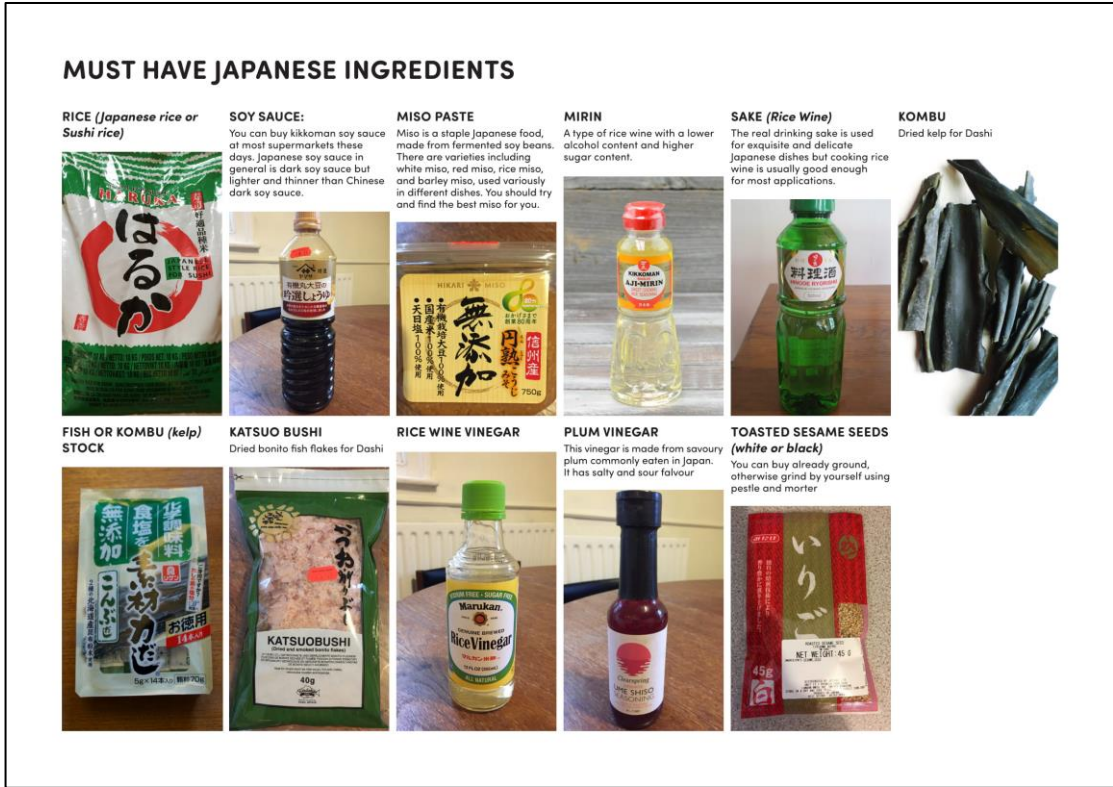
Figure 14 Image: from MIKI meshi recipe booklet 2