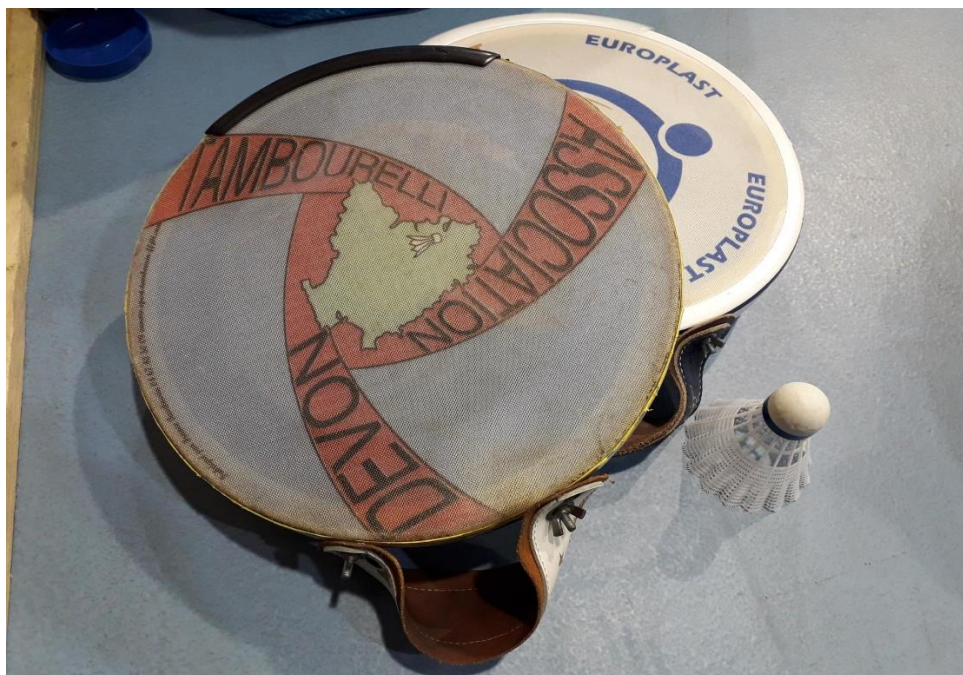
Figure 11 Photo: Tambourelli disks and a shuttlecock

There were about fifty people taking part in the tournament throughout the three days, who came from a wide range of age groups and different areas; Devon, Scotland, London and even from Germany. In the evening of the first day, after having the dinner cooked by the organisers, we had a draw to choose a partner to play with in a pair as well as opponents to play against. From the morning of the next day, based on the result of this draw, each player had to find their opponents and also ask someone to be a judge and play matches in six outside courts simultaneously. Basically, each player had to play three games in the first-round group and only the top two players from each group could make the championship round. Interestingly, there was no particular opening ceremony or timeline to follow but all the players, even children, knew what to do and tried to make arrangements to play all their assigned games. And despite this self-organising aspect of the tournament and the mixed level of the players (while there were absolute beginners from London, the German players were very serious and have regular training three days per week), all the players were serious when they were playing and both players and audiences got excited.