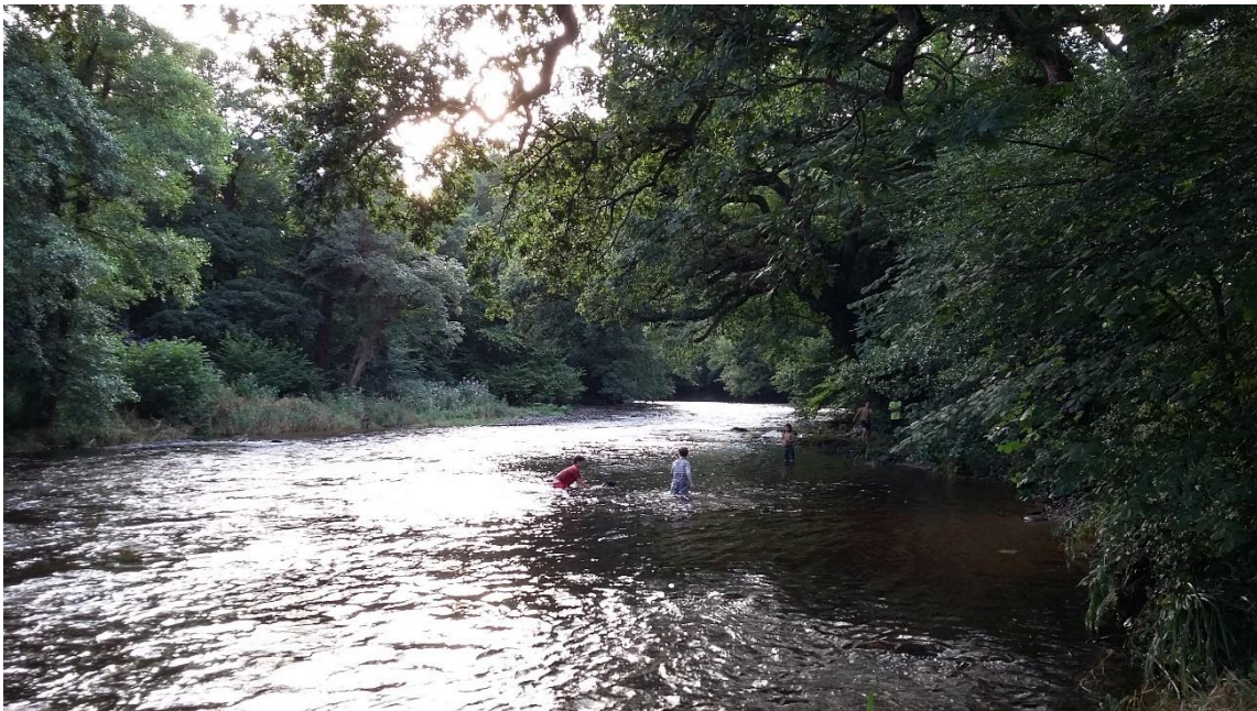
Figure 12 Photo: Tambourelli World Tournament 2

bottom of the river and rub it to the surface of the dishes and rinse. Not just this but also placing a scoop of sawdust into the temporary toilet after use and jumping into the river when one got sweaty – these practices, which were common in the camp were very surprising to both me and Kyoko at the beginning. However, it did not take long until we got used to this outdoors environment and on the third day Seiko and I changed into swimsuits and went into the cold river where children were swimming to rinse our sweaty body and hair in the stream. Even though Kyoko did not come into the river, she also washed her hair directly by kneeling down on the bank.