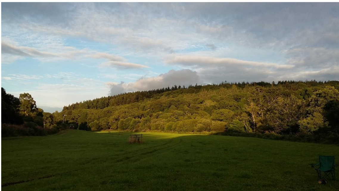
Figure 10 Photo: Tambourelli World Tournament 1 (The camping site)