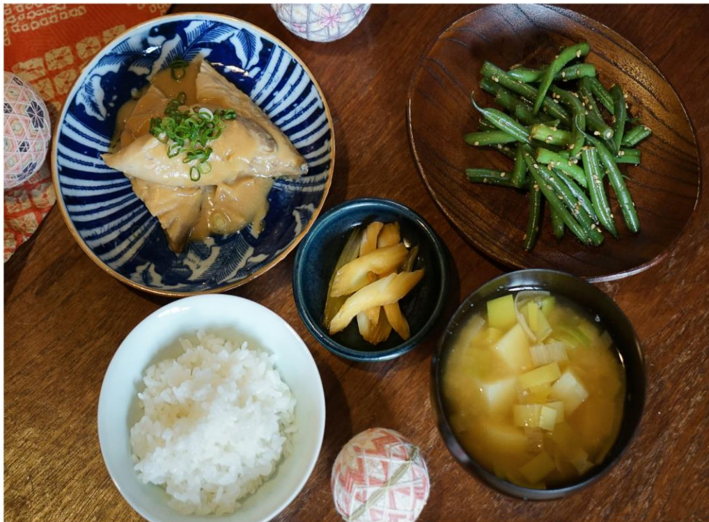
Figure 13 Image: from MIKI meshi recipe booklet 1

with many colourful photos nicely laid out, to show how to cook basic Japanese food using ingredients accessible in London. I saw immediately that it had taken a lot of time and effort to make such professional looking cookery book. Ai told me that she had cooked a prototype at Kanako's house and took photos of it to make the leaflet, as well as to elaborate the process for the day – what they should prepare beforehand and what information should be shared. Ai said “We cannot make this event just for one off, because otherwise our all efforts and investments would not be paid off” as a joke, but after looking at such a well-made leaflet I had to agree with her.