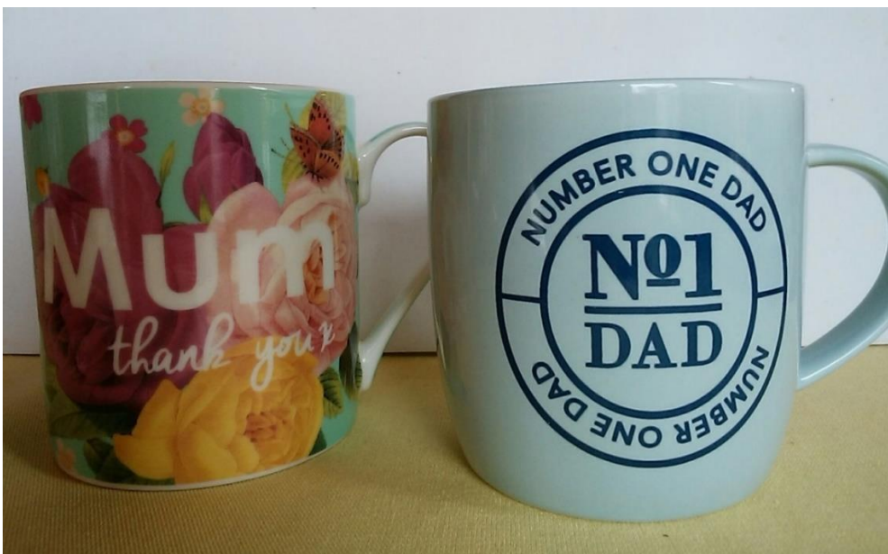
Figure 16 Photo: Mugs as demonstrations of transnational kinship

When I went back home to Japan and saw my parents using these mugs for breakfast every day, I felt that even though the social worlds inhabited by daughter and parents are culturally, temporally and geographically far apart, such ordinary objects effectively work for the transnational family as ‘inner dialogues’ (Svašek 2010: 868) with the absent family member to maintain strong ties between them.