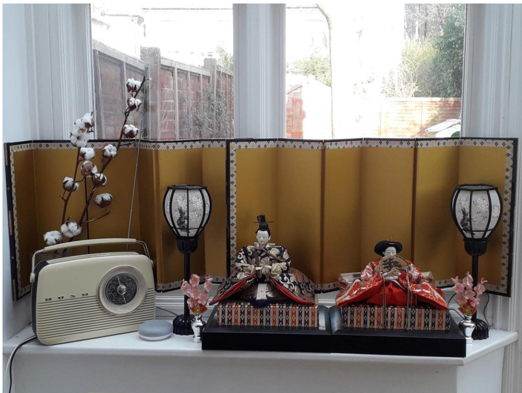
Figure 8 Photo: Japanese traditional dolls celebrating the Girls' festival at Saki's home

similar childhood histories, memories and understandings of the cultural value of the wedding dolls, each practices the tradition in the UK in a slightly different way, adding original meanings to this practice. While Saki follows the tradition, Chizu re-interprets these dolls as a symbol of her transnational kinship. I found it interesting to see how this case illustrated both the reflexivity of individual agents, which left room for improvisation and creativity, and the way their actions are always 'to some extent circumscribed by previous events and experiences' (O'Reilly 2012b: 29).