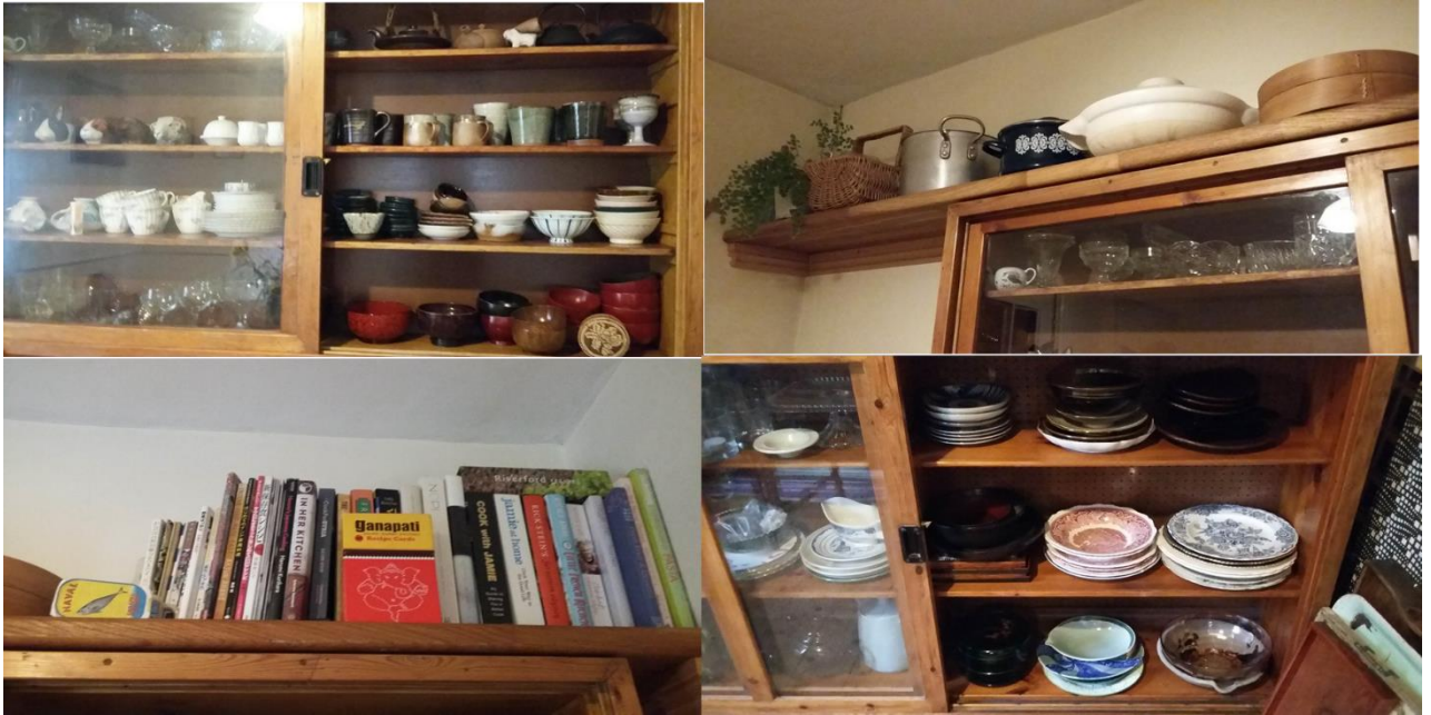
Figure 6 Photo: Ai's Kitchen cupboard

Likewise Mika's, Ai's cupboard is also full of mix of Japanese and British dishware.