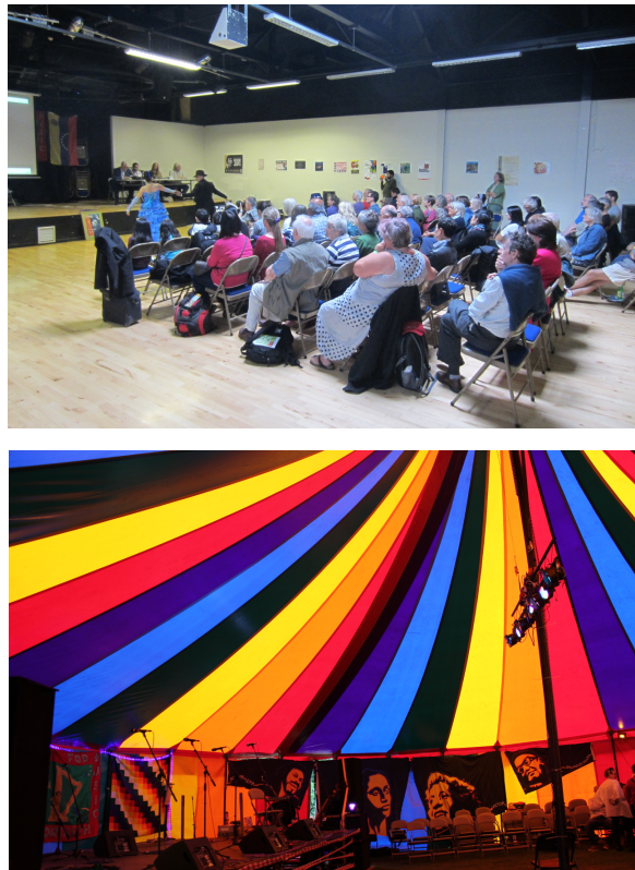
Figure 4. The main places of the festival: Y Plas and The Marquee

of Latin American and Welsh culture. The other two rooms are smaller. During the festival period, the organisers rename the rooms 'V́ctor Jara Room' and 'Violeta Parra Room'. Outside the main building, there is a big green area with a marquee. Inside this marquee is a stage and chairs, and behind the marquee's main stage, there are four paintings affixed to the wall – portraits, painted by Polly Henderson and Keith Jackson, of V́ctor Jara, Violeta Parra, Ali Primera and Salvador Allende. Near to the marquee, there is also a woodland or outdoor green area with stalls which is used as social space for festival-goers, and for ad hoc performances.