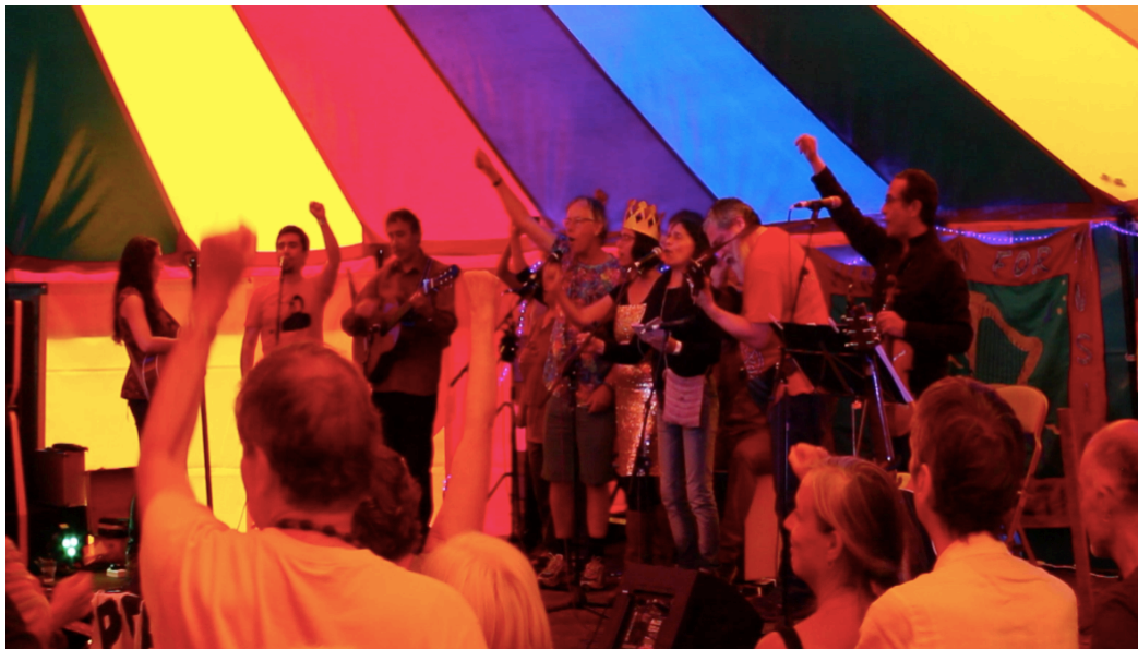
Figure 10. Performance 'El Pueblo Unido'. El Sueño Existe festival 2017

According to Mularski (2014), the song 'El Pueblo Unido Jamás Será Vencido' was part of the intense emotional and political separation between the left and the right during Popular Unity, promoting a revolutionary destiny and evoking strong political images through its lyrics. This song symbolises the 'spirit of militant optimism' lived in this period (Morris 1986, p.122). The first lines of the lyrics say 'Arise, sing. We are going to win'. The song calls for the listener to stand up and struggle. The lyrics refer to a 'new awakening', 'a better life' enacting the fantasy of another and better world. The lyrics of the song propose a metaphoric empowerment of people who rise up and shout like a giant, a symbolic inversion of roles between the people and the powerful ruling class. 'El Pueblo Unido' was also relevant after the coup, sung by Inti Illimani and Quilapayún in their concerts, and translated into different languages; this song was performed with masses of people, demonstrating an ability to convene higher numbers of people than the politicians could muster (McSherry 2016, p.3).