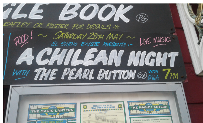
Figure 6. Promotion 'A Chilean Night' by The Magic Lantern. 28 May 2016