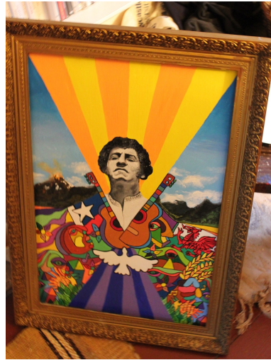
Figure 11. Painting by Stuart Hampton. Organisation Meeting 29 Oct 2016