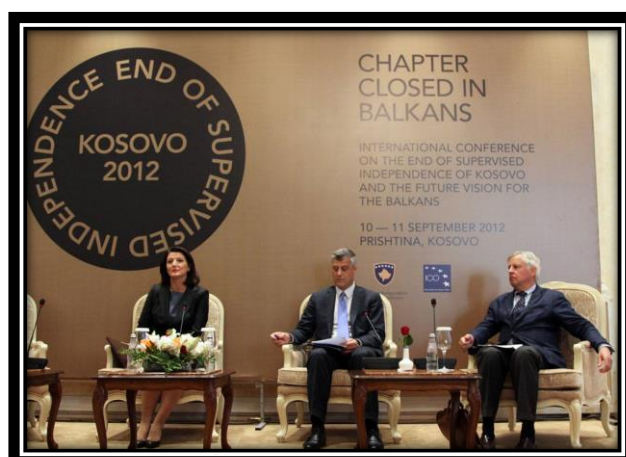
Figure 2- International Conference on the End of Supervised Independence (Office of the President of Kosovo, 2012)

It is held in the centre of Pristina at the Swiss Diamond hotel. The conference is called: “Chapter closed in Balkans, International conference on the end of supervised independence of Kosovo and the future vision for the Balkans, 10 to 11 of September 2012 Pristina.” It is divided into three sessions focused primarily on Kosovo’s next steps; “Transition in a time of globalisation”, “Approaching a half decade of independence: the scorecard”, and ending with “What’s next for societies and economies in the Balkans?.” The messages of the conference and the language used repeat the temporal themes expressed by the newspapers: marking time as a break from a past of supervised independence on the one hand, and a European future on the other. Today the present is sandwiched between the two temporal orientations.