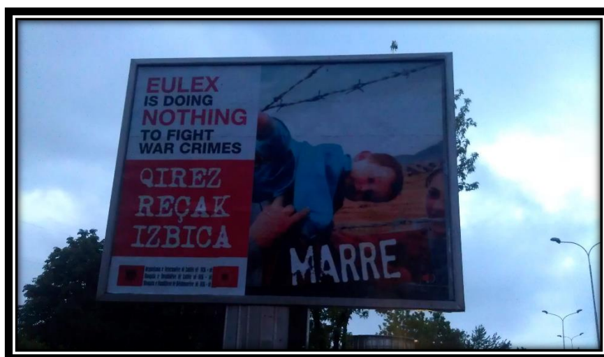
Figure 1 – Billboard in Pristina, author's photo, 2013

EULEX has thus faced harsh criticism from all sides, including unwelcoming graffiti opposite EULEX Headquarters with the slogan “EULEX made in Serbia” (A’Mula, 2009) and billboards, such as the one in the image below, accusing EULEX of “doing nothing” (see for example Kosova Press, 2013).