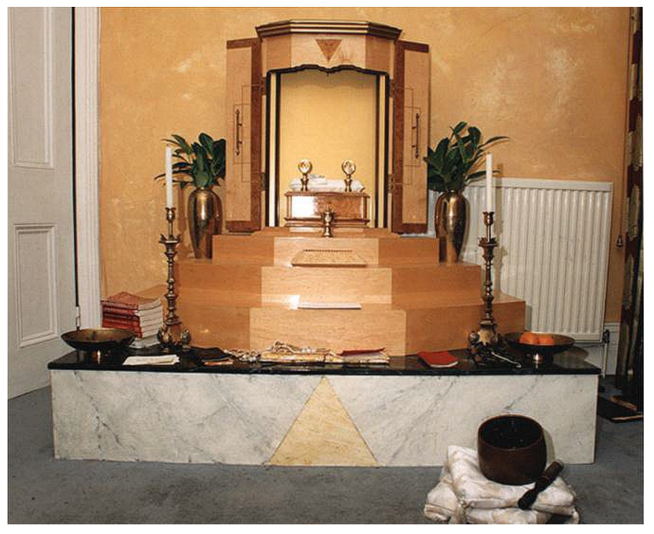
Figure 6.1 Photograph of an SGI altar (The Gohonzon is not included in this photograph on the grounds that within SGI, photographs of Gohonzons are prohibited. Evergreens are offered as

Deciding to become a member of SGI in Buddhist terms is therefore undertaking to develop the bodhisattva spirit. One's application is usually sponsored by the person who introduced one to the practice, and a chapter leader will visit the applicant's home to clarify for themselves that the applicant is doing the three basic practices and has been for at least three months. These practices are the twice daily recitation of daimoku (the mantra Nam myoho-renge-kyo ), gongyō (portions of the Lotus Sūtra ) morning and evening, attendance of district and chapter study meetings, sharing the practice with others and personal study (which may involve simply reading SGI-UK's monthly magazine Art of Living ). The chapter leader's visit to the applicant's home is to ensure that the applicant is able to understand what is involved and is willing to commit themselves to fulfilling this for the rest of their life. Also that the applicant has a butsudan (a cabinet that houses the Gohonzon ) and a suitable place within their home for a Buddhist altar (photograph of a typical one below):