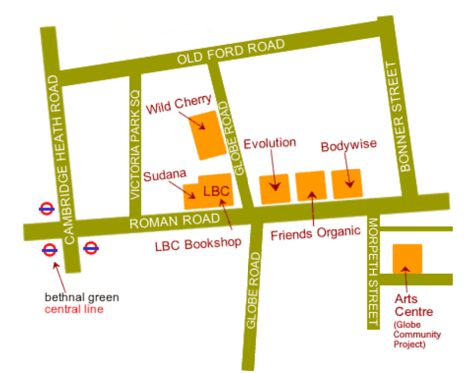
Figure 3.3: Map of LBC community businesses (Team Based Right Livelihoods) in the Bethnal Green Globetown area (from LBC website)