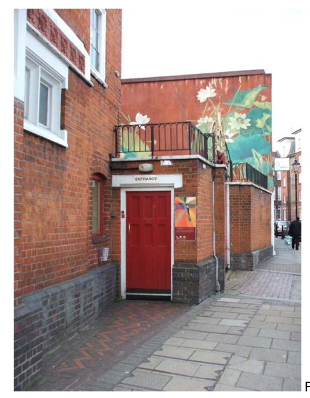
Figure 3.2: LBC main entrance