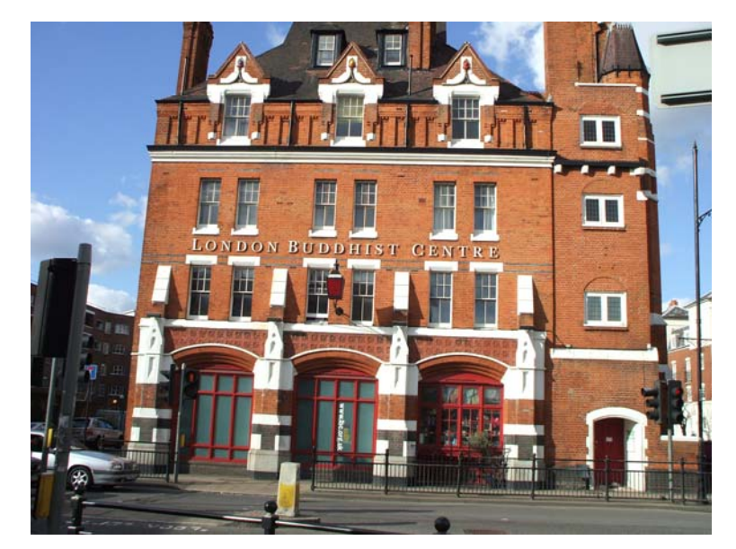
Figure 3.1: The London Buddhist Centre (LBC)

This suggests that the FWBO initially saw its practice of engaged Buddhism very much in terms of developing itself and its institutions as opposed to developing and supporting collective responses to issues arising within the localities in which it was based. Through such an approach it was envisaged that what Sangharakshita describes as a 'New Society'<sup>2</sup> in the midst of the 'Old Society' would develop through formation of a network of centres, communities and right livelihood businesses (initially co-operatives).<sup>3</sup> It could be argued that the stance taken by the LBC at that time was extremely pietistic when compared to that of other local faith communities, many of which have a longstanding engagement with local concerns of poverty, social exclusion and 'race'. Some have been involved in these local issues from their outset (Leech, 2001(Holtam & Mayo, 1995). The LBC and its associated communities and community businesses have been seen as constituting a 'sort of Buddhist village' (Subhuti, 1988, p. 150, 2001), and a 'Buddhist enclave' (Leech, 2001 p. 137). For details of key features in this village see, figures 3.1 of the LBC), 3.2 (of the LBC entrance and 3.3 (a map of key sites in the 'Buddhist village') below: