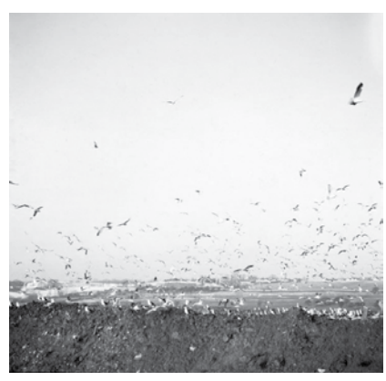
Two Tree island as a landfill (C) Robert Hallman (date thc)

The estuary remains one of the major wilderness zones surrounding London and has a vast capacity to support ecosystems and provide significant food stocks. The shallow waters, protected by intertidal muds, host cockles and oyster beds as well as providing grounds for juvenile species of bass, herring and sole. Despite this, anecdotal and local knowledge suggests that, for unknown reasons, these fish stocks are not maturing and have depleted in recent years.(3)