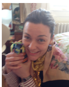
Image 2: No longer a researcher , the photograph is of a seal, who has just dined at a restaurant on pea and mango soup, her beautiful coat and shawl draped over her shoulders. The seal is walking out the door of the restaurant clutching her souvenir dinosaur.