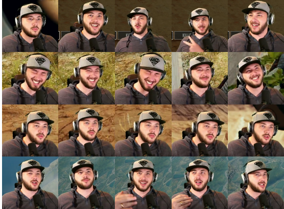
Figure 3: Sequences from episodes extracted by applying [9] on face video, player audio, and game footage.

features are extracted by using the principal components of Fourier coefficients, while subsequently a recurrent layer is used for fusion. The premise is that a high reconstruction error points to novelty, and novelty can be considered as a proxy for detecting interesting parts of the stream. This also deems the method suitable for segmenting a long stream into episodes that are likely to contain emotional and social content, especially when utilizing the streamer’s face and voice. Evaluation was carried out on over 5 hours of footage broadcasted by two streamers playing a popular game. Results presented in [9] show that, as expected, analysis of facial expressions and audio significantly increases the precision of detected episodes, compared to simply using the game footage. In Fig. 3, we show some sequences from detected episodes where social and behavioural signals can be observed. In the first row, the sequence shows the player winning a game and reacting positively to this. In the second, the player is reacting to an in-game event. In the third row the player appears intrigued. Finally, in the fourth row the streamer is interacting with viewers.