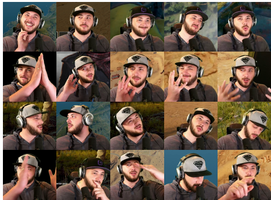
Figure 2: Camera stills from a typical game stream, including various facial expressions, body gestures, head poses, as well as challenging frames with face occlusions.

expressions and gestures respectively, as expressed by the streamer while communicating with viewers and other streamers. The third and fourth rows contain stills capturing head pose variability, as