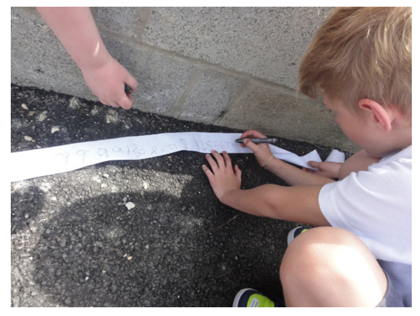
Figure 3 . ArtScapers have explored looking differently by scaling things up, recycling yourself, tuning in to the sky and renaming.

thinking. They find ways to take on a different point of view. Looking differently is a conscious action to make the familiar strange by intentionally changing scale, dimensions, direction, and orientation; viewing our environment from a new angle; and challenging ourselves to use our senses in a different way.