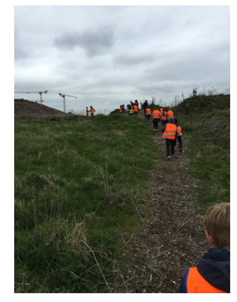
Figure 4 . ArtScapers have been imagining by recycling houses and designing new places for living.

imaginary world as well as the real world rejects a purely rational approach.