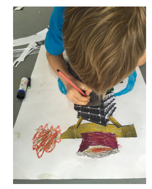
Figure 2. ArtScapers have been curious through prospecting and exploring.

Previoiusly, I discussed the importance of the unknown in creative pedagogy and the space it creates to imagine alternative futures. ArtScapers set out to celebrate the unknown, to suppose, to look, and to think again about something you thought you knew. Being curious is searching for understanding and experimenting with the unexpected. For ArtScapers, curiosity is fostered through not being too focused on finding the answer. In the process of change, searching for finite answers can limit possibilities. This is a space where wonder and speculation are possible.