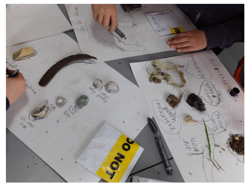
Figure 1 . ArtScapers have been slowing down whilst wandering, revisiting, and thinking about space.

ArtScaping is about taking time to slow down in order to think, to reflect, to rework, to notice things, and to allow things to develop. Slowing down makes a space for deep thinking as opposed to reacting, responding, or following instructions. This is especially important for children. It is a philosophical and conscious action.