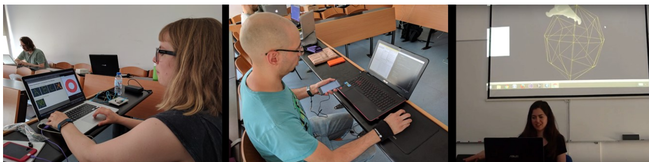
Figure 3 | a) and b) Participants working on their projects and c) presenting a final project.

piano. Technical and conceptual issues prevented the timely delivery of a fully functional hack.