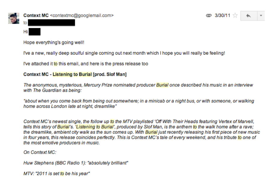
Figure 2: Context: Alignment via email

self with collaborators (line 1 - fig. 1) in order to capture the ears of Intermediary A. I included quotes from famous broadcasters such as BBC Radio 1, and explain how my previous single had been playlisted on MTV.