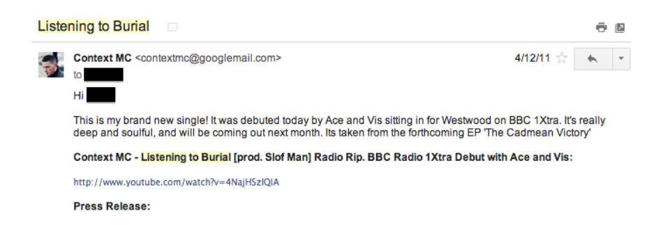
Figure 3: Multiplying support by email

The YouTube rip of the radio premiere was posted to a variety of websites over the following two days (line c). Again, this support was documented by myself (line 4) and was fed back to my existing fans. Additional radio plays had been received during this time, and I fed all of this support back to four more DJs and producers at the BBC (line 1), completing the feedback mechanism on its first 'loop'.