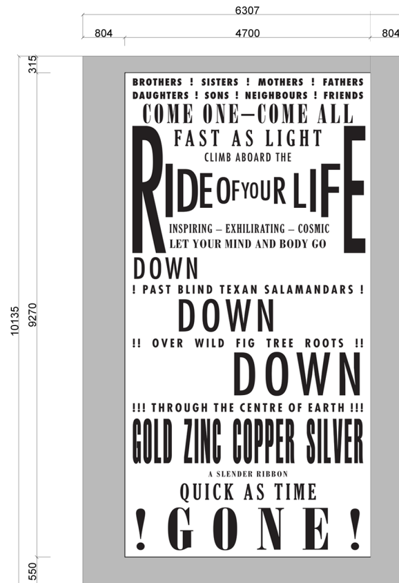
LOCATION A2 MOSAIC AREA= 43.56 SQM