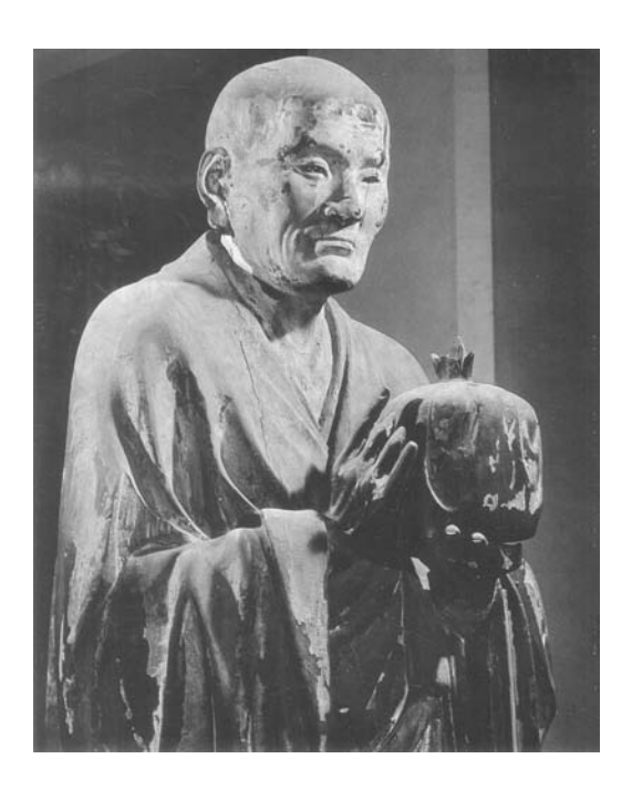
Figure 3. The Indian Patriarch Mujaku by Unkei, 13th century, Kōfukuji, Nara.

the sacred figure. The eye-opening ceremony ( kaigen ) that accompanied the consecration of a statue or sacred object to formally declare it as being animated by its spirit constituted an institutionalized ritual, which reflected the commonly held understanding that statues, paintings, stupas, mandalas, and the like were all living sacred presences.