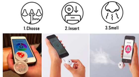
Fig. 3. Tea scent taster system