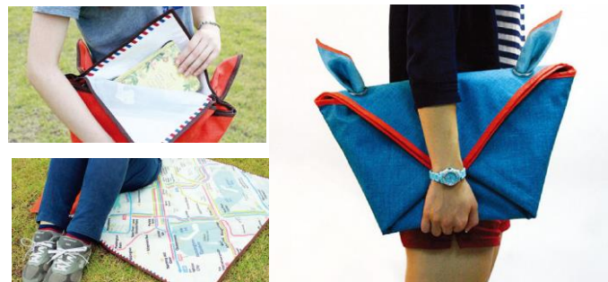
Fig. 4. Picnicking bag of London

The concept of the Picnicking bag of London is that the traditional Korean ‘BOJAKI-wrapping cloth’ can be merged with the British picnic culture by creating a picnic mat which also transforms into a map of the city.