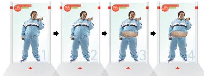
Fig. 5. The door of shame concept

This example from a student response to a brief that juxtaposing two different cultural sensibilities towards the concept of shame in the UK and in Korea. Interestingly while this would never become a product as it could offend its users, it exposes the nuances of Korean and British cultural attitudes to shame. This more in depth exploration of culture permits the students to explore the possible collisions of these attitudes within their design projects. There are clearly limitations to this approach, as it can often rely on preconceived notions and cultural stereotypes, which requires tutor encouragement to understanding culture through better contextual research.