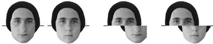
Figure 2. Example of stimuli used in the face composite task. All four top halves are identical; however, they appear different when aligned with different bottom halves (first pair) and similar when the top and bottom halves are misaligned (second pair).