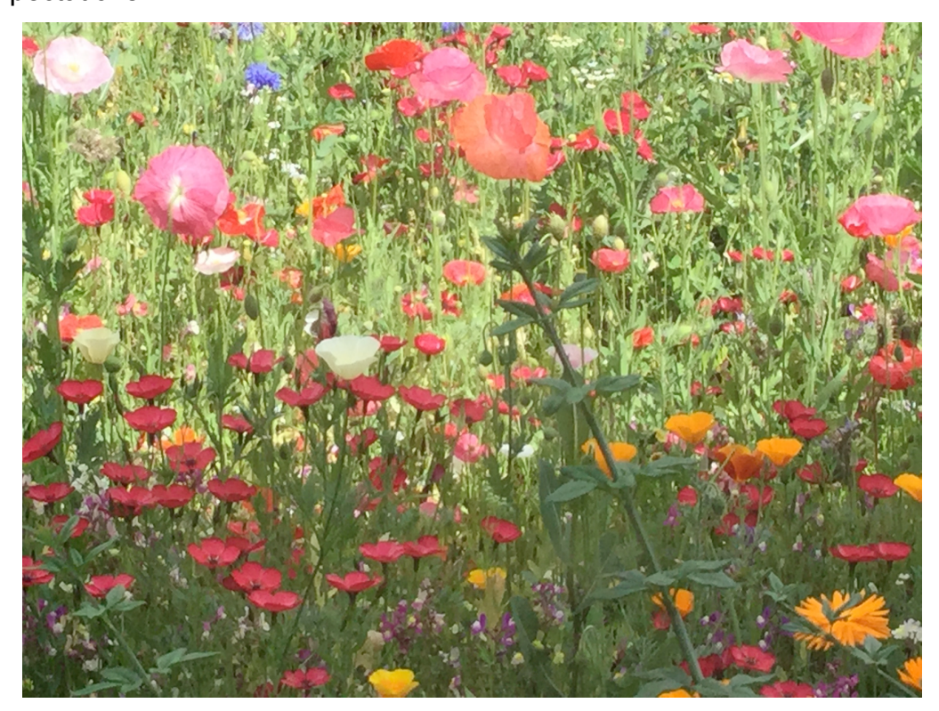
Fig 6: Wild flower border, digital photograph

Altogether there were 25 of us and the atmosphere was a mixture of excited anticipation and cautious self-consciousness. The noisy sirens of New Cross Road blared intermittently, something we have become accustomed to, but now this seemed even more intrusive with visitors present. While opening and closing windows to get a balance between air flow and noise; Lesley and I found ourselves drawing Ron's attention to the attractive wild flower strip outside the window, a border between the studio and the busy road outside (Fig 6). Having visited Singapore several times I was aware of the differences in climate and our institution buildings. London's, grey, rundown, cool, rainyness. Singapore's colourful, well-kept, light, hot-ness. We enthusiastically of the community garden culture in London and the different zones of wealth, poverty, class and ethnic cultures these gardens traversed. Perhaps this was a symbolic liminal space between our different contexts and expectations?