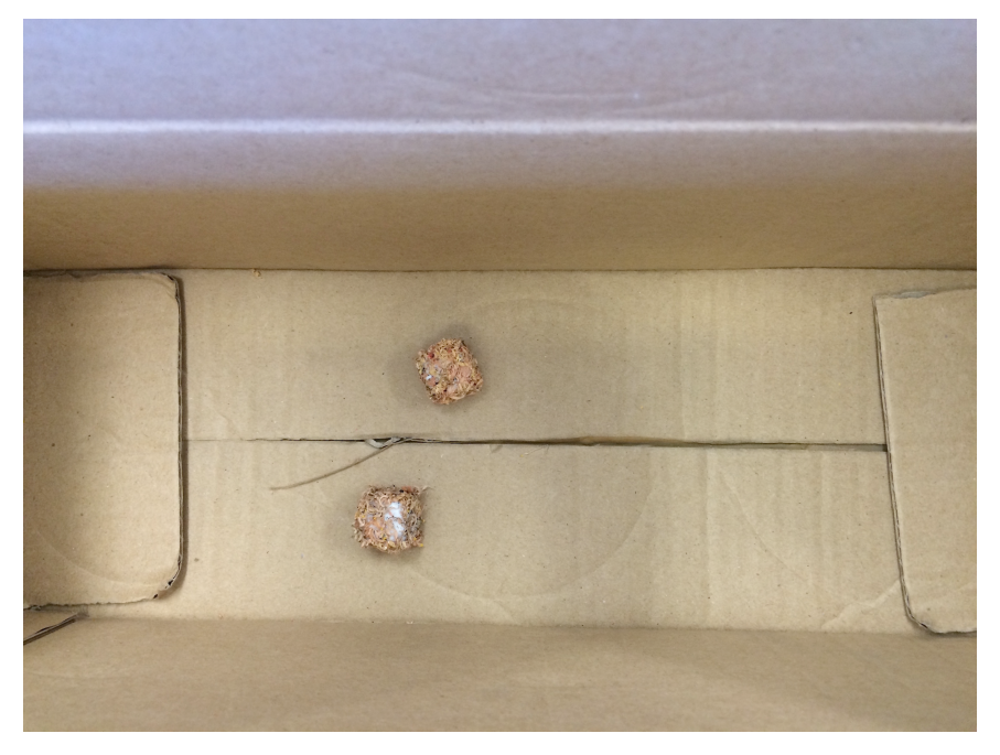
Fig 1b: Containment (with Attractions), 18"x6"x6", cardboard box