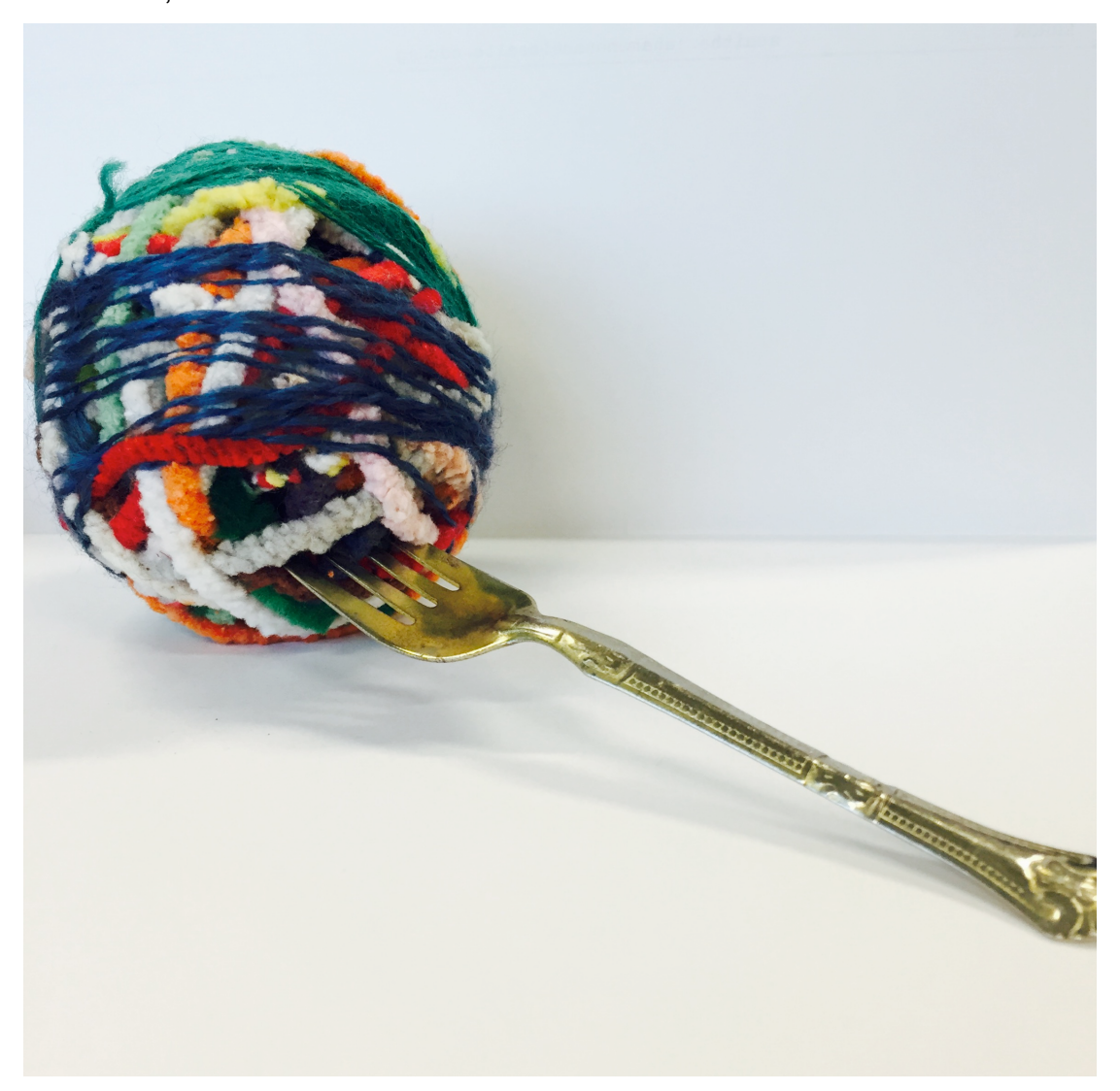
Fig 3: Untitled , 6" x 2.5" x 2.5", found objects

my reflections tremendously and added on the layers of my reflections (Fig 3). That fork in those last moments definitely gave a brand new spin to my reflections, a true treasure!