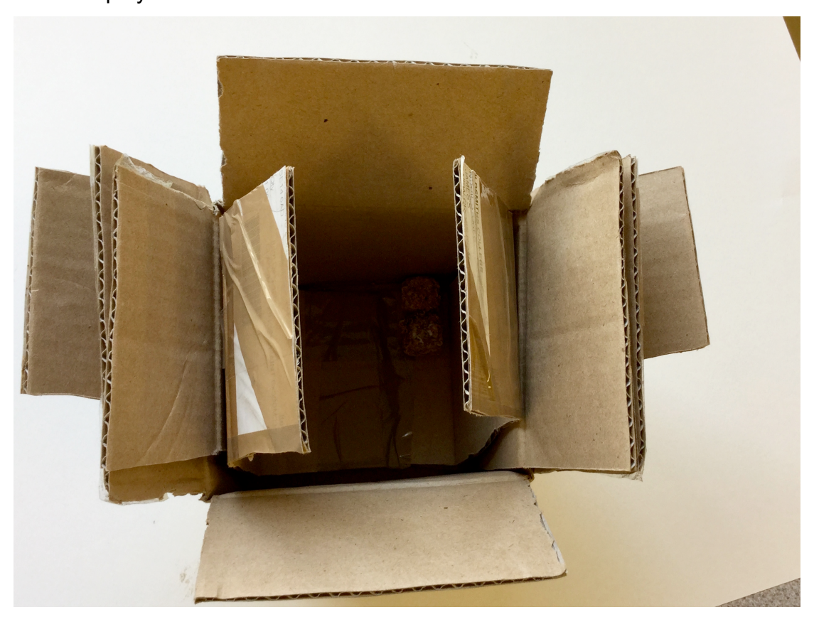
Fig 2: Exchange , 6"x6"x12", cardboard box, masking tape, dice, pencil shavings, white glue

As someone who has lived in three distinct countries, there have been many moves into, out of, and around. Again, associations to boxes, movement, change and containment surface and are quite suggestive of the experience of escorting 15 postgraduate students from one side of the world. I became consciously aware of place, space, difference and similarity, as well as the richness of co-experience and exchange with the importance of maintaining a part of the self while sharing another part with others including strangers and students. I found the student interest in my artwork intriguing as well as their line of inquiry.