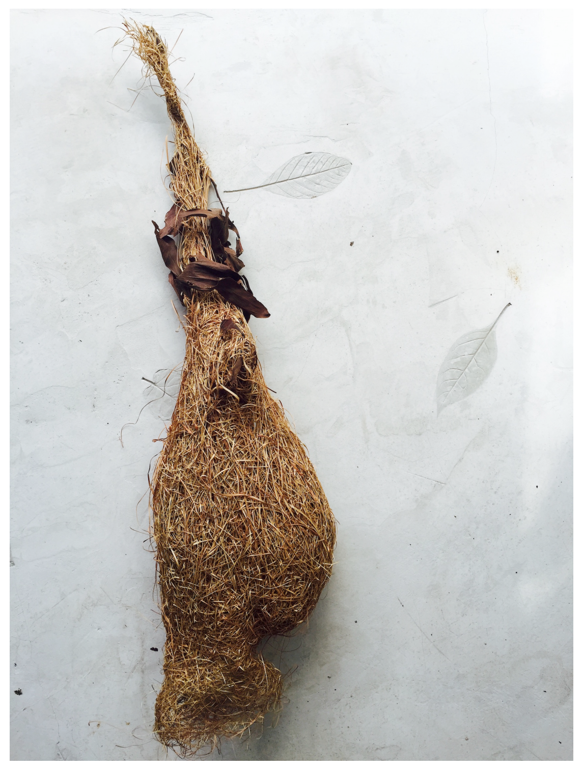
Fig 4: Tempua nest, digital photograph

at least. This led me to further reflect on the intersection between gender roles and therapeutic or supervisory relationships.