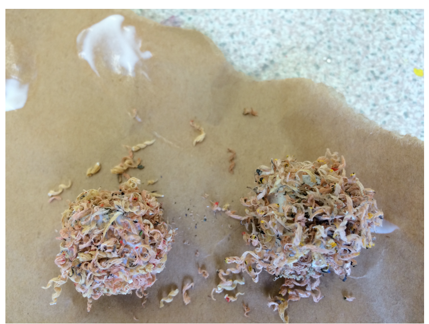
Fig 1a: Attractions , variable dimensions, plastic dice, pencil shavings, white glue

and began to reinforce the torn edges with masking tape. The label on the box indicated that this was sent to the Goldsmiths Art Psychotherapy department and that it had contained art materials, most likely shipped in from afar, possibly even from Asia; more associations. Once dried, the shavings encrusted dice were gently placed in the cardboard box and left aside for part 2 of the workshop, scheduled four days later (Fig 1b).