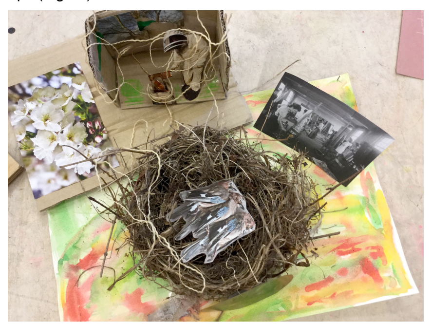
Fig 8a: Bee-keeper assemblage - view from above, 4" x 10" x 12", cardboard, paper, string, nest material

and made links to the end of year and students leaving. I'd found a Chinese horse character seal and I put it on the front of the nest, symbolic of our exploratory connections. There was also an image of a Goldsmiths art studio from around 1950s. I thought of the history of Goldsmiths and of us making its history now, and about the interweaving of a nest, our connections and relationships (Fig 8b).