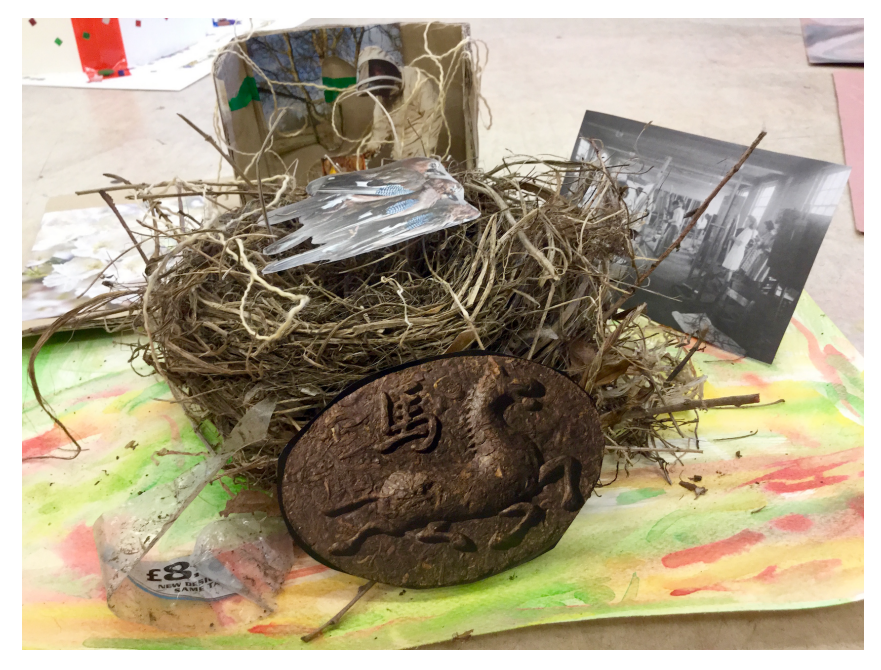
Fig 8b: Bee-keeper assemblage - view from front, 4" x 10" x 12", cardboard, paper, string, nest material