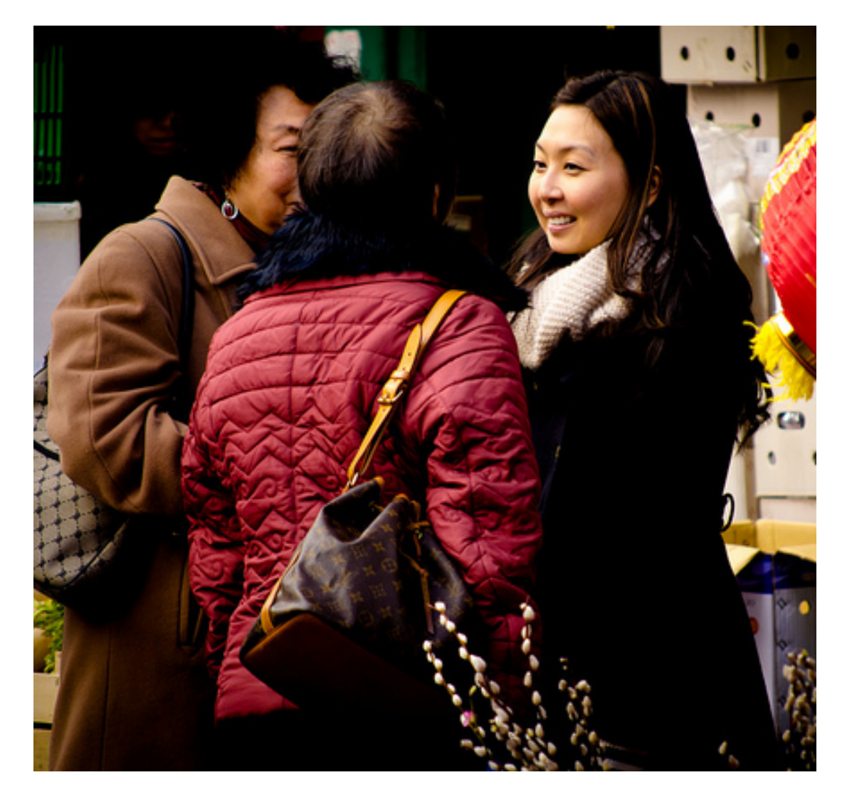
"A Chat in Chinatown"